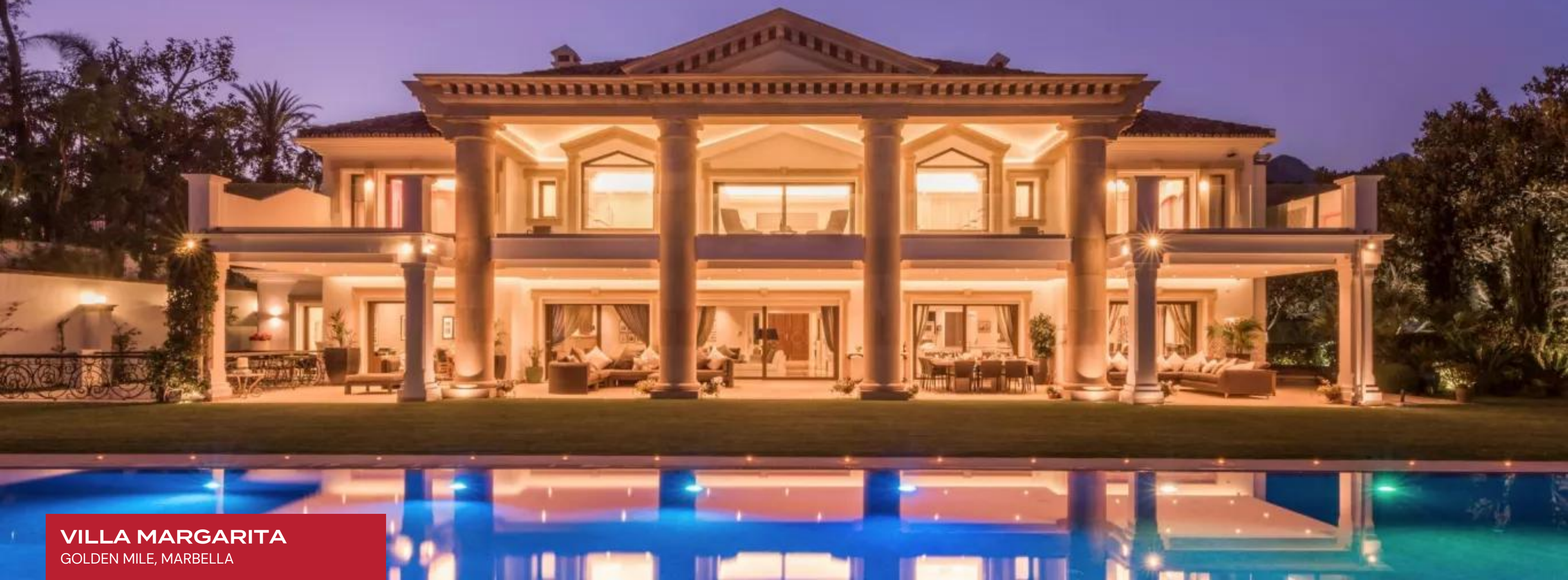
VILLA MARGARITA GOLDEN MILE, MARBELLA