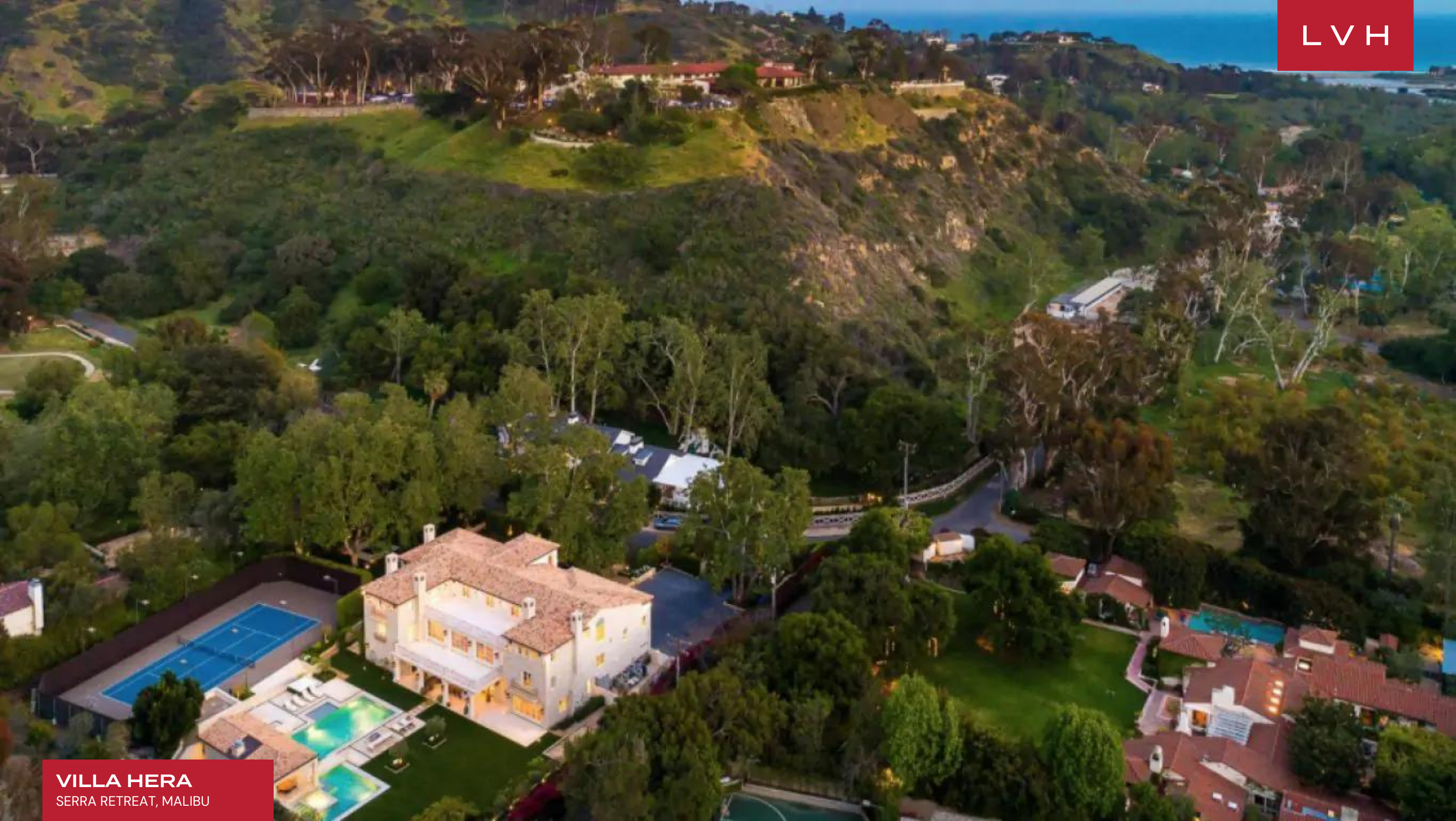
VILLA HERA SERRA RETREAT, MALIBU