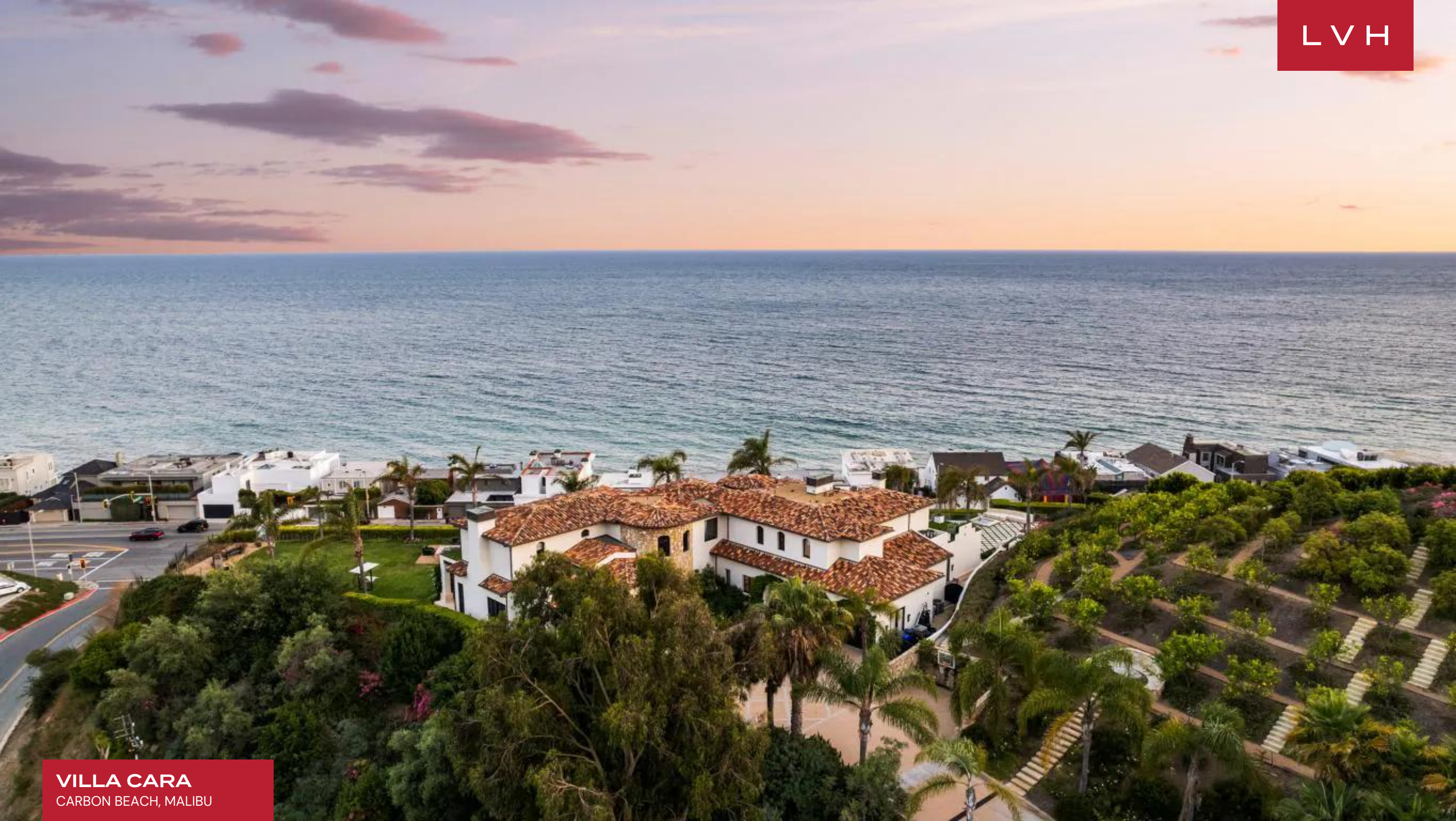
VILLA CARA CARBON BEACH, MALIBU