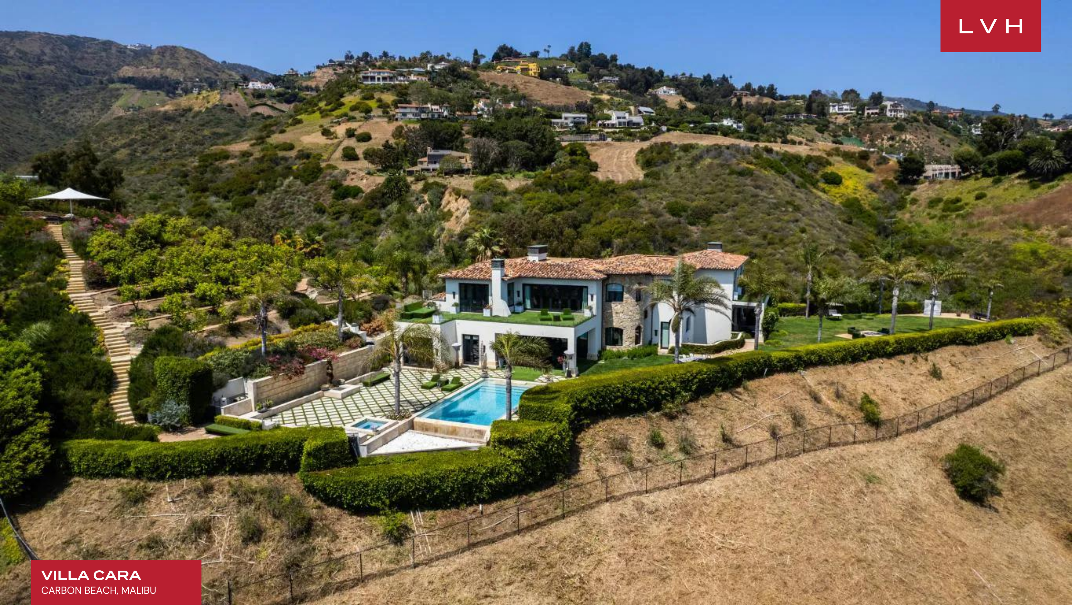
VILLA CARA CARBON BEACH, MALIBU