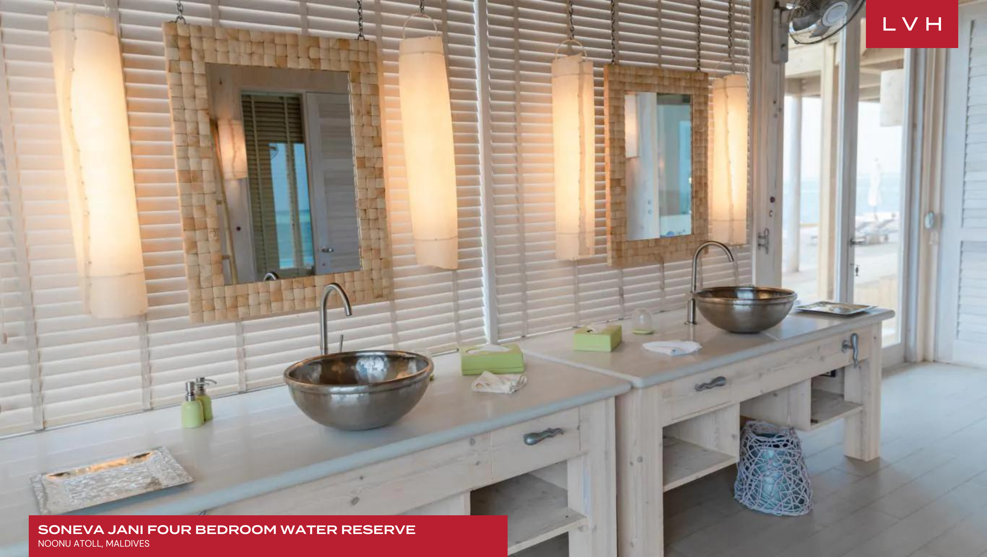
SONEVA JANI FOUR BEDROOM WATER RESERVE NOONU ATOLL, MALDIVES