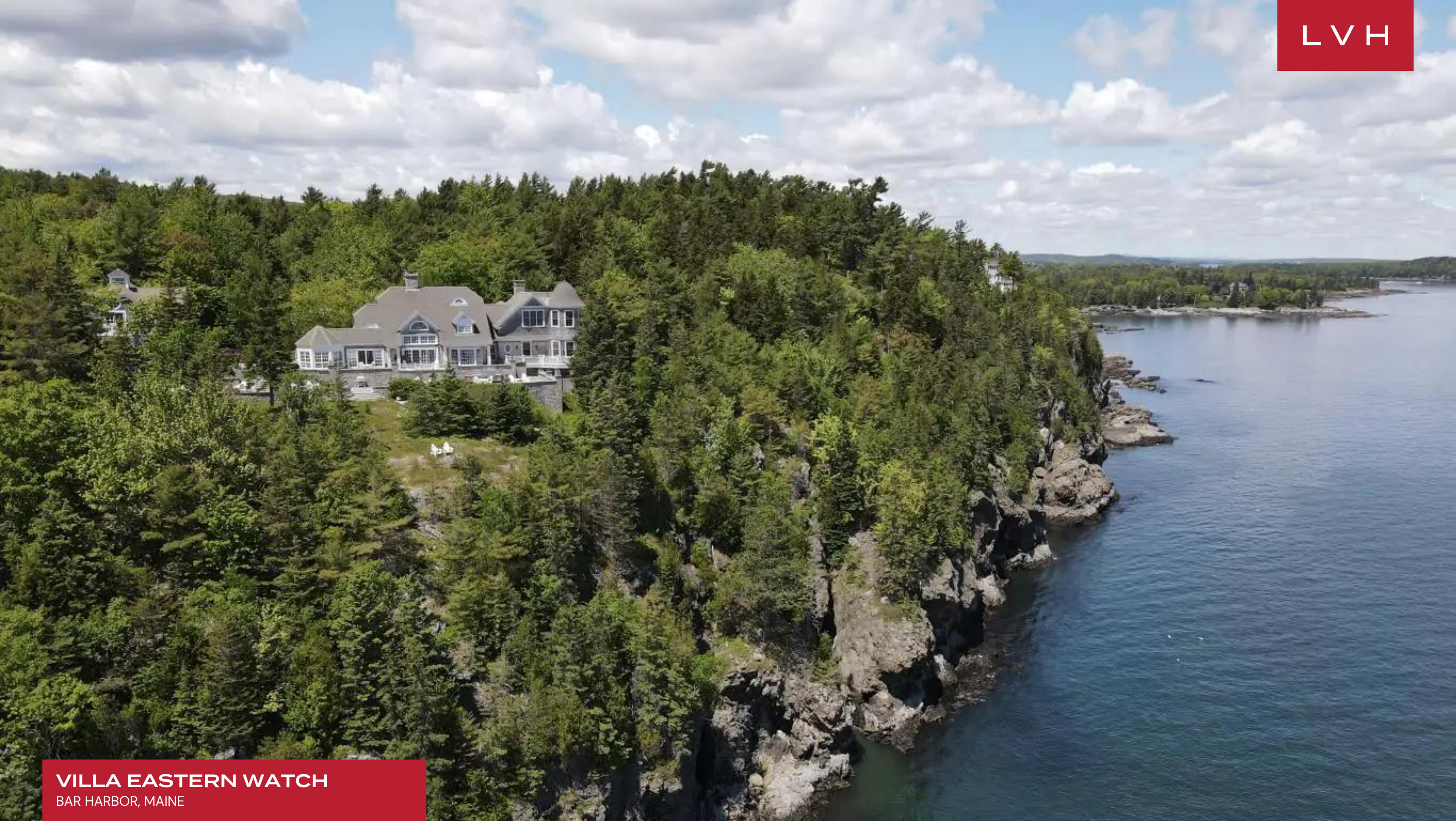
VILLA EASTERN WATCH BAR HARBOR, MAINE