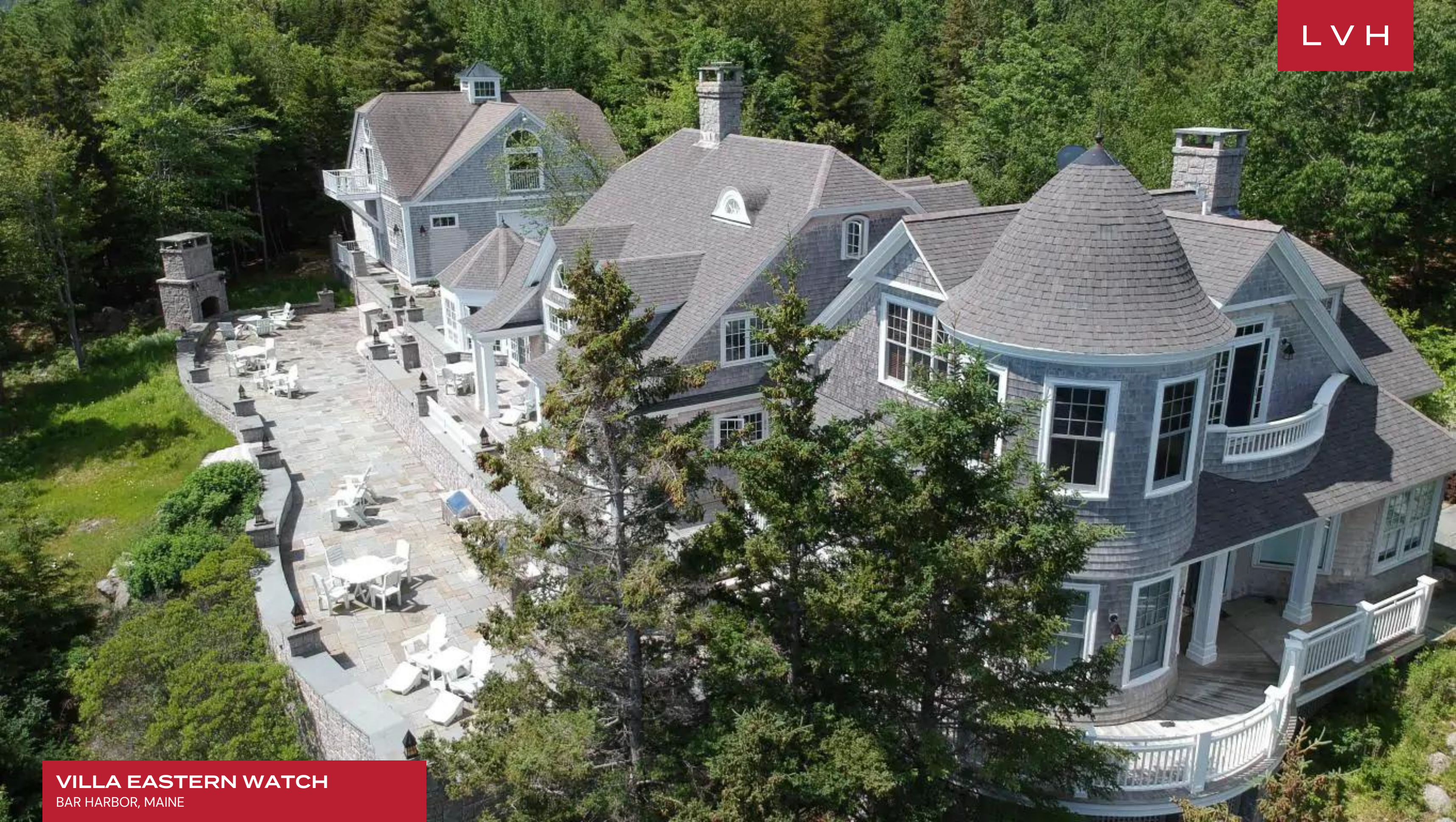
VILLA EASTERN WATCH BAR HARBOR, MAINE