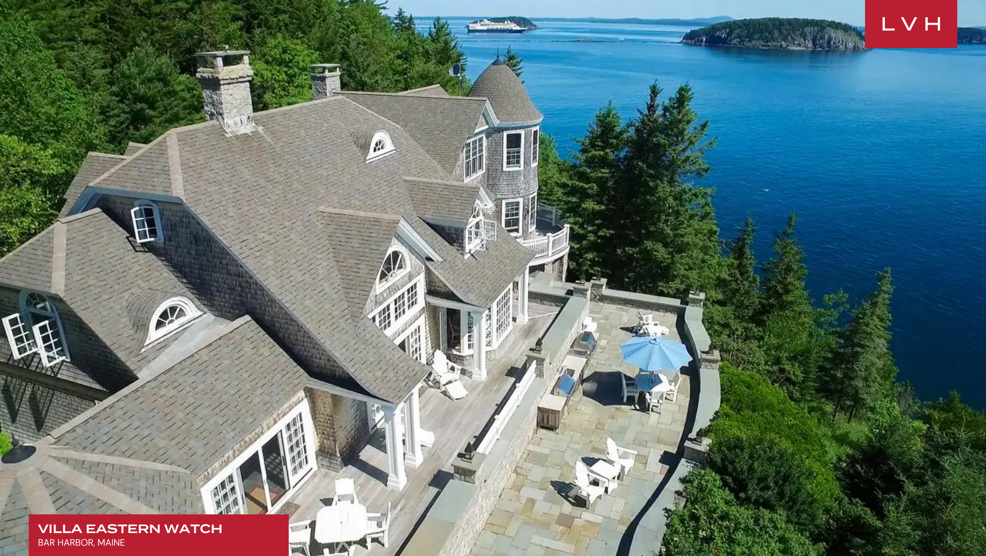
VILLA EASTERN WATCH BAR HARBOR, MAINE