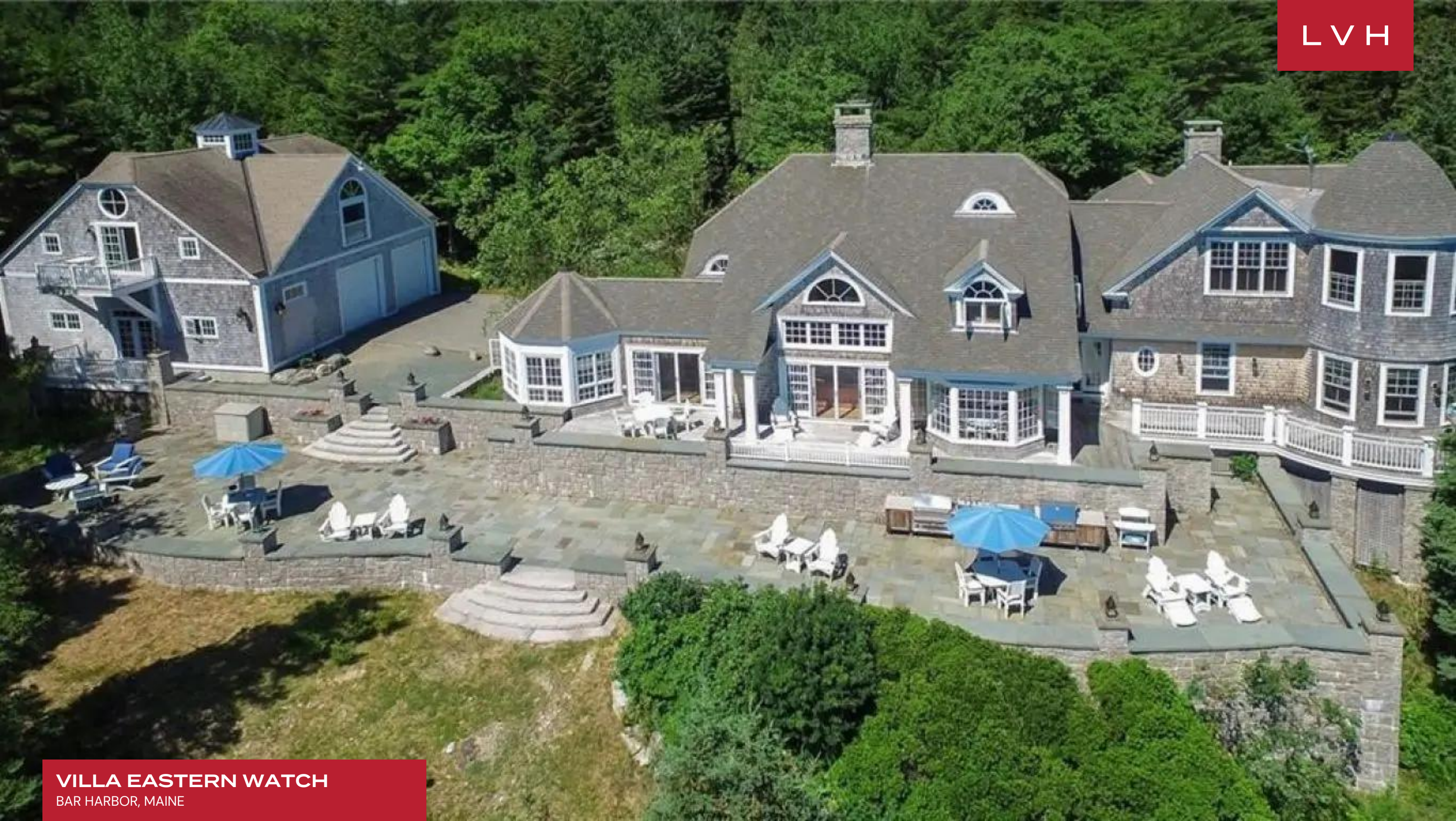
VILLA EASTERN WATCH BAR HARBOR, MAINE