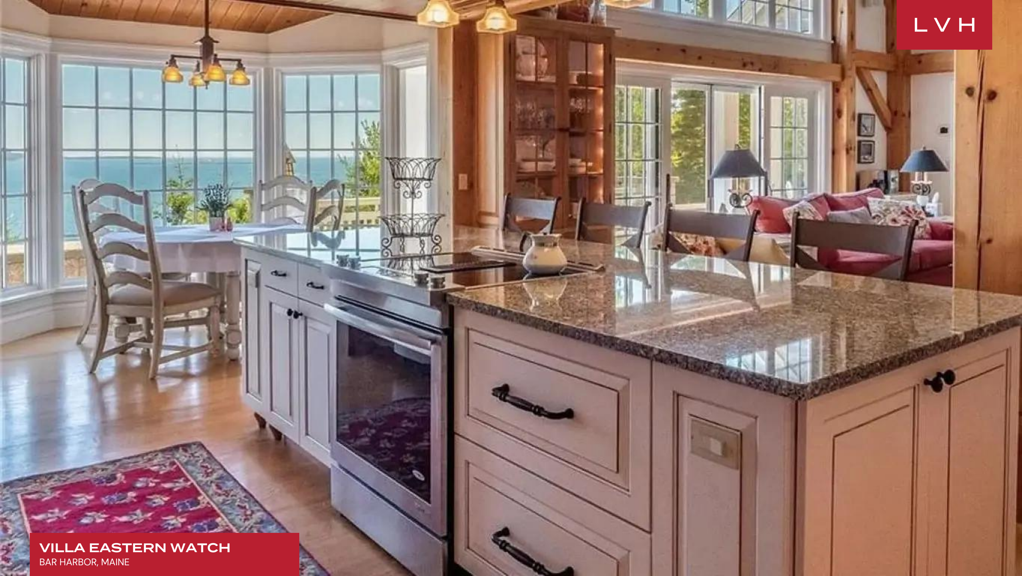
VILLA EASTERN WATCH BAR HARBOR, MAINE