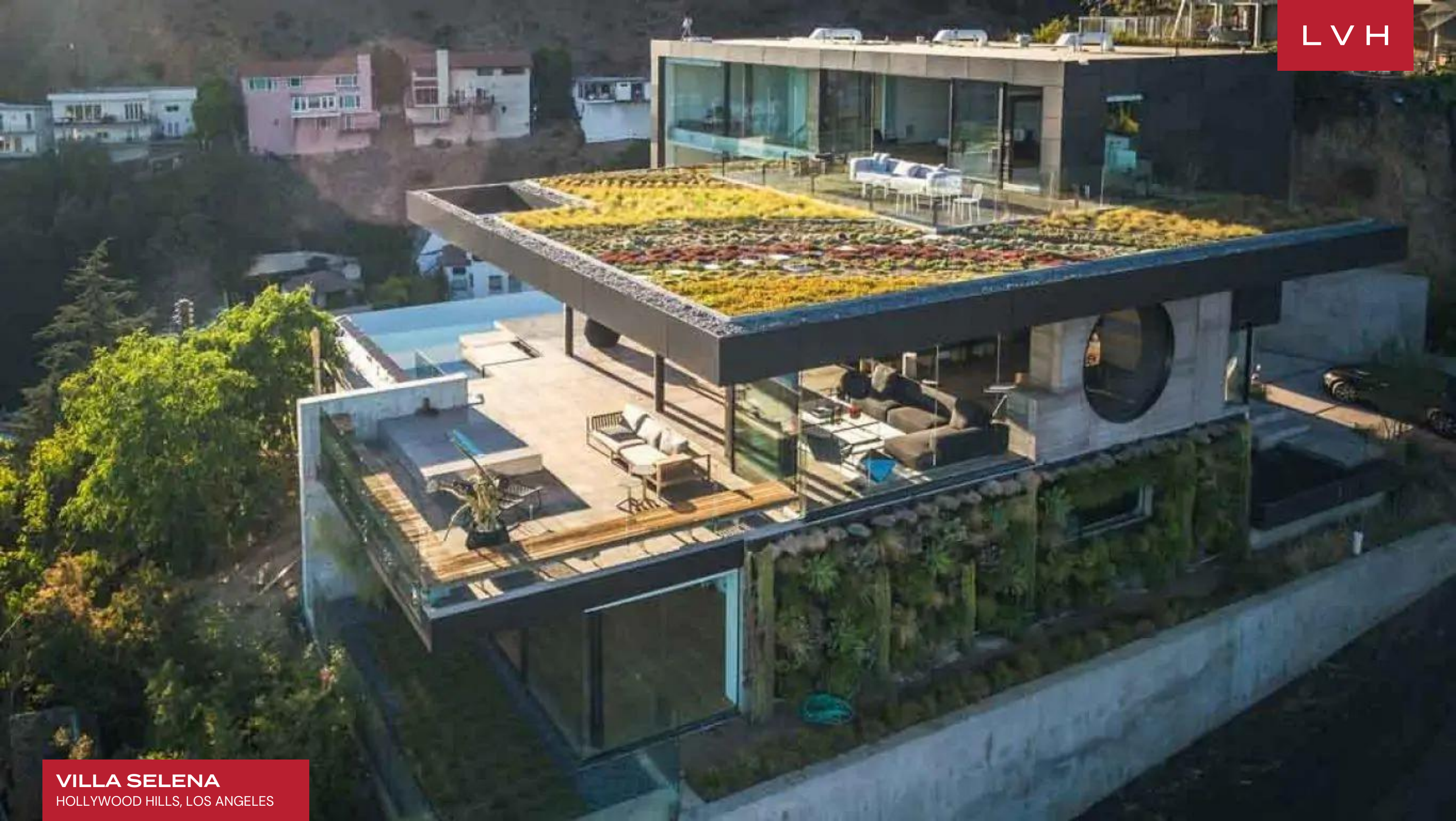
VILLA SELENA HOLLYWOOD HILLS, LOS ANGELES