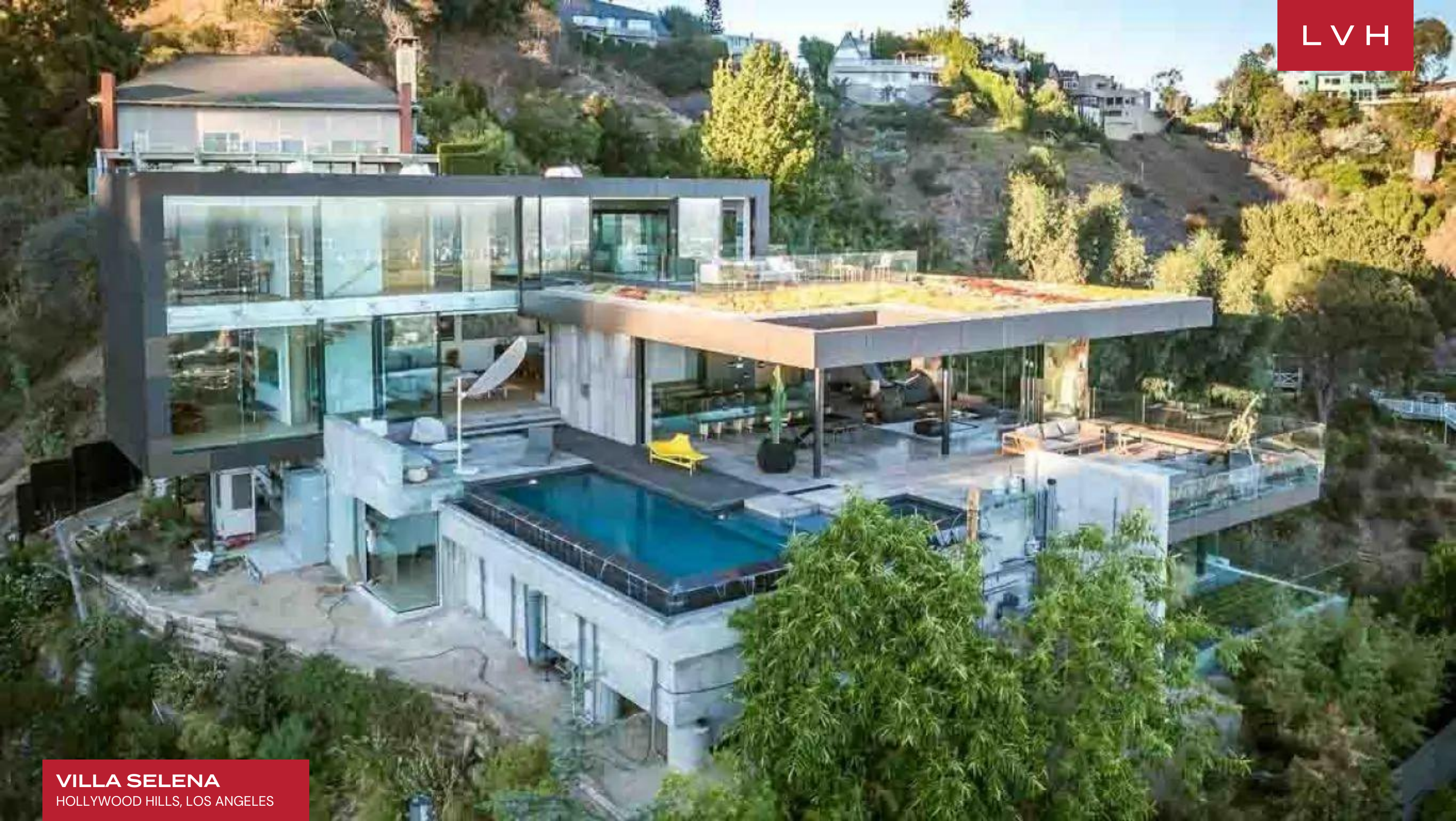
VILLA SELENA HOLLYWOOD HILLS, LOS ANGELES