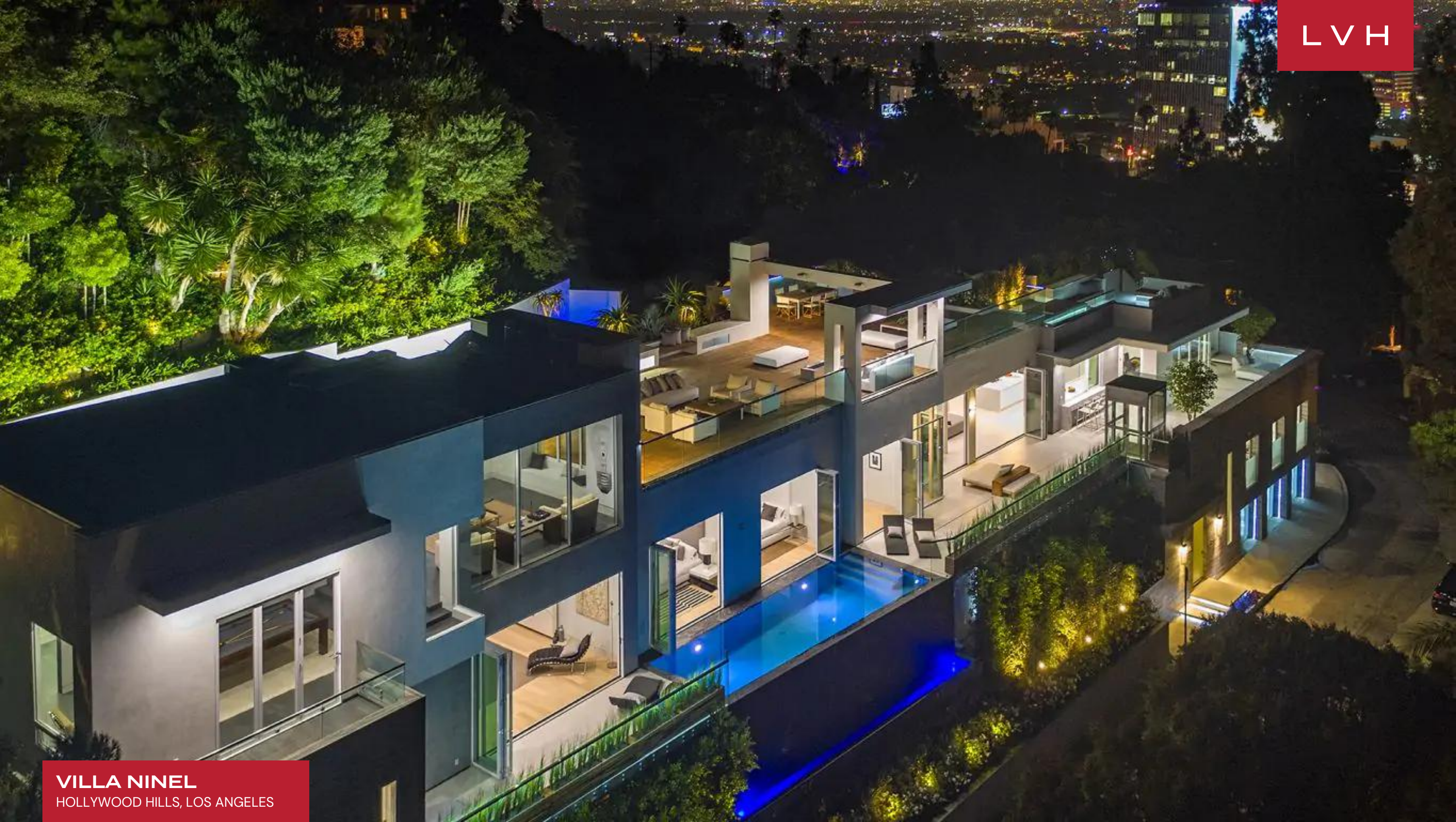
VILLA NINEL HOLLYWOOD HILLS, LOS ANGELES