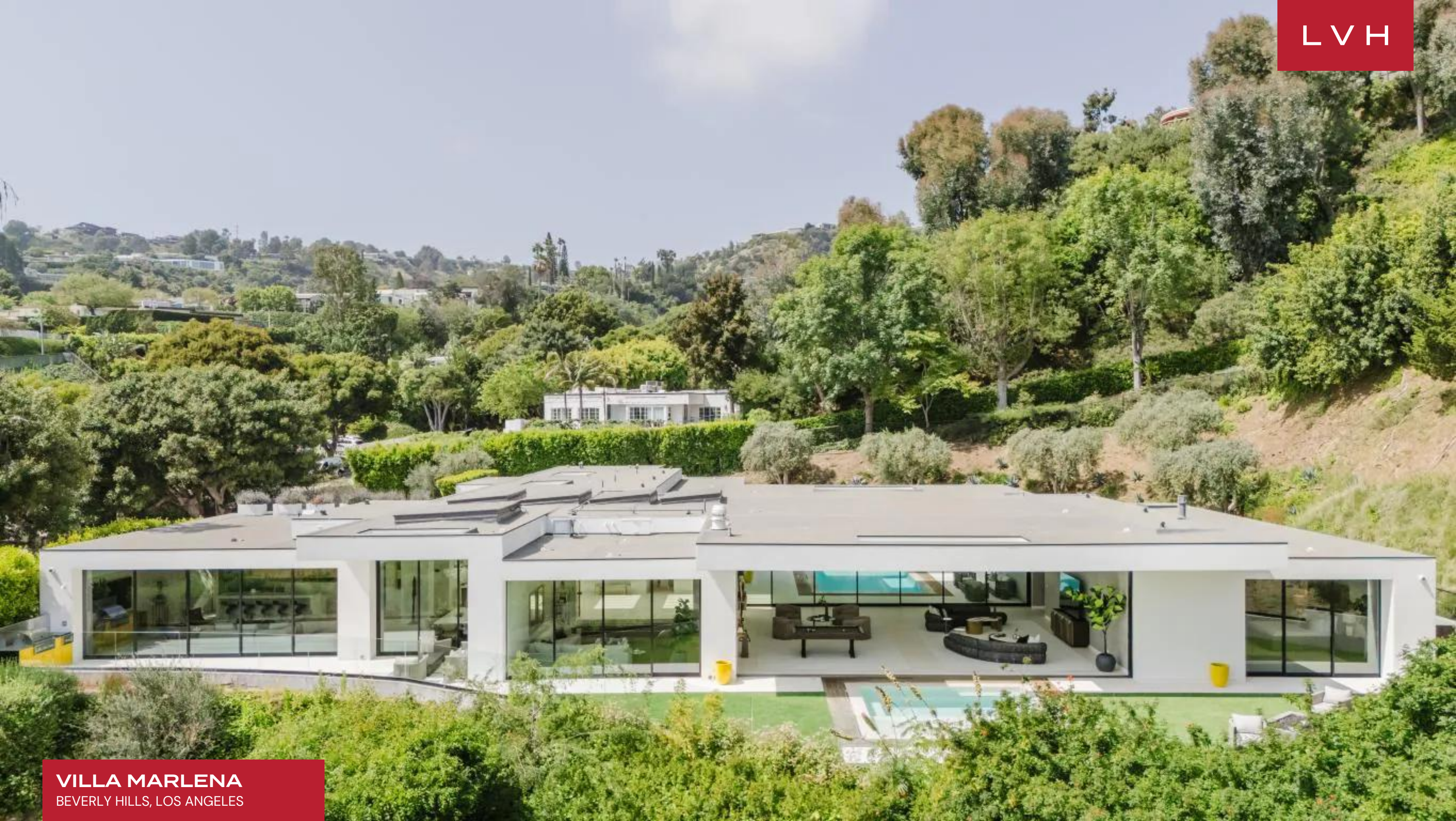
VILLA MARLENA BEVERLY HILLS, LOS ANGELES