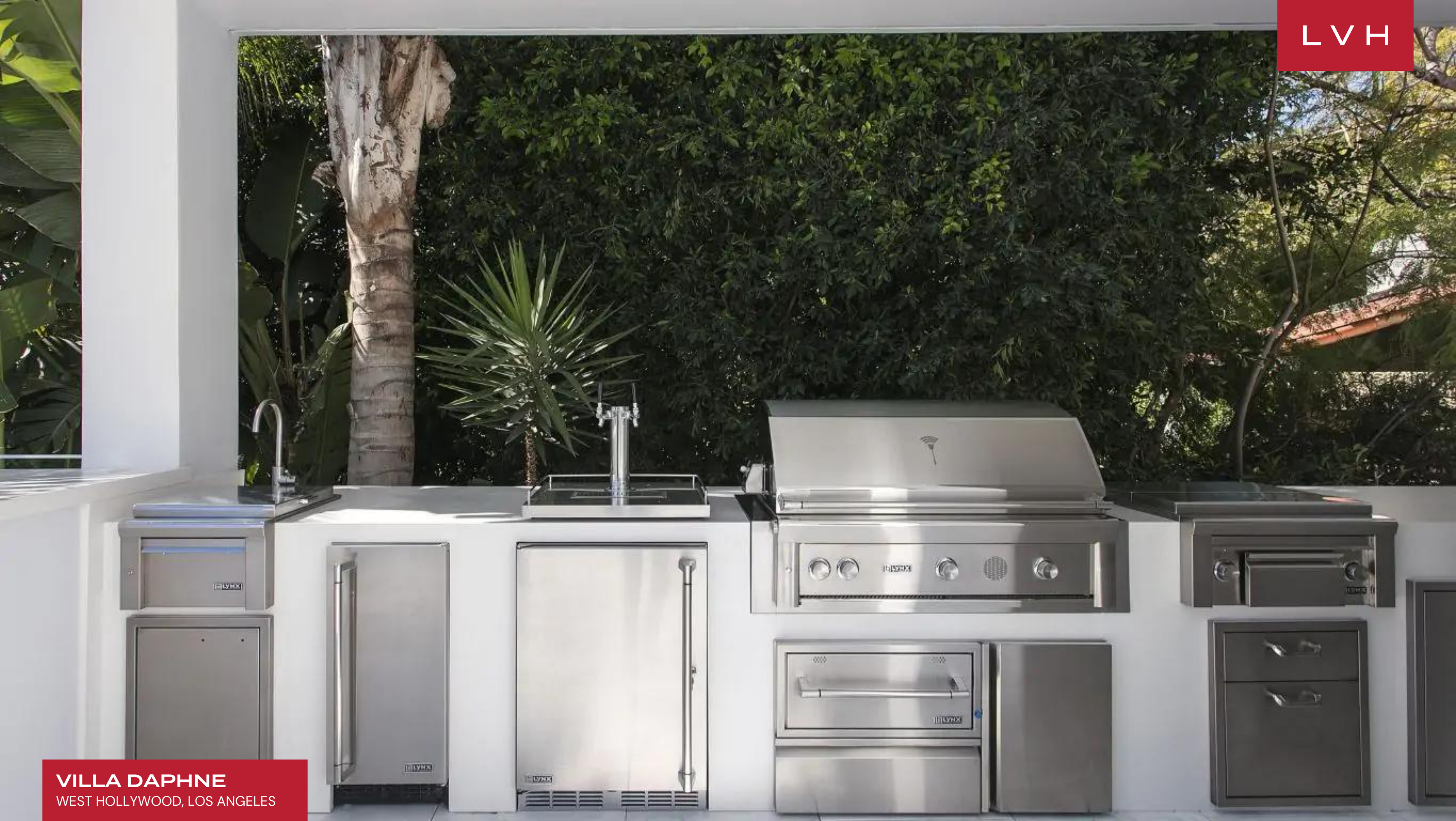
VILLA DAPHNE WEST HOLLYWOOD, LOS ANGELES