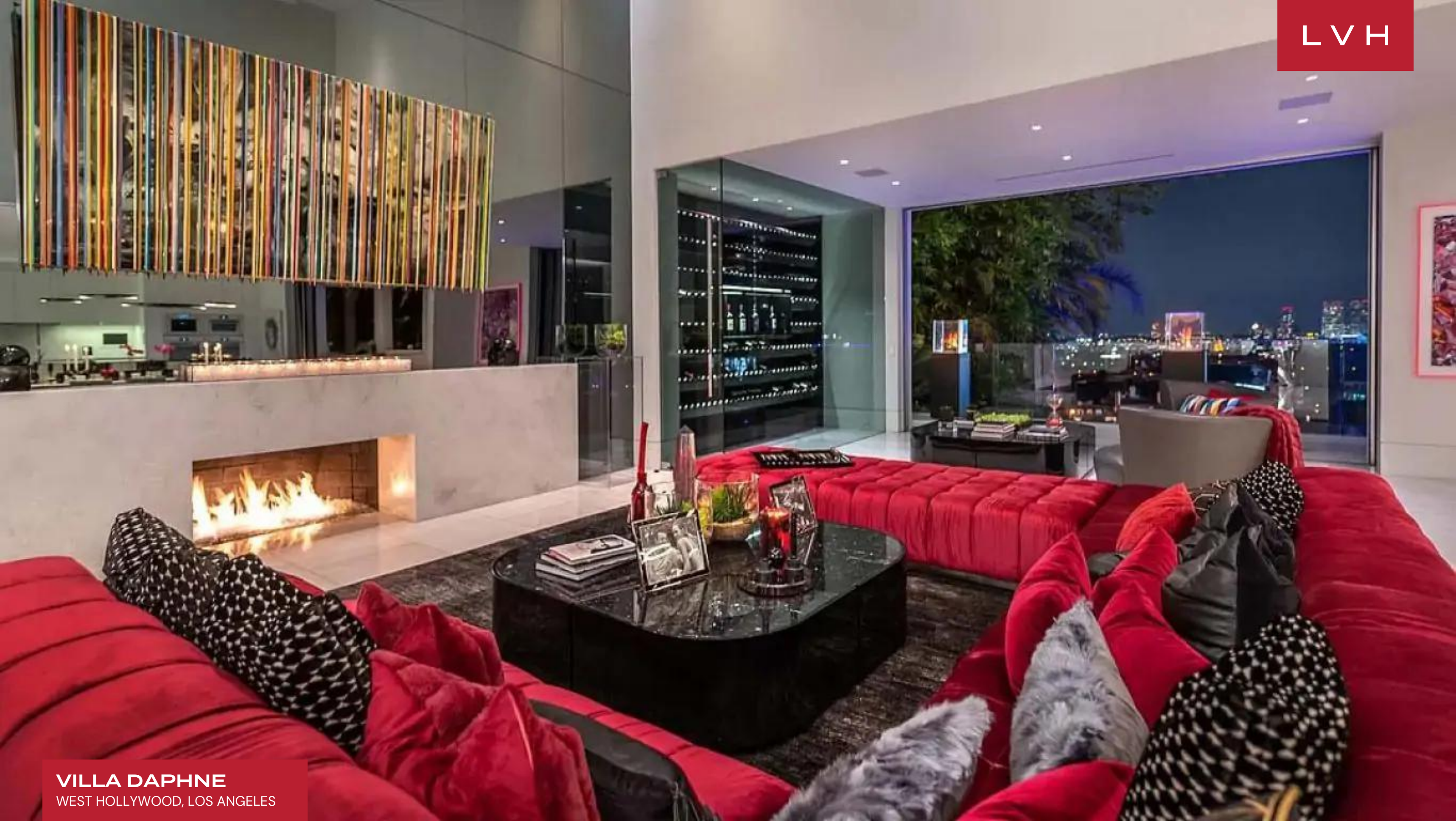
VILLA DAPHNE WEST HOLLYWOOD, LOS ANGELES