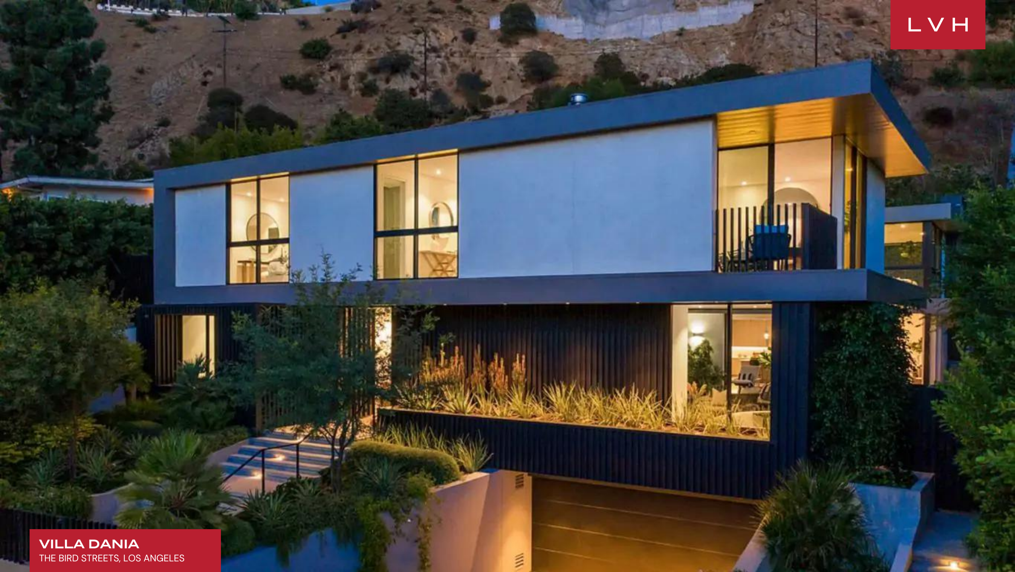
VILLA DANIA THE BIRD STREETS, LOS ANGELES