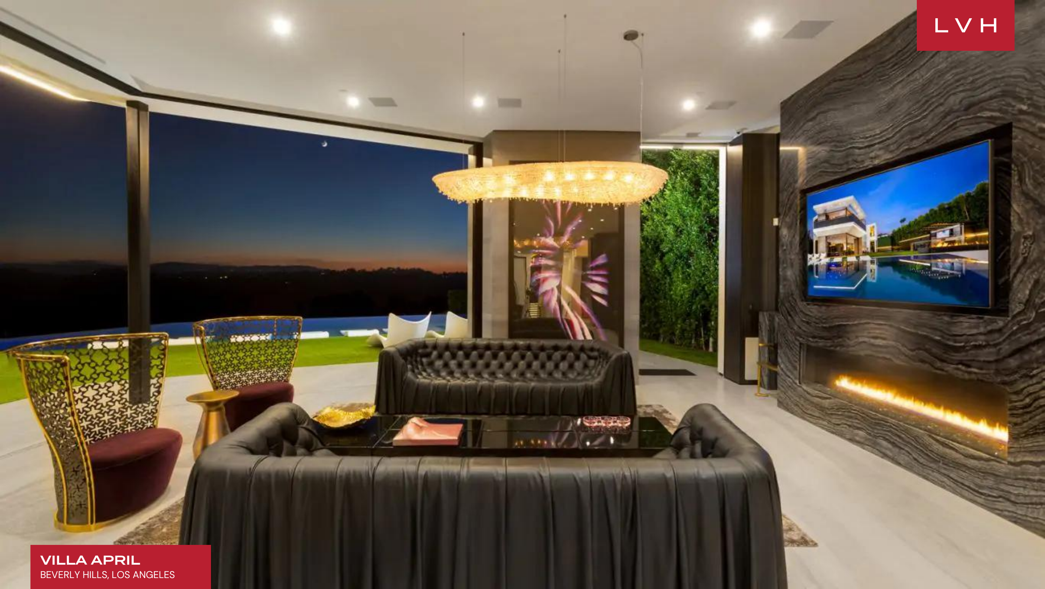
VILLA APRIL BEVERLY HILLS, LOS ANGELES