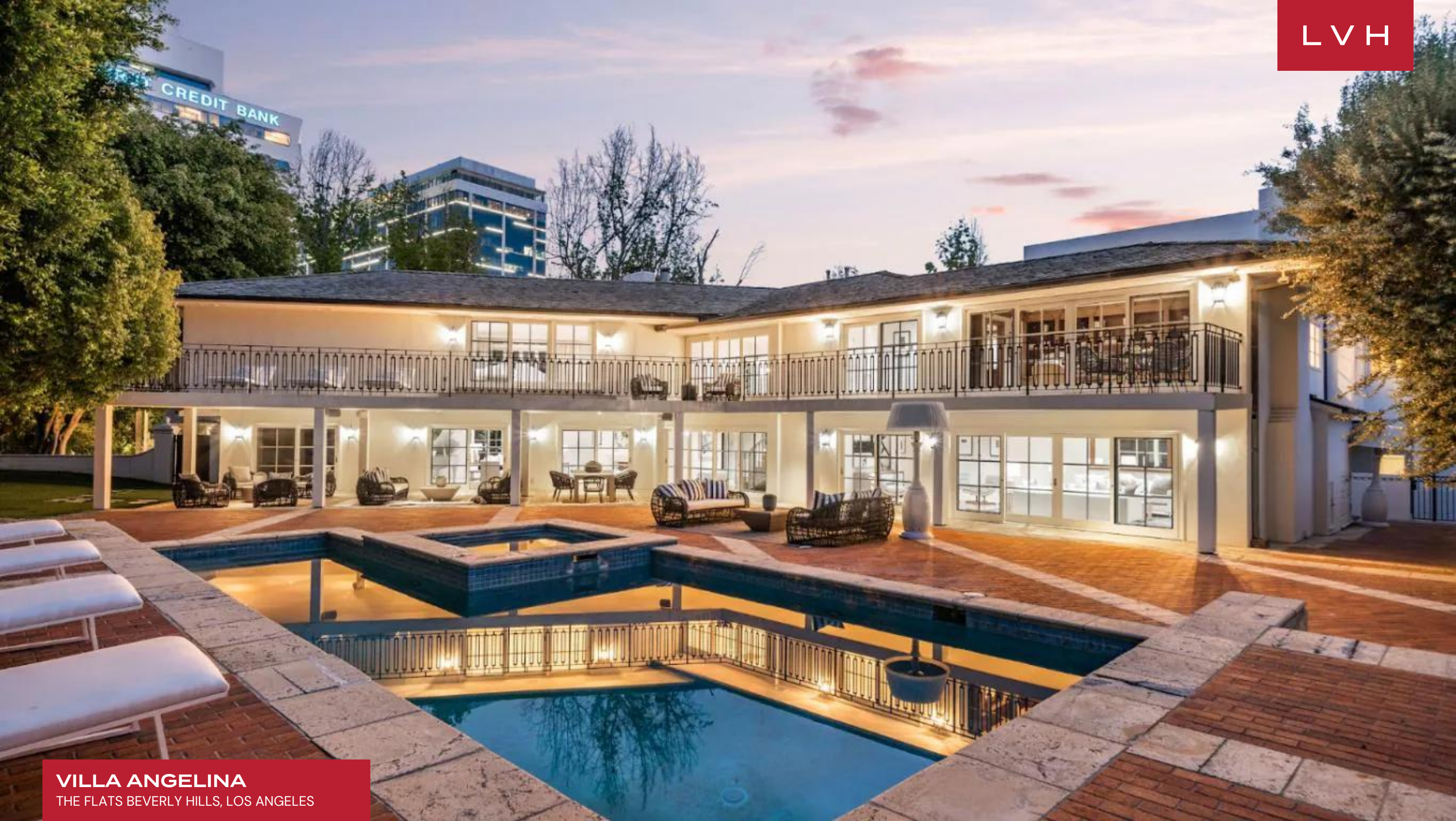
VILLA ANGELINA THE FLATS BEVERLY HILLS, LOS ANGELES