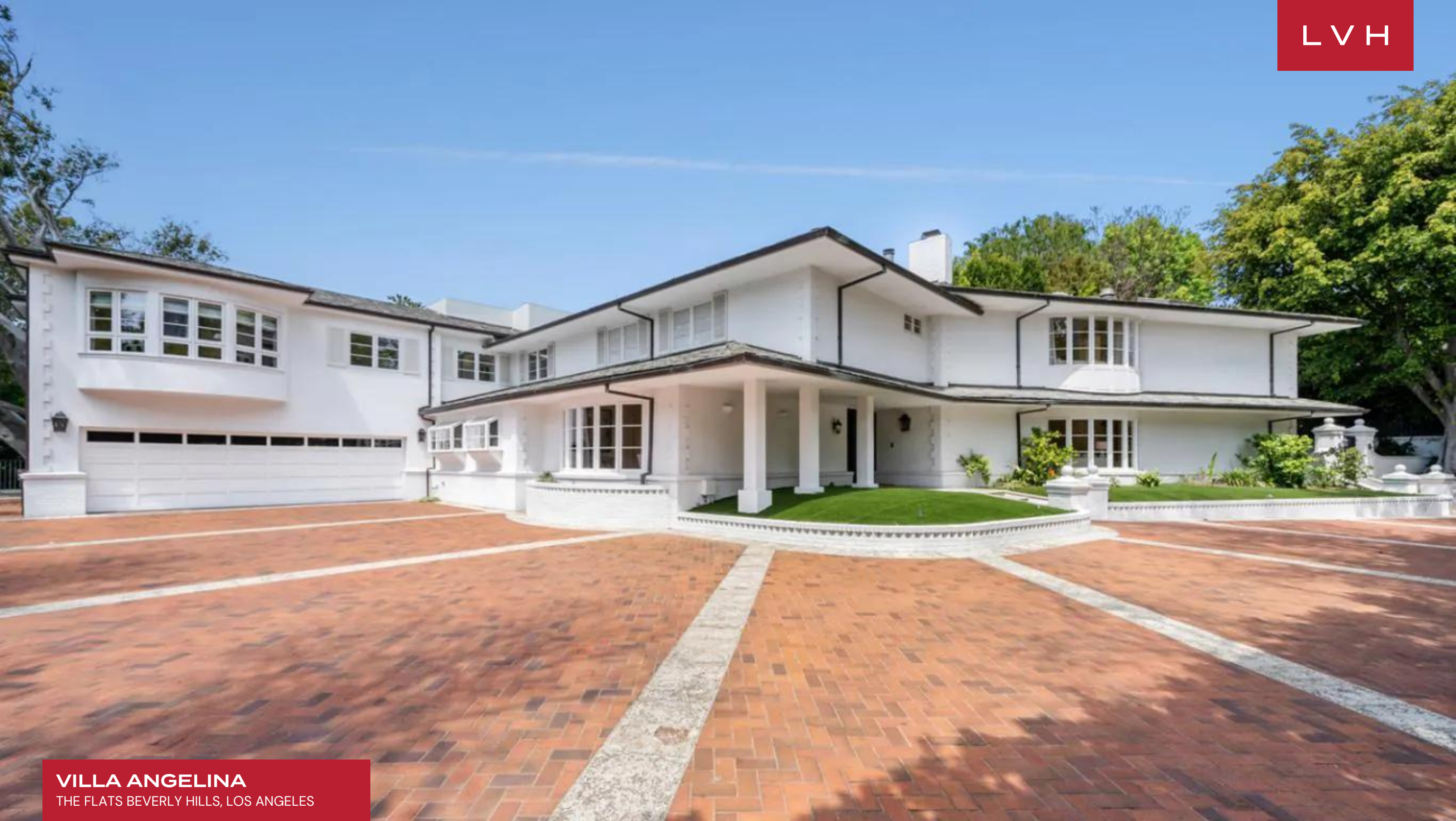
VILLA ANGELINA THE FLATS BEVERLY HILLS, LOS ANGELES