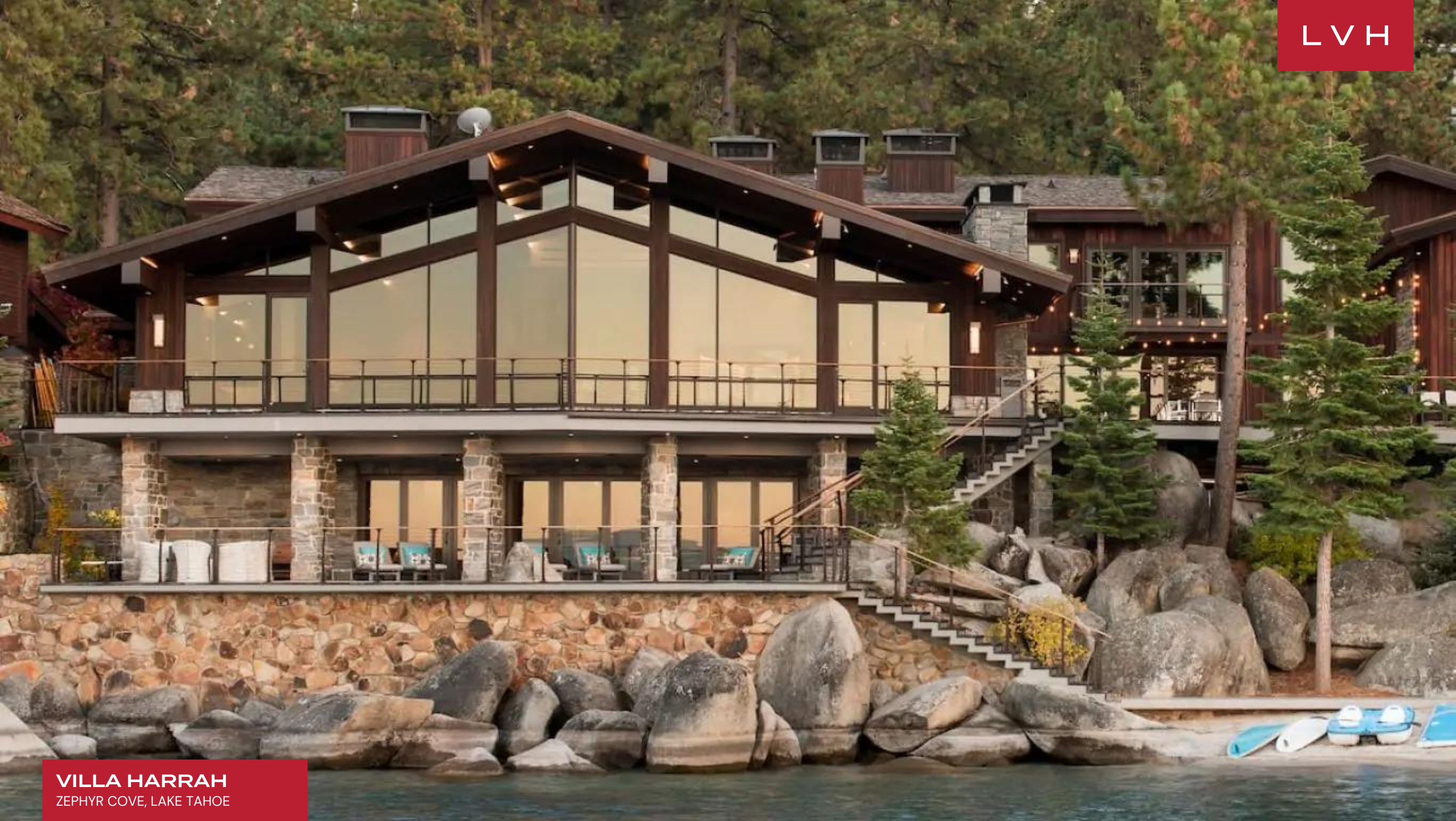
VILLA HARRAH ZEPHYR COVE, LAKE TAHOE