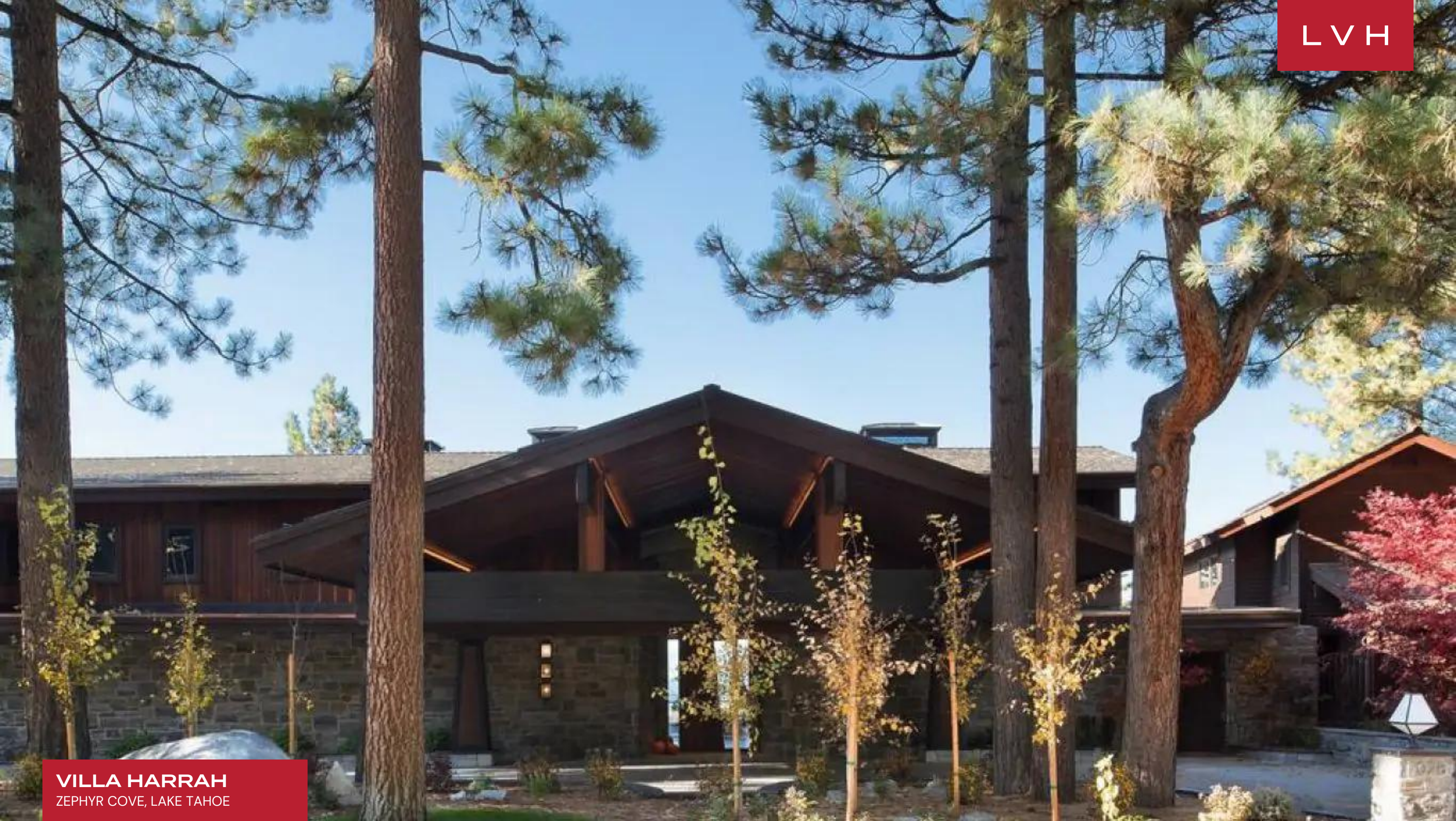
VILLA HARRAH ZEPHYR COVE, LAKE TAHOE