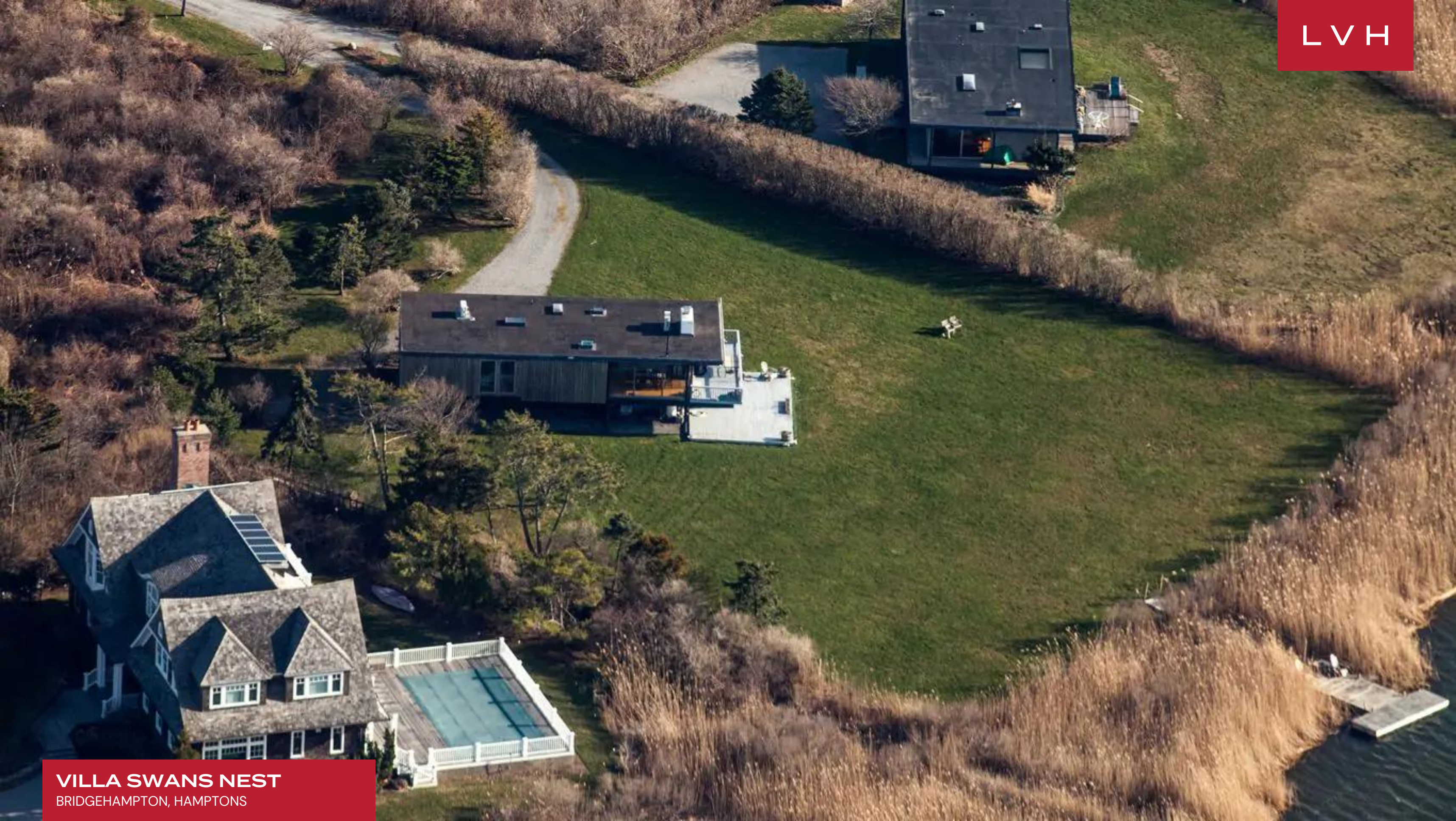
VILLA SWANS NEST BRIDGEHAMPTON, HAMPTONS