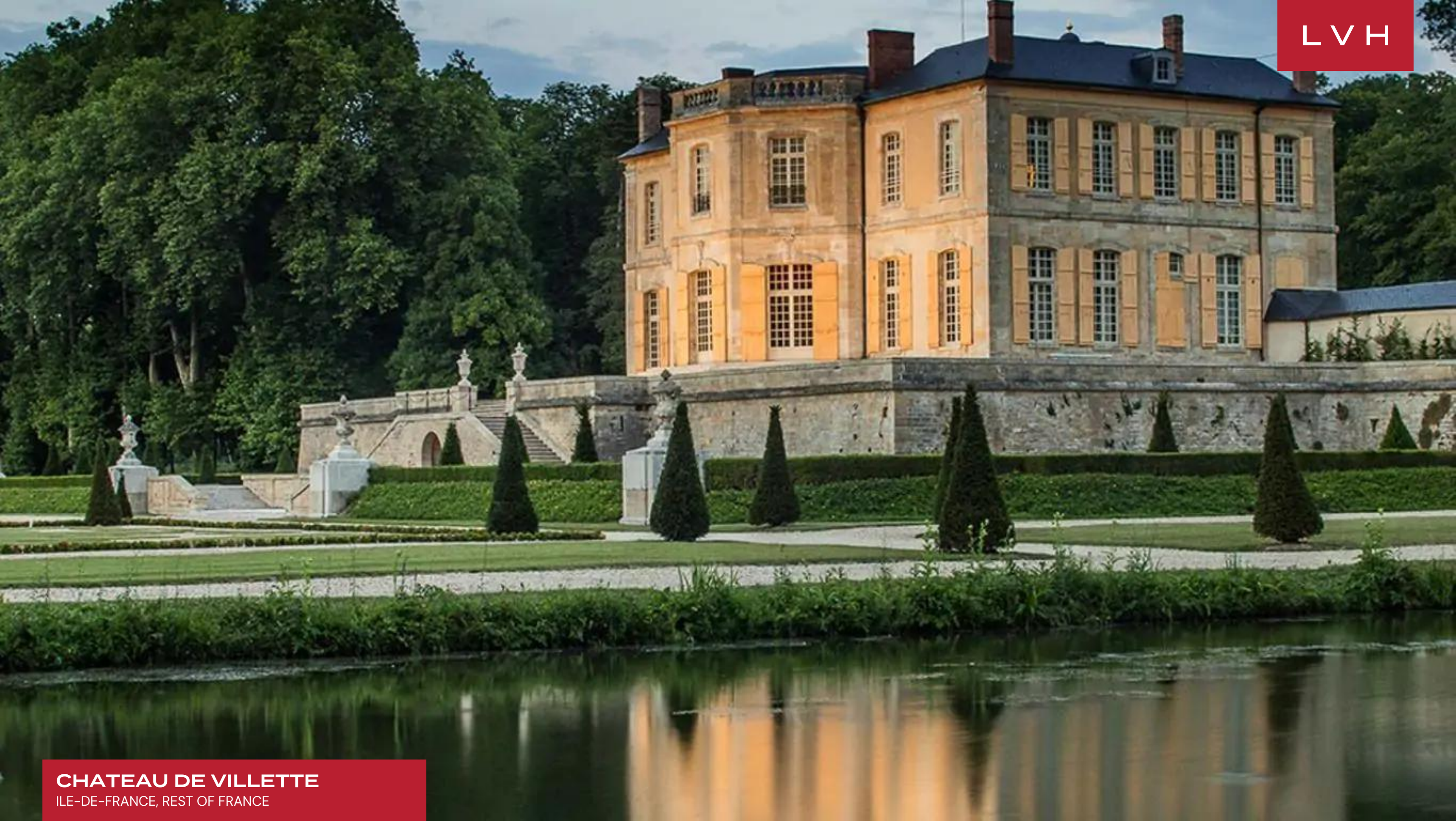
CHATEAU DE VILLETTE ILE-DE-FRANCE, REST OF FRANCE