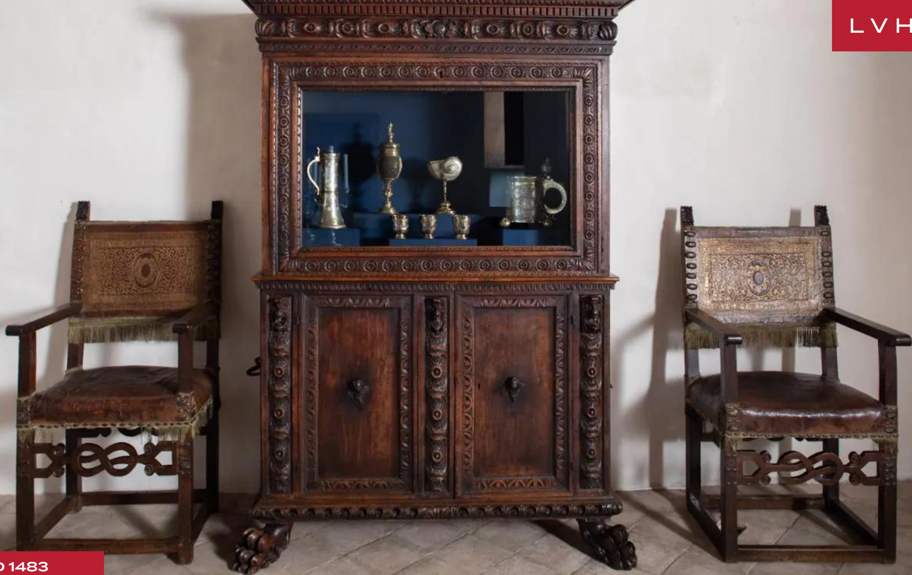
LOPUD 1483 LOPUD, CROATIA