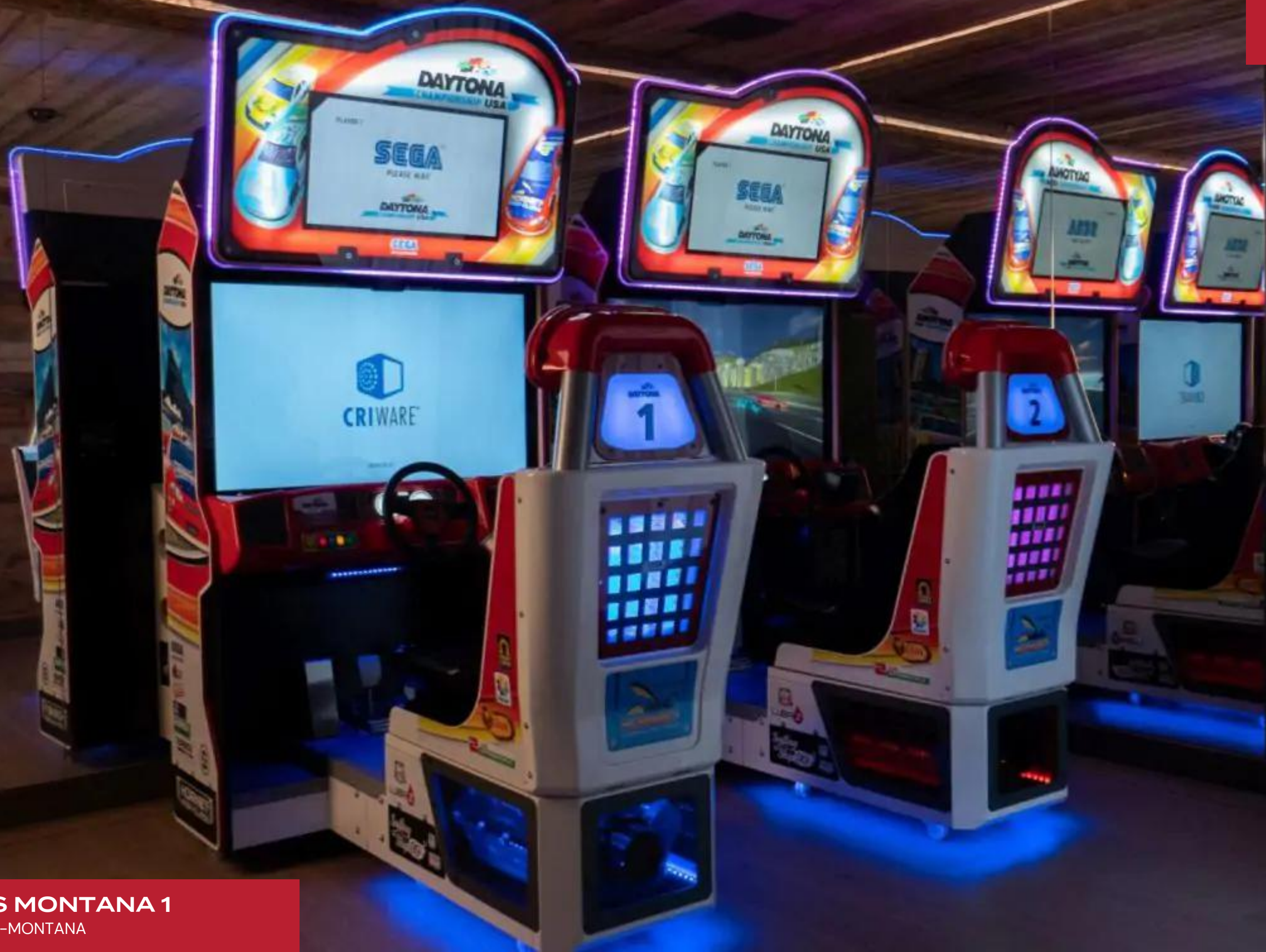
ULTIMA CRANS MONTANA 1 CRANS-MONTANA, CRANS-MONTANA