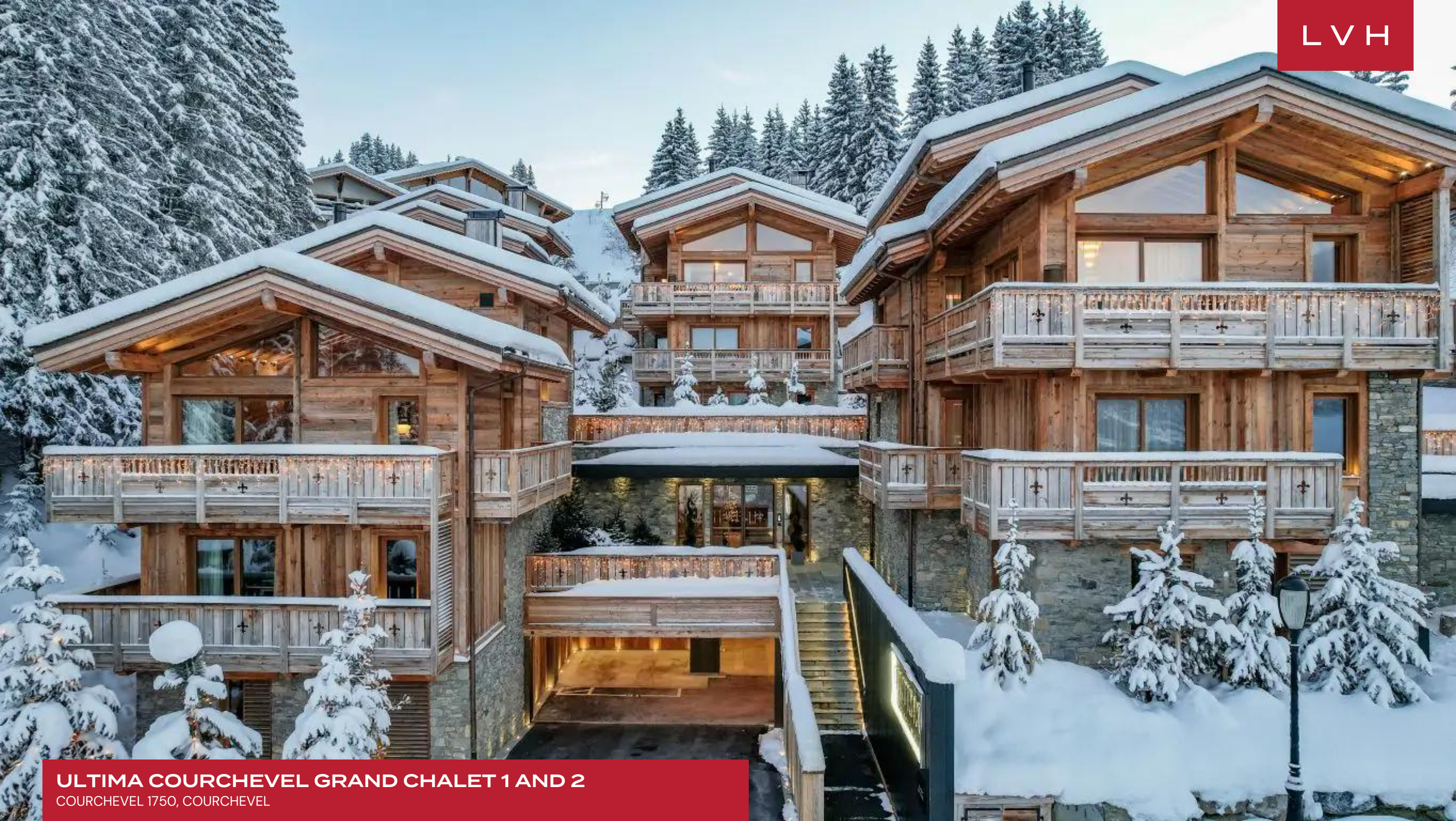
ULTIMA COURCHEVEL GRAND CHALET 1 AND 2 COURCHEVEL 1750, COURCHEVEL