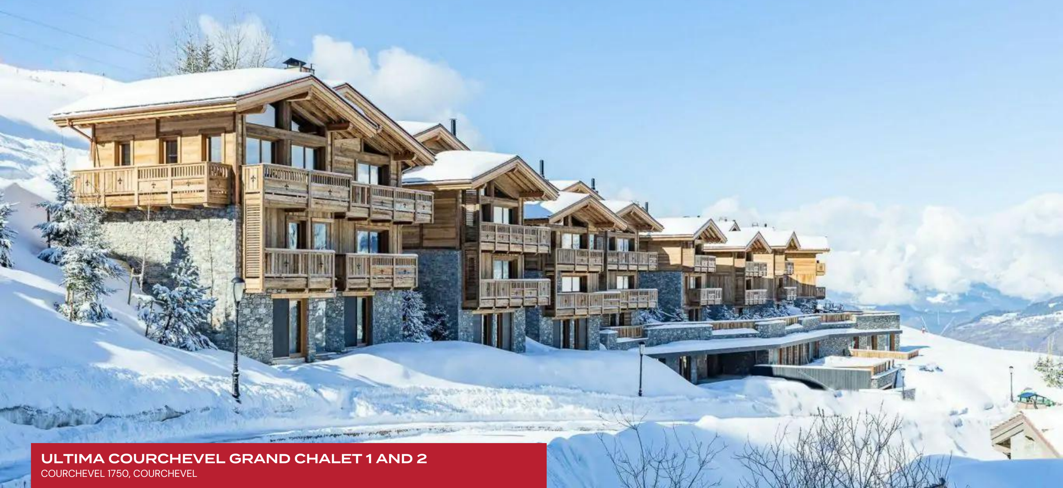
ULTIMA COURCHEVEL GRAND CHALET 1 AND 2 COURCHEVEL 1750, COURCHEVEL