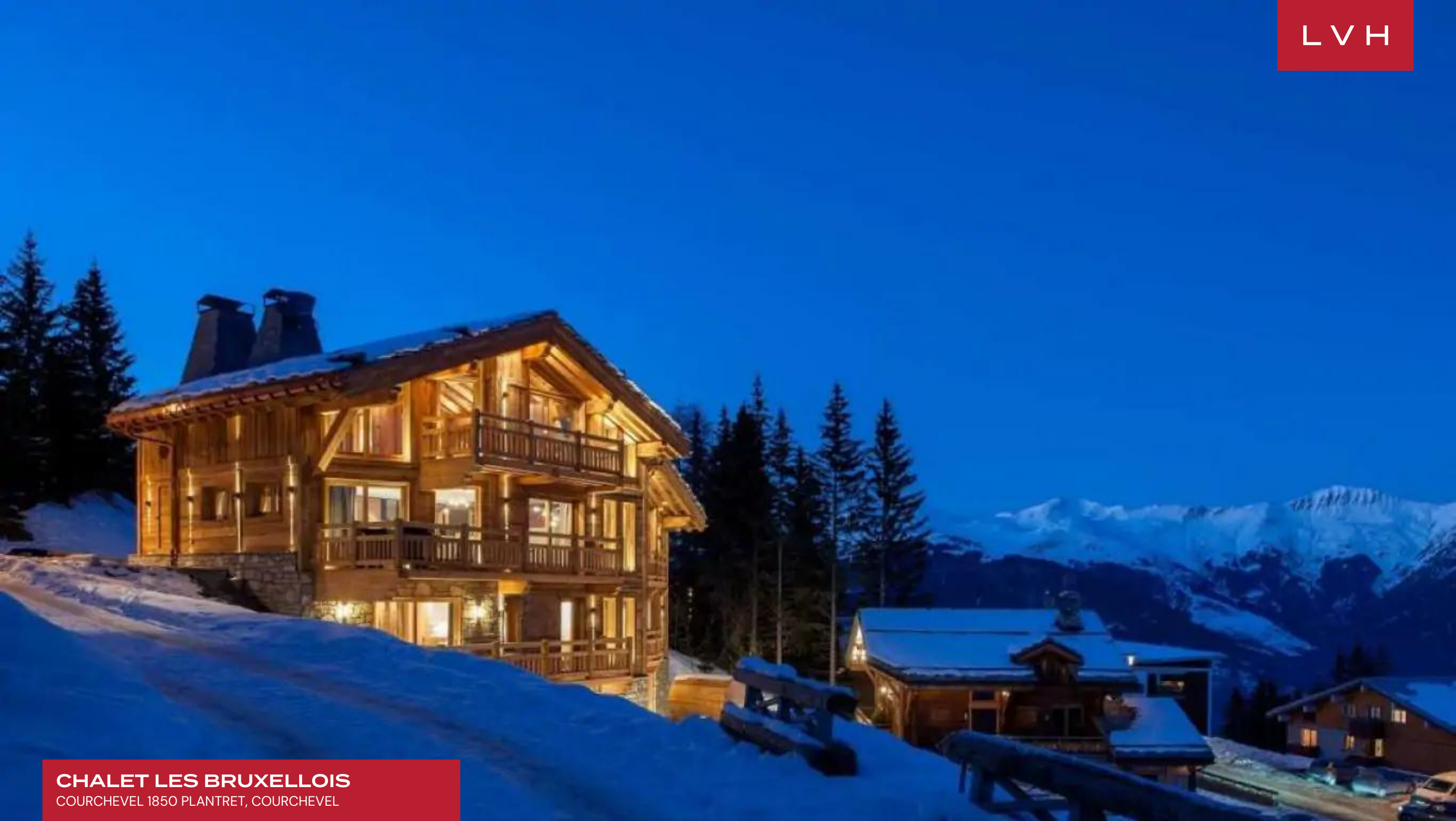
CHALET LES BRUXELLOIS COURCHEVEL 1850 PLANTRET, COURCHEVEL