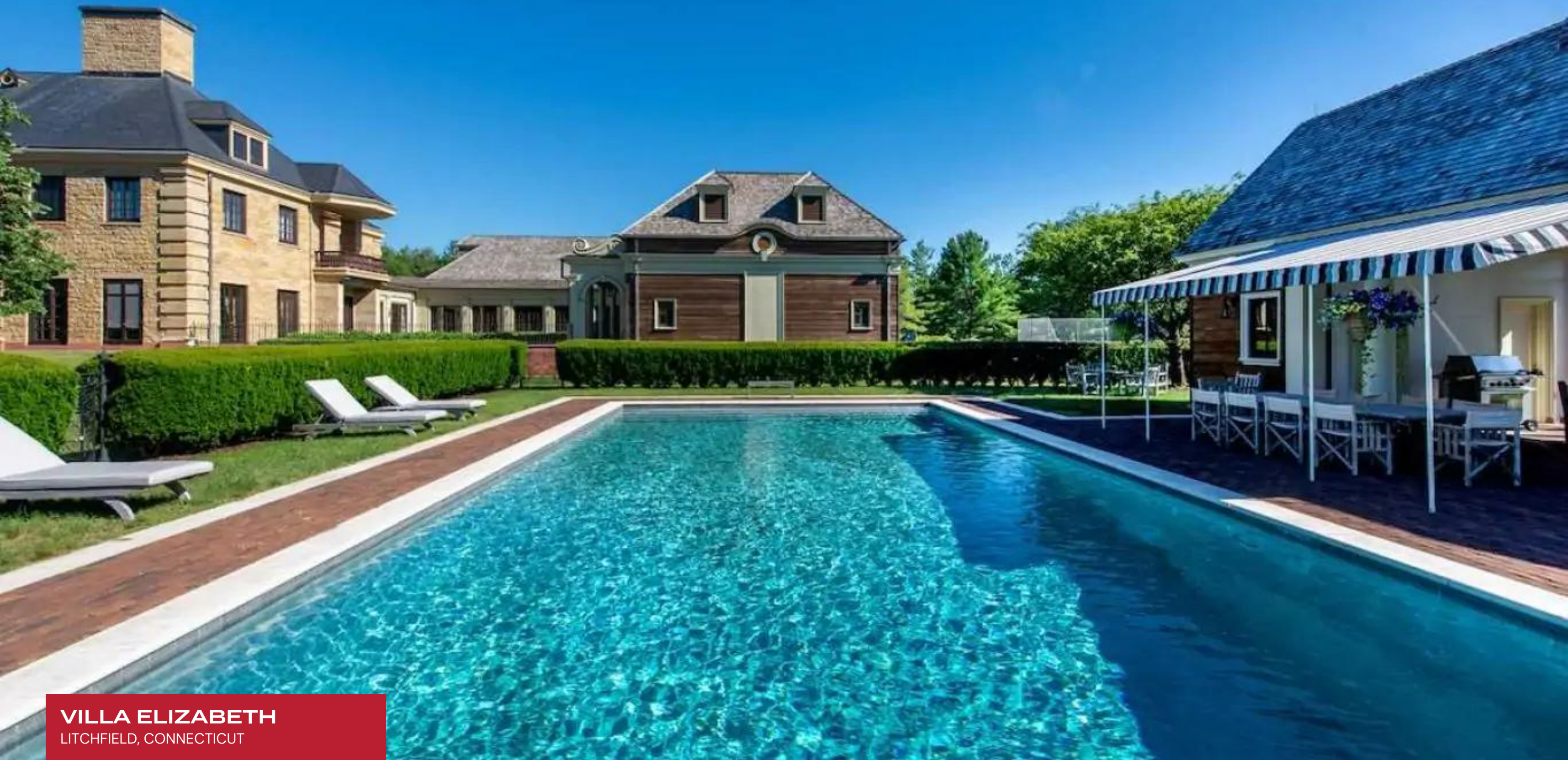
VILLA ELIZABETH LITCHFIELD, CONNECTICUT