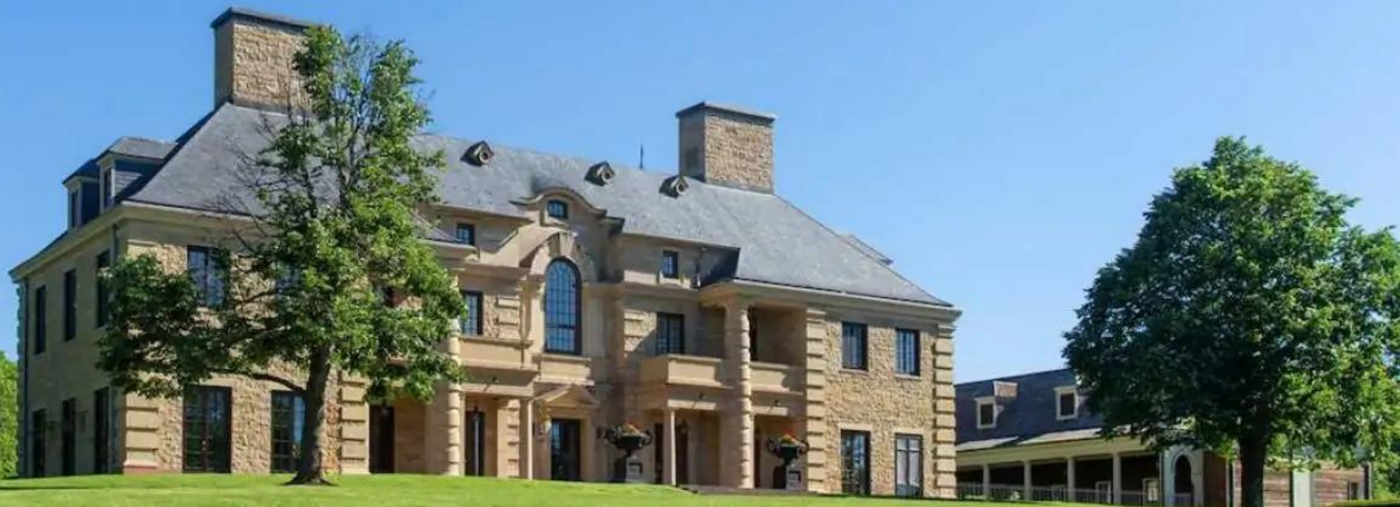
VILLA ELIZABETH LITCHFIELD, CONNECTICUT