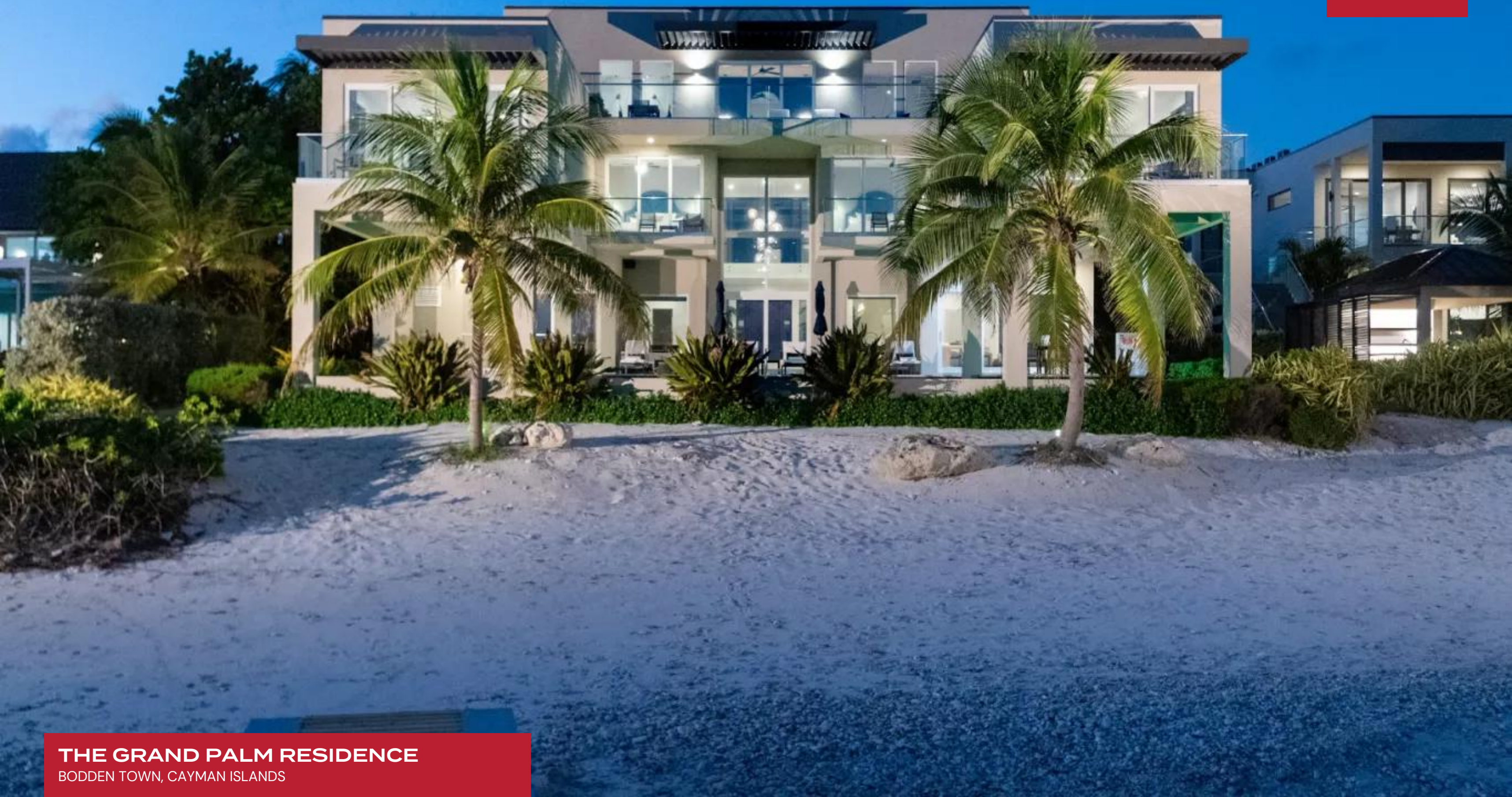
THE GRAND PALM RESIDENCE BODDEN TOWN, CAYMAN ISLANDS