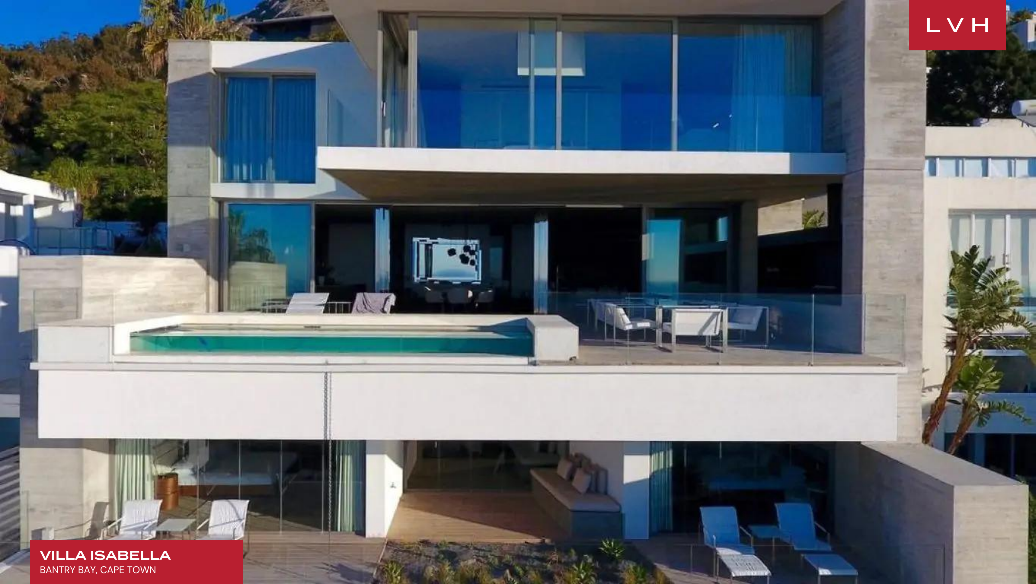
VILLA ISABELLA BANTRY BAY, CAPE TOWN