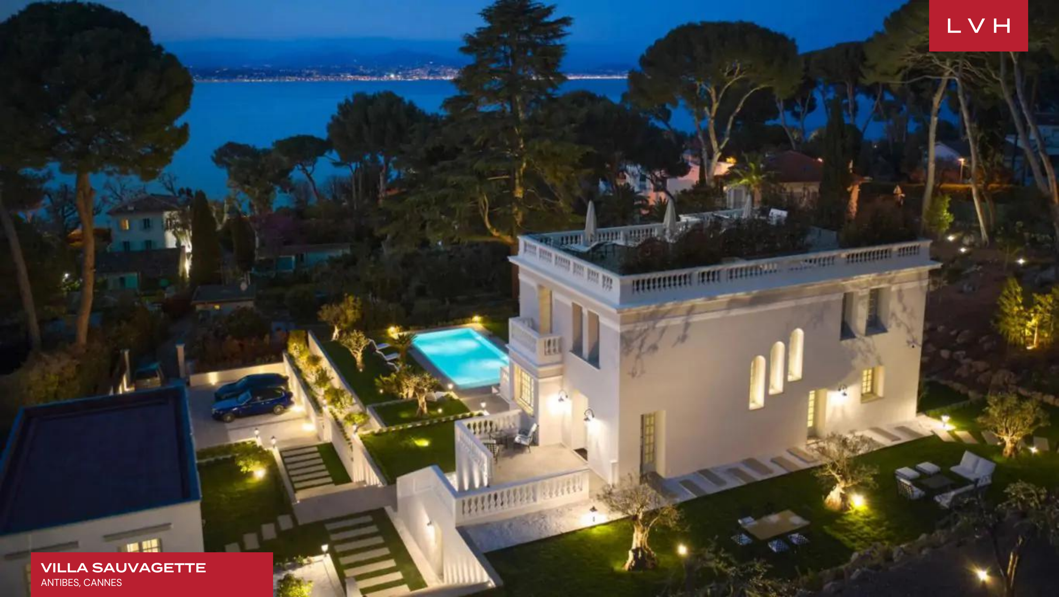
VILLA SAUVAGETTE ANTIBES, CANNES