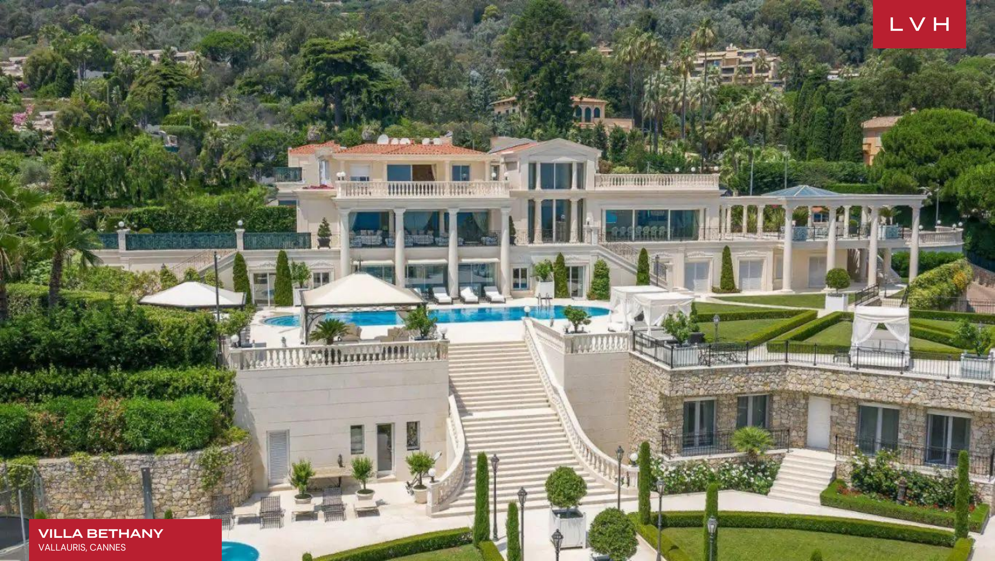
VILLA BETHANY VALLAURIS, CANNES