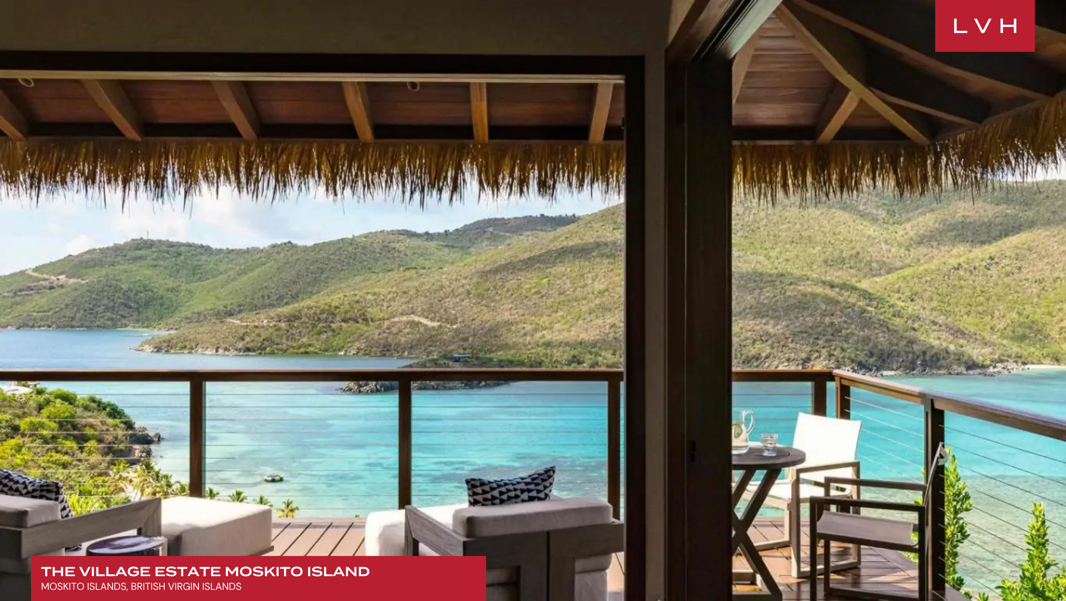
THE VILLAGE ESTATE MOSKITO ISLAND MOSKITO ISLANDS, BRITISH VIRGIN ISLANDS