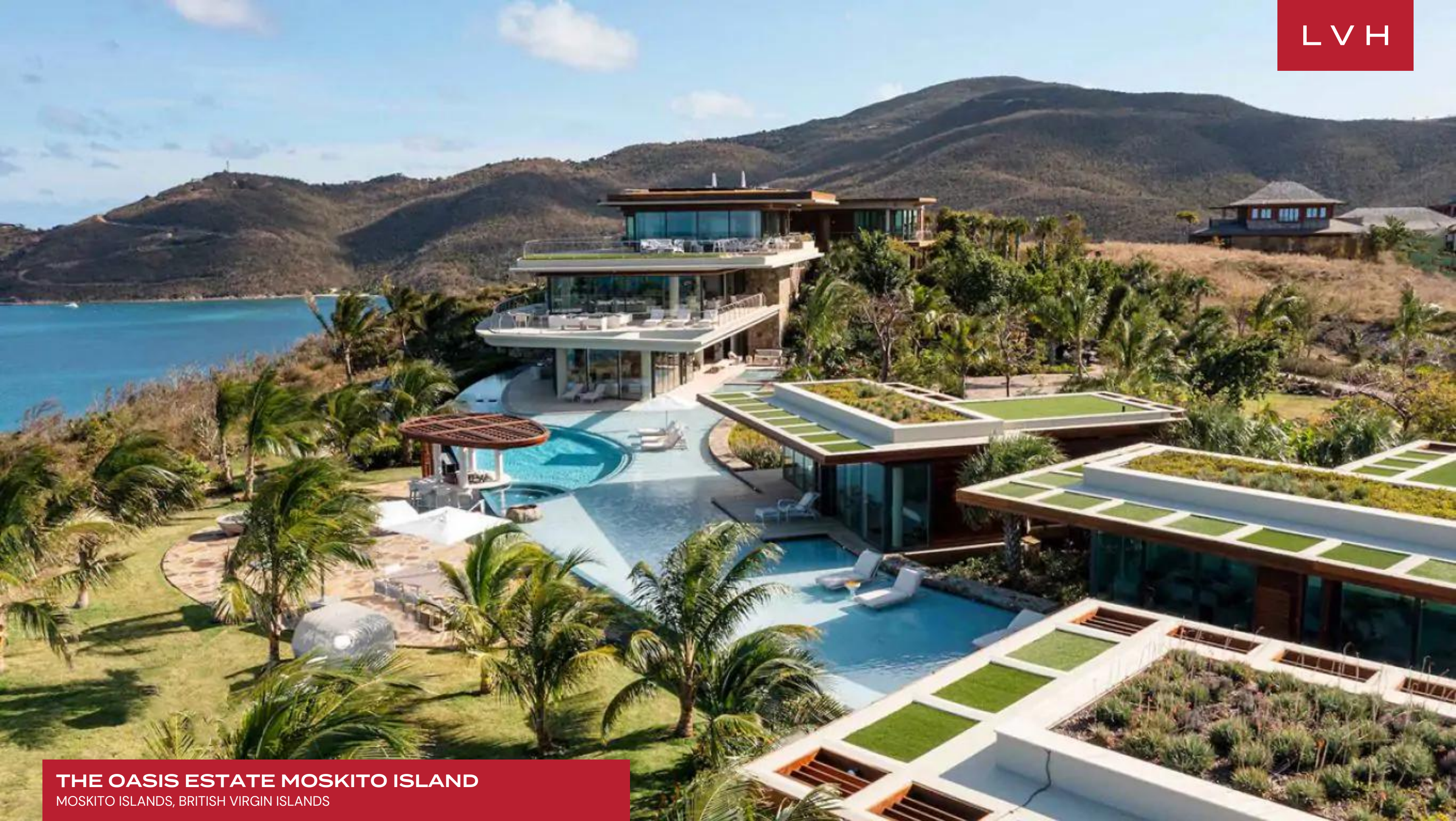
THE OASIS ESTATE MOSKITO ISLAND MOSKITO ISLANDS, BRITISH VIRGIN ISLANDS