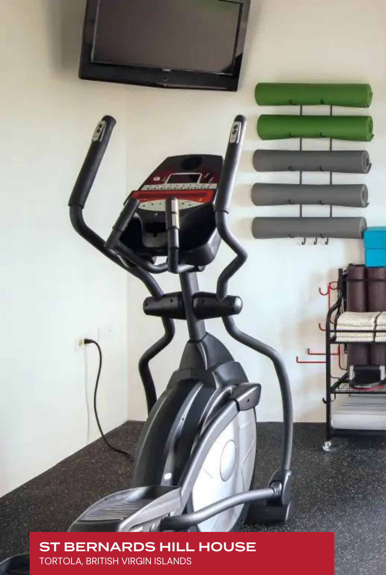
ST BERNARDS HILL HOUSE TORTOLA, BRITISH VIRGIN ISLANDS