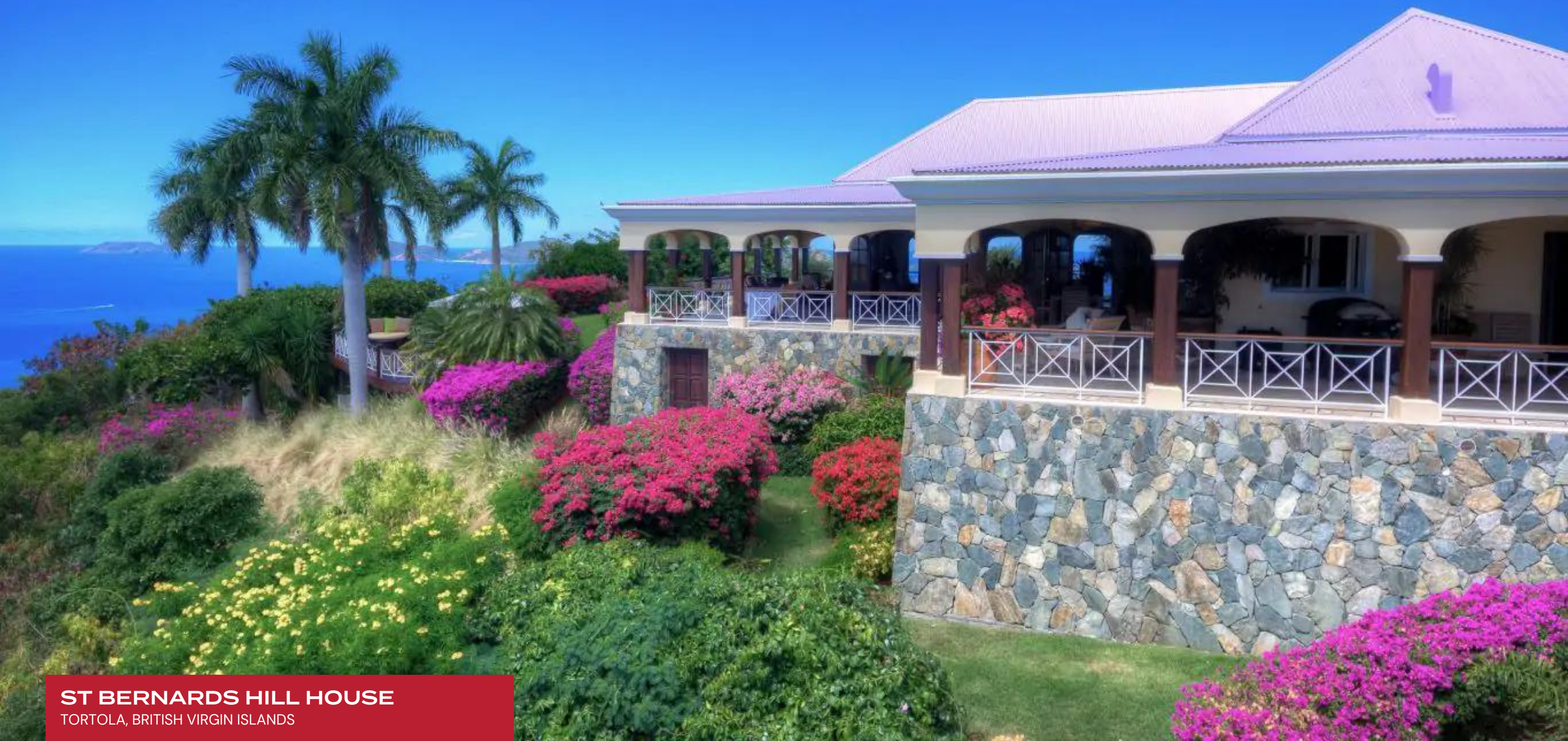
ST BERNARDS HILL HOUSE TORTOLA, BRITISH VIRGIN ISLANDS