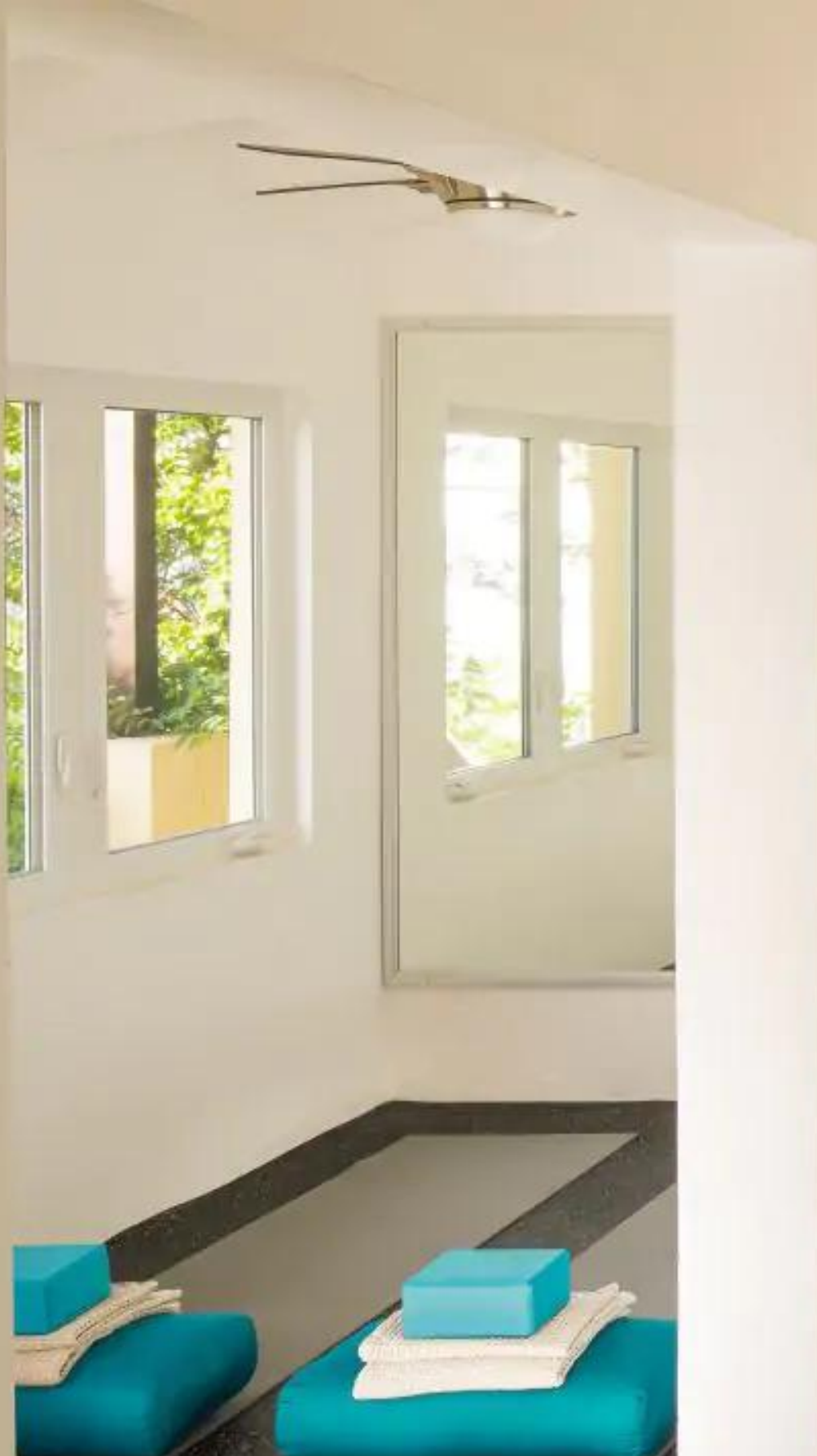
ST BERNARDS HILL HOUSE TORTOLA, BRITISH VIRGIN ISLANDS