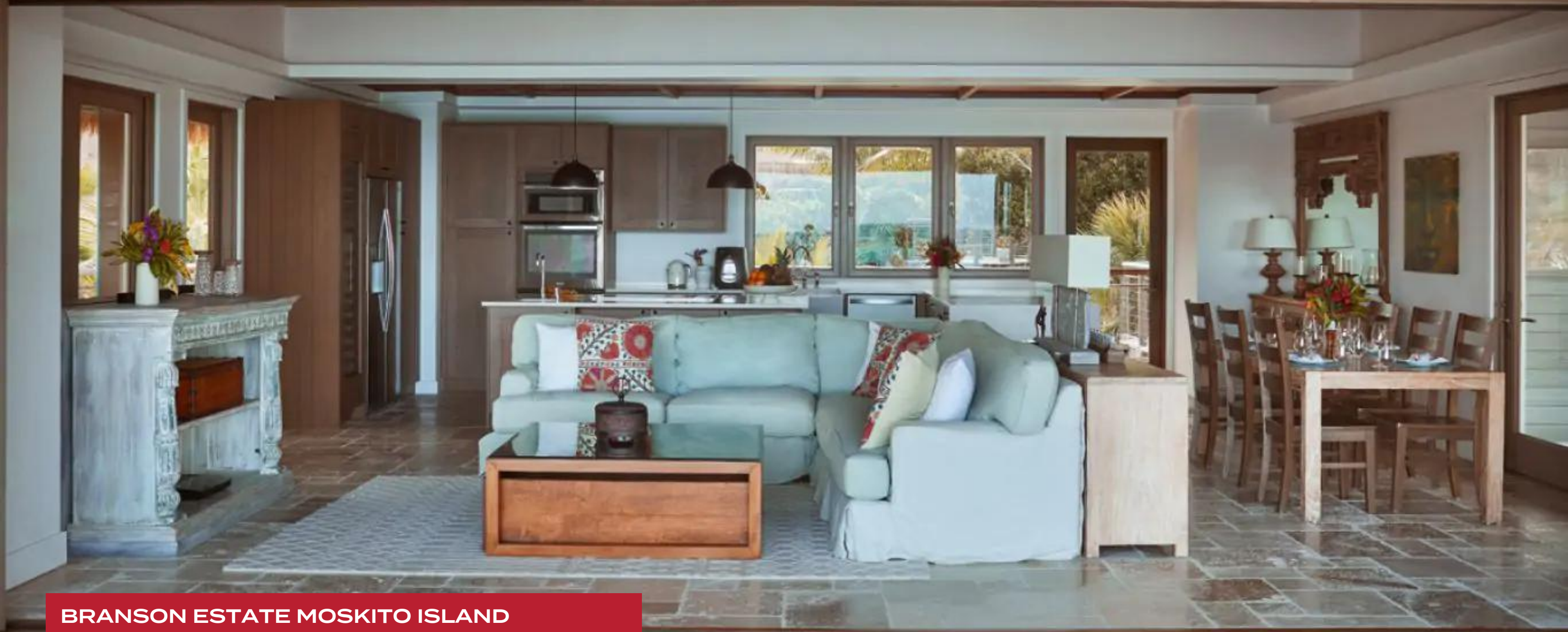
BRANSON ESTATE MOSKITO ISLAND MOSKITO ISLANDS, BRITISH VIRGIN ISLANDS