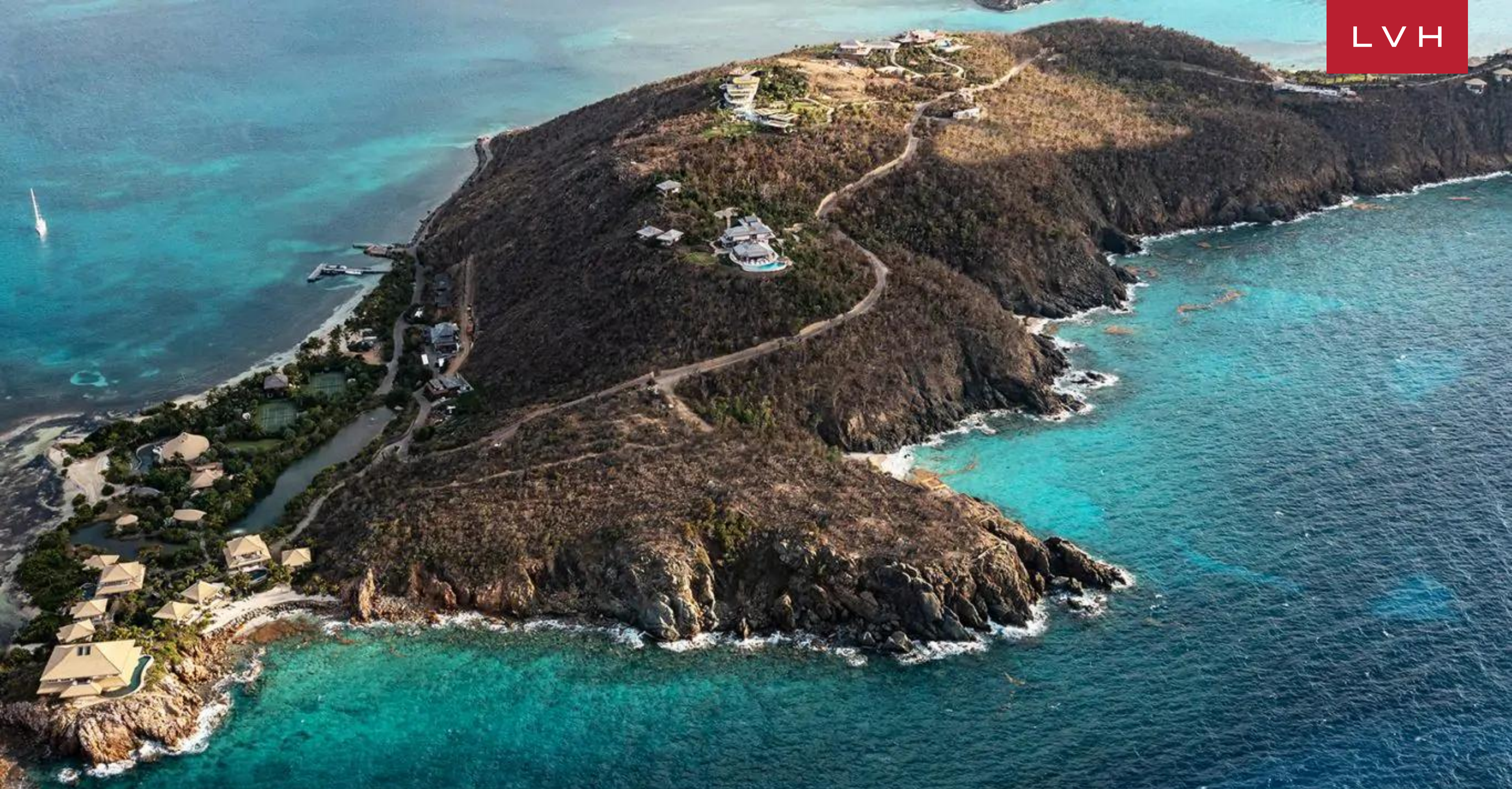
BRANSON ESTATE MOSKITO ISLAND MOSKITO ISLANDS, BRITISH VIRGIN ISLANDS