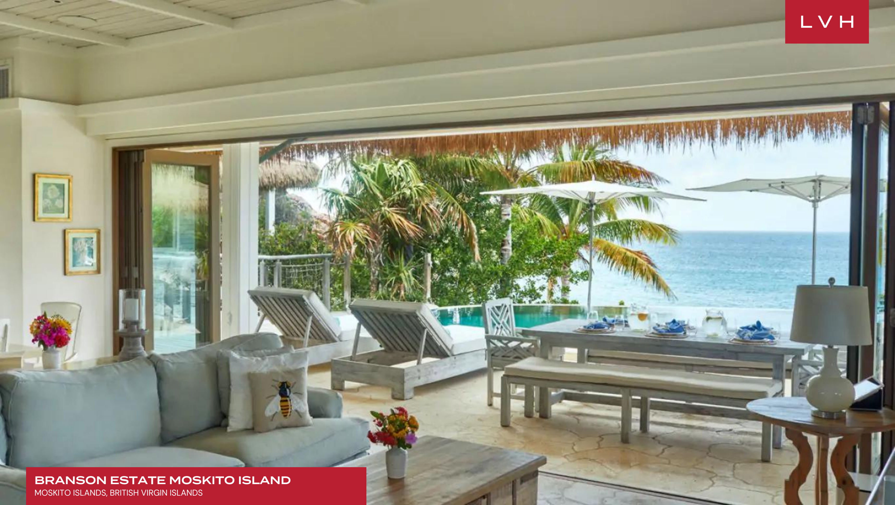
BRANSON ESTATE MOSKITO ISLAND MOSKITO ISLANDS, BRITISH VIRGIN ISLANDS