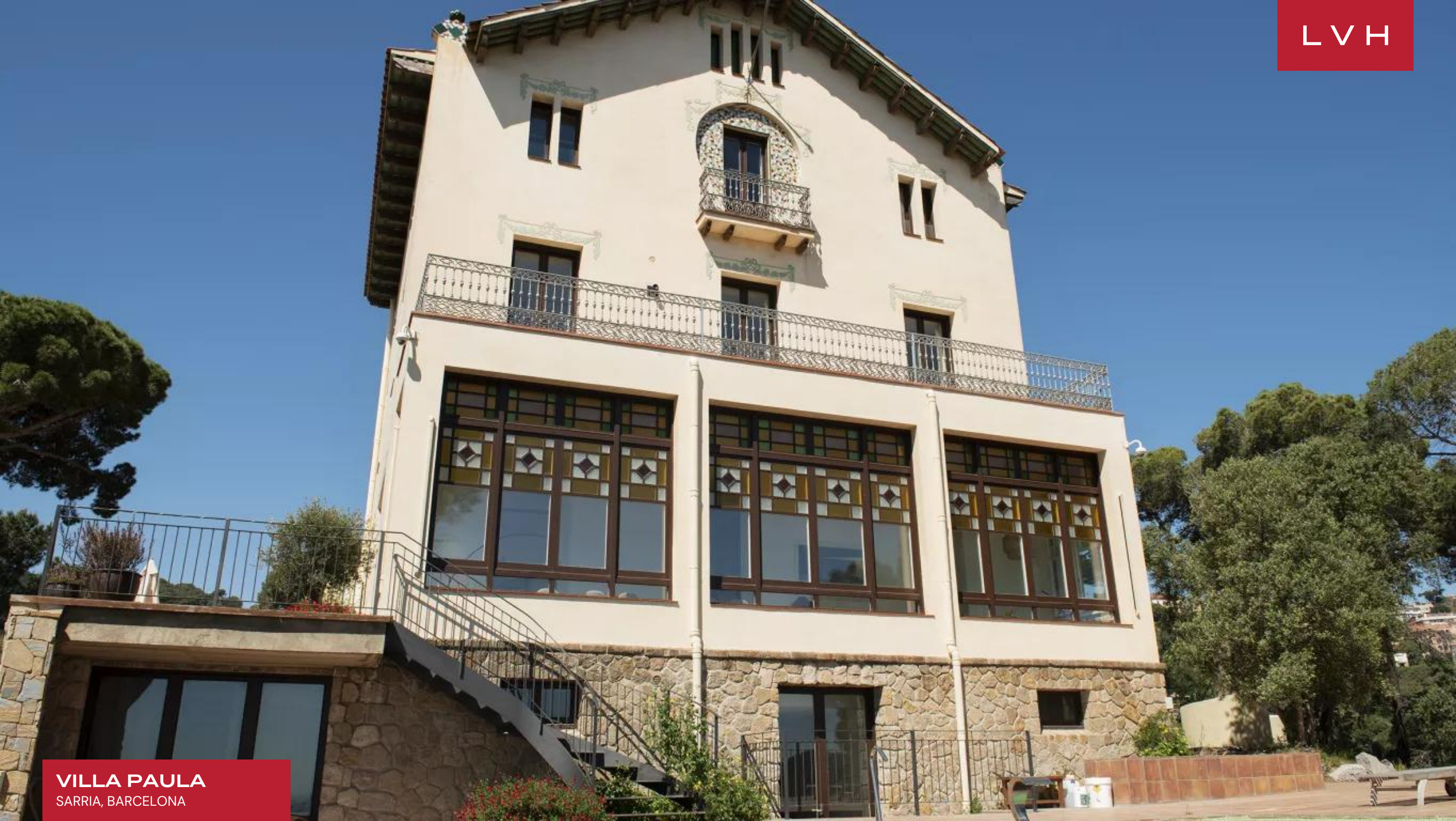
VILLA PAULA SARRIA, BARCELONA