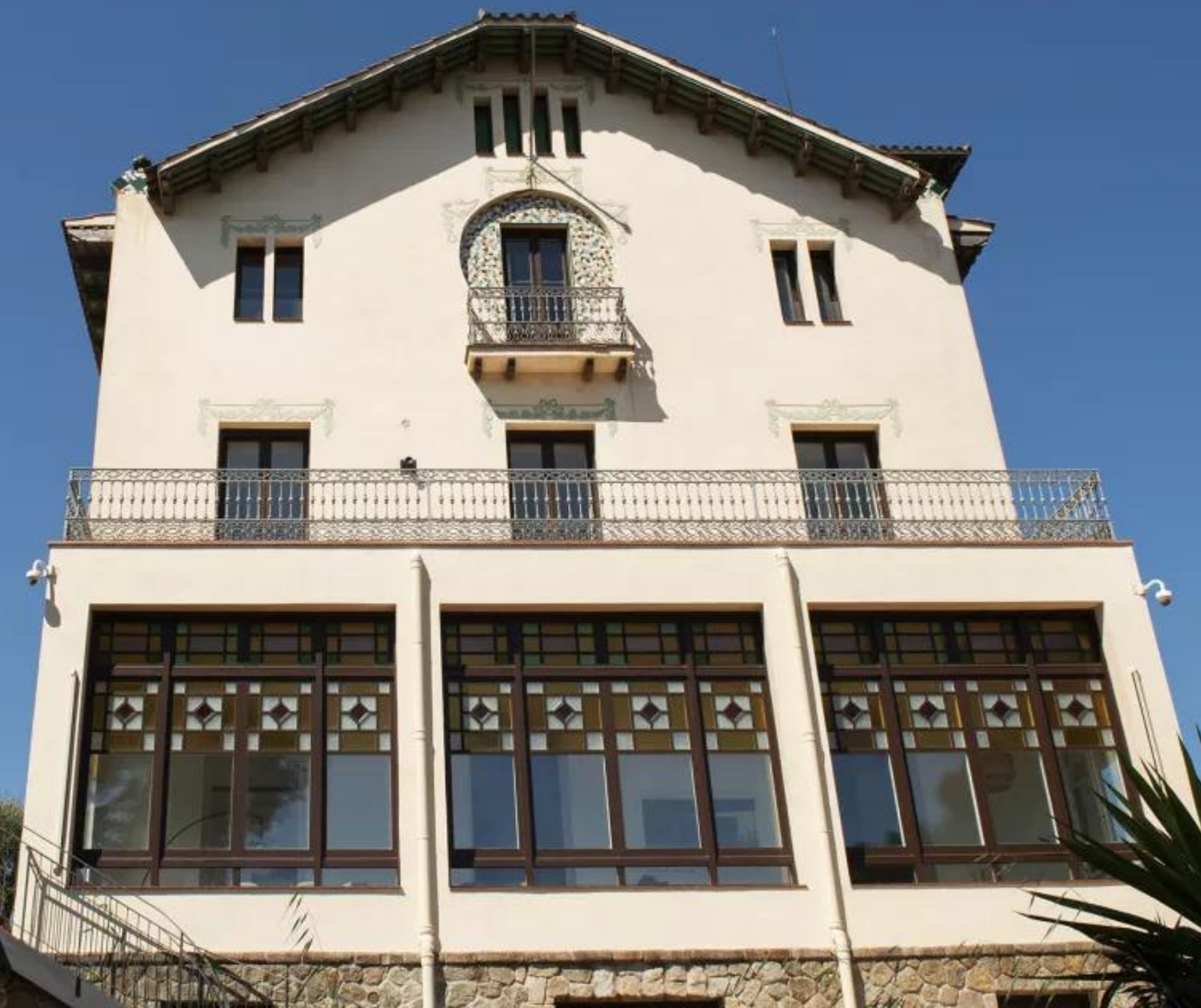
VILLA PAULA SARRIA, BARCELONA