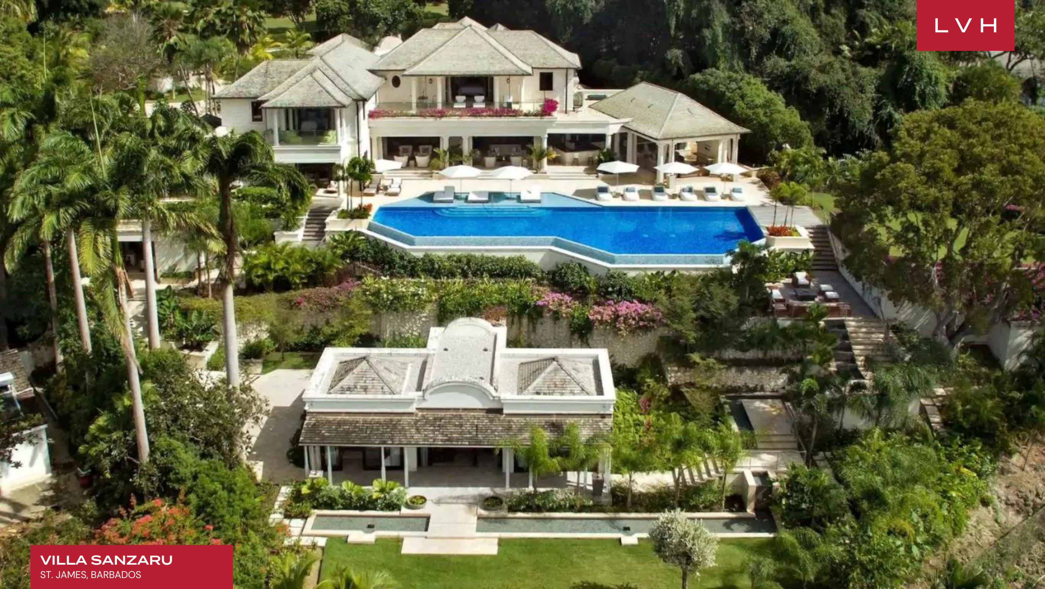
VILLA SANZARU ST. JAMES, BARBADOS