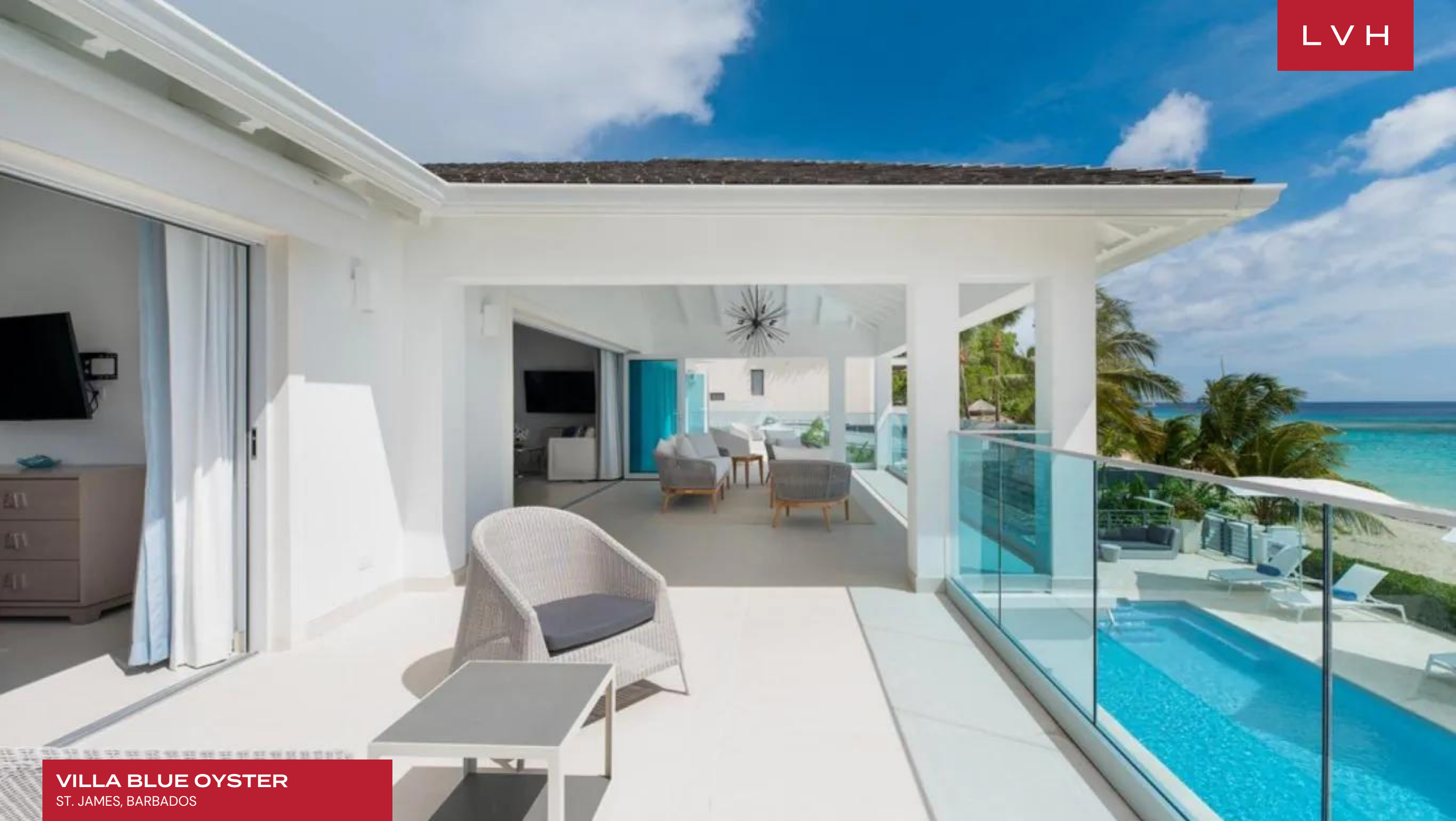
VILLA BLUE OYSTER ST. JAMES, BARBADOS