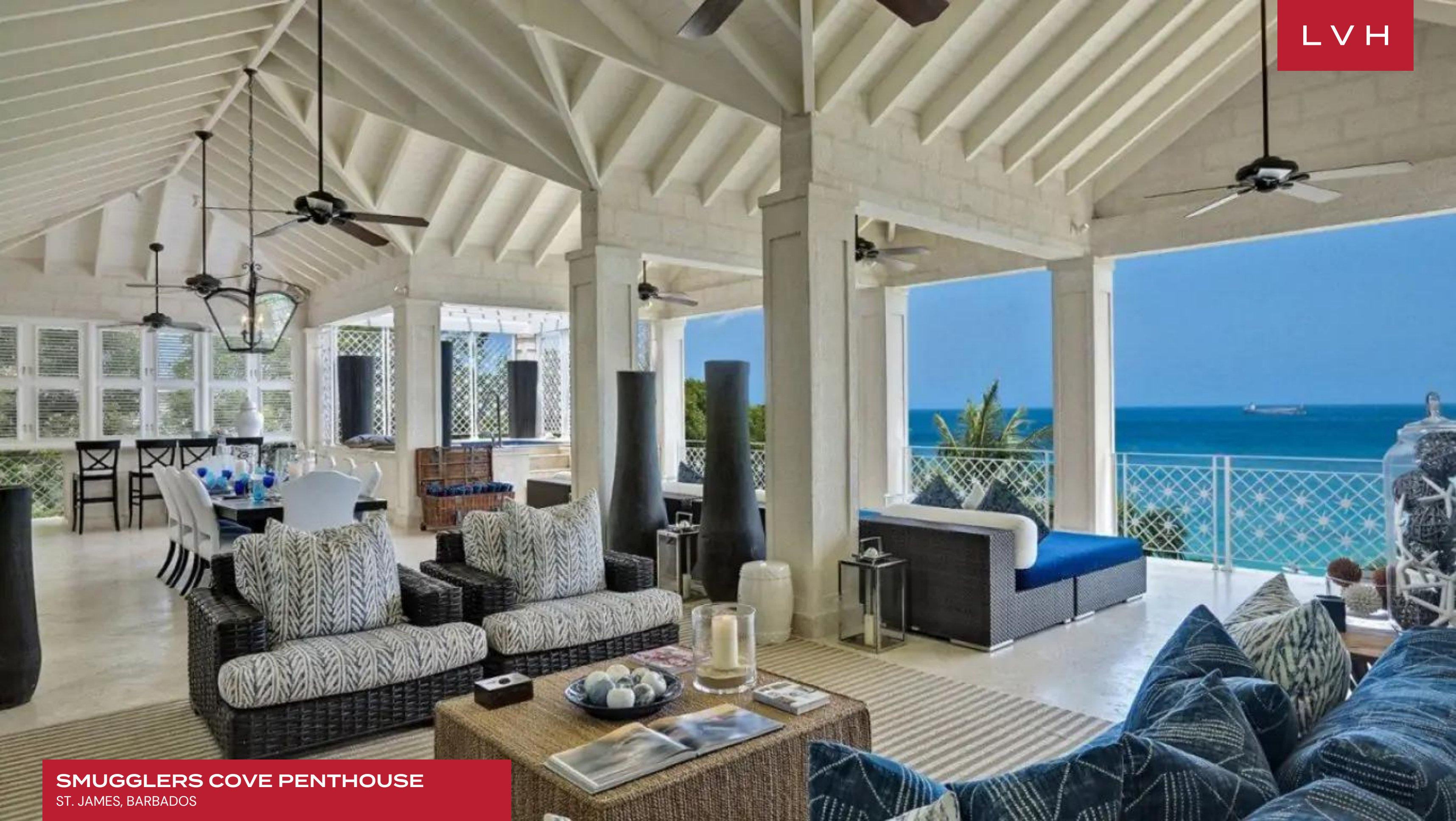
SMUGGLERS COVE PENTHOUSE ST. JAMES, BARBADOS