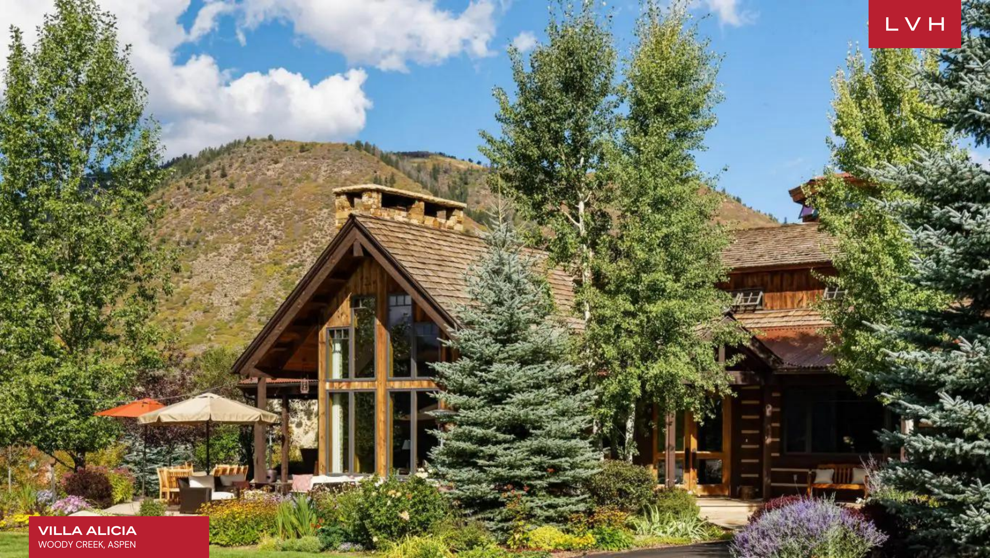
VILLA ALICIA WOODY CREEK, ASPEN