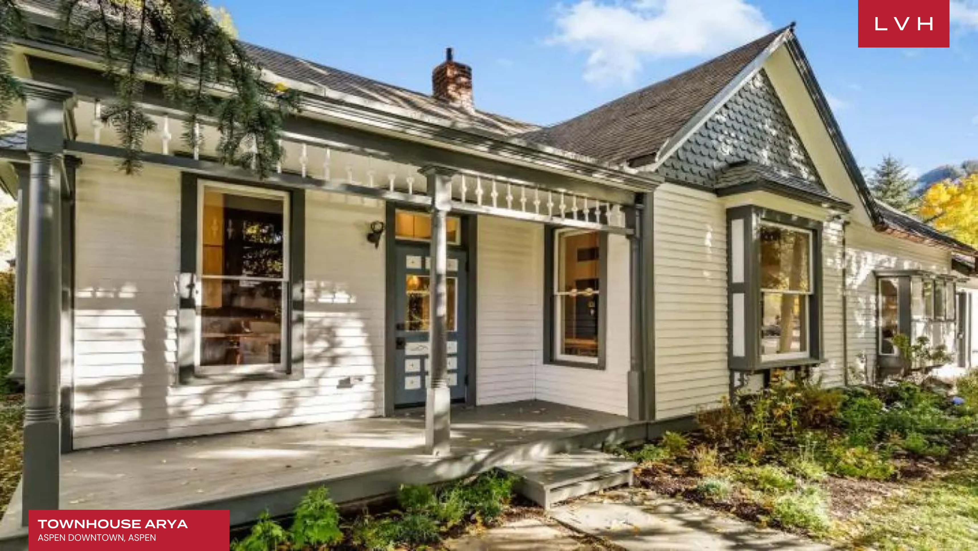
TOWNHOUSE ARYA ASPEN DOWNTOWN, ASPEN