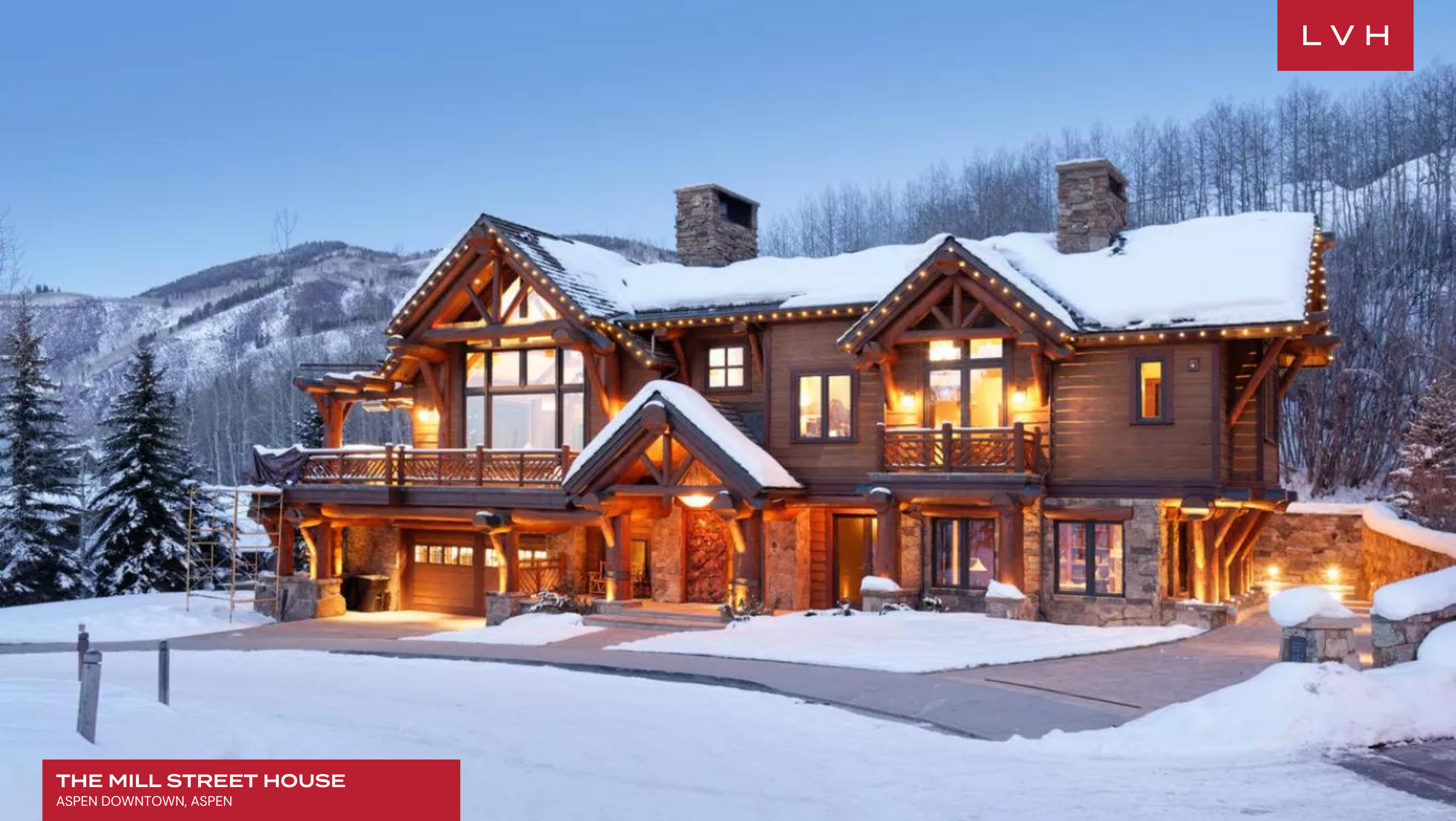
THE MILL STREET HOUSE ASPEN DOWNTOWN, ASPEN