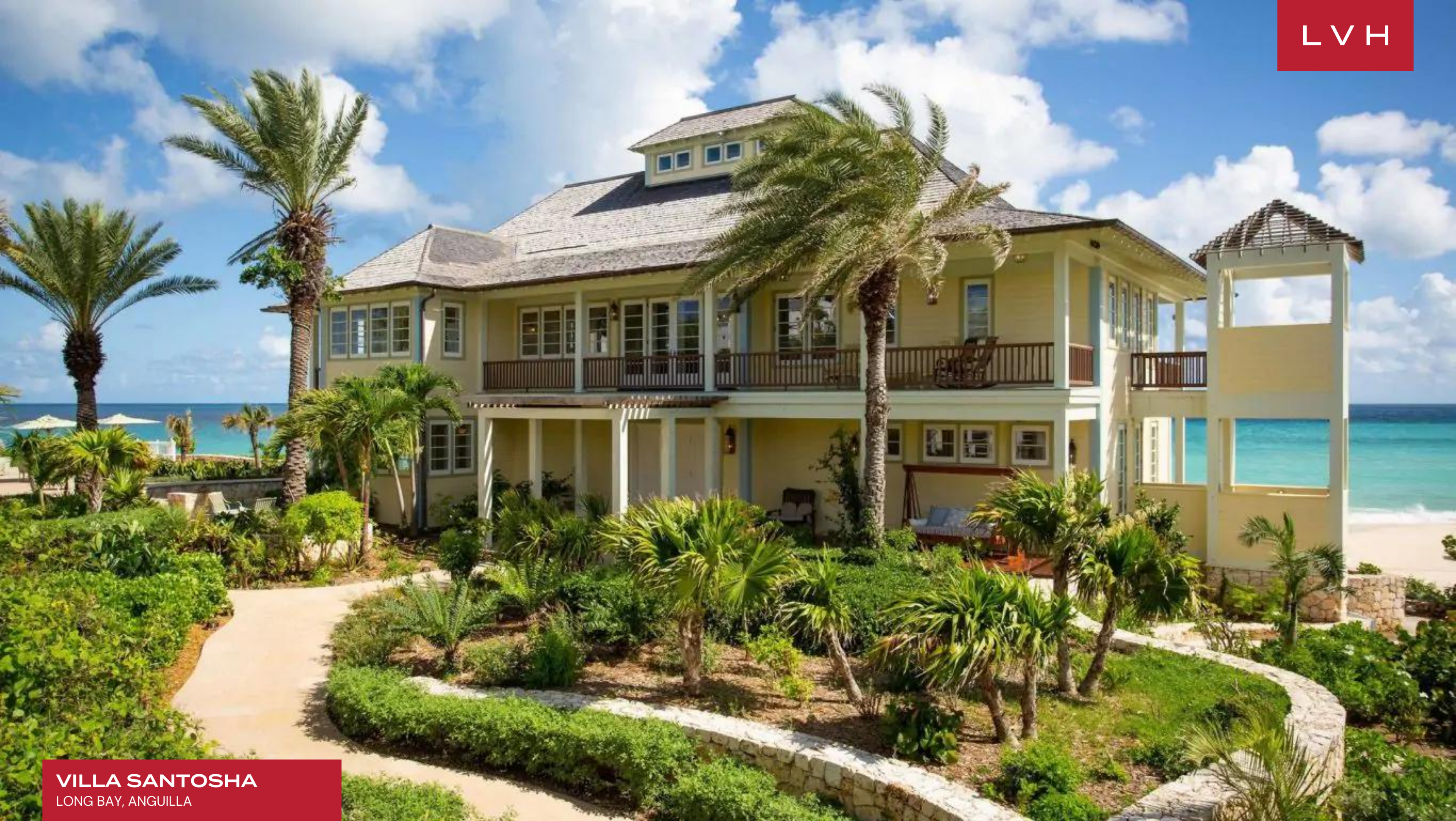
VILLA SANTOSHA LONG BAY, ANGUILLA