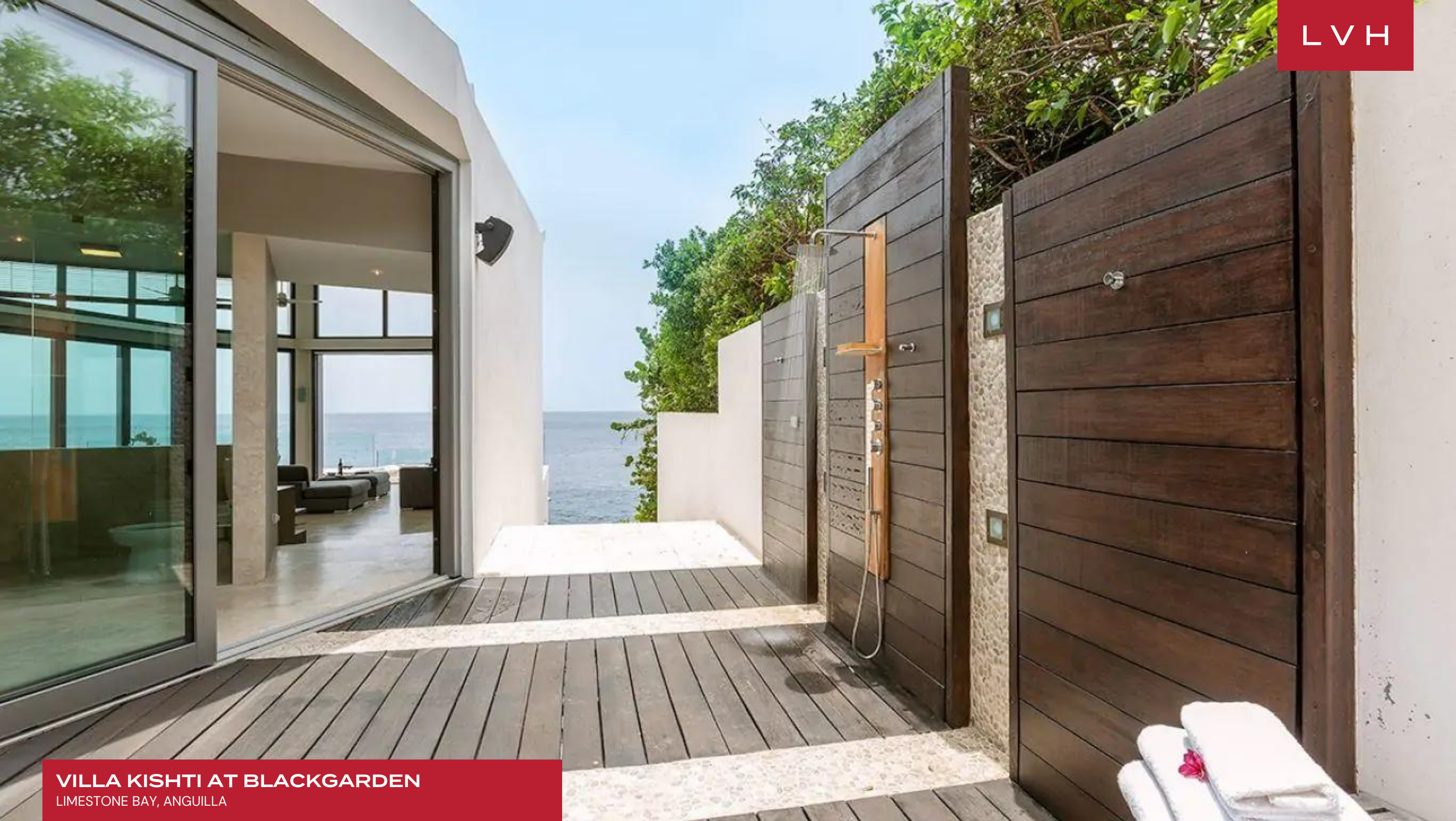
VILLA KISHTI AT BLACKGARDEN LIMESTONE BAY, ANGUILLA