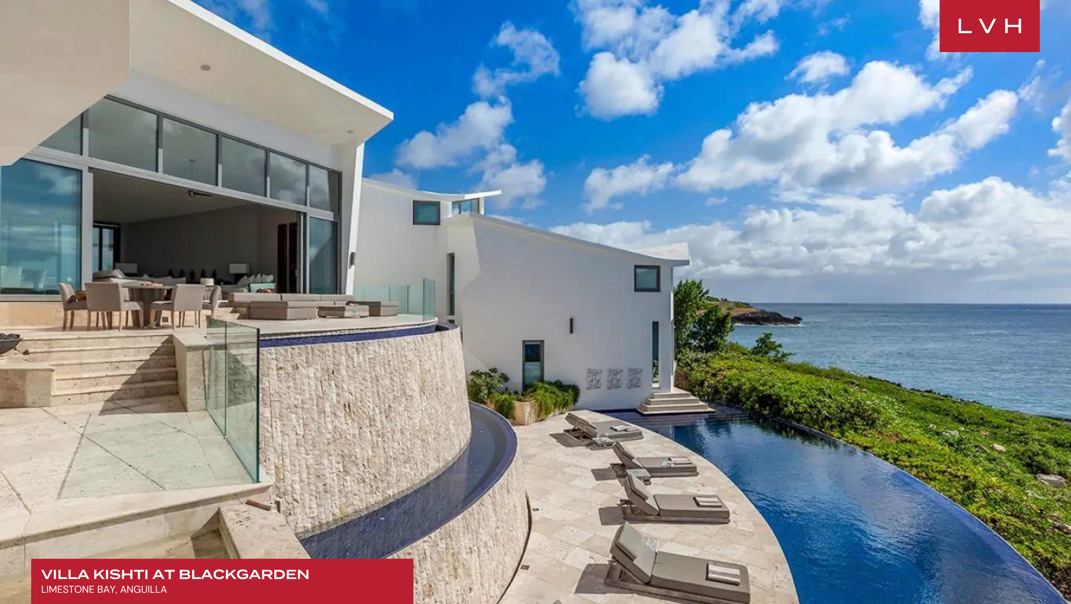
VILLA KISHTI AT BLACKGARDEN LIMESTONE BAY, ANGUILLA