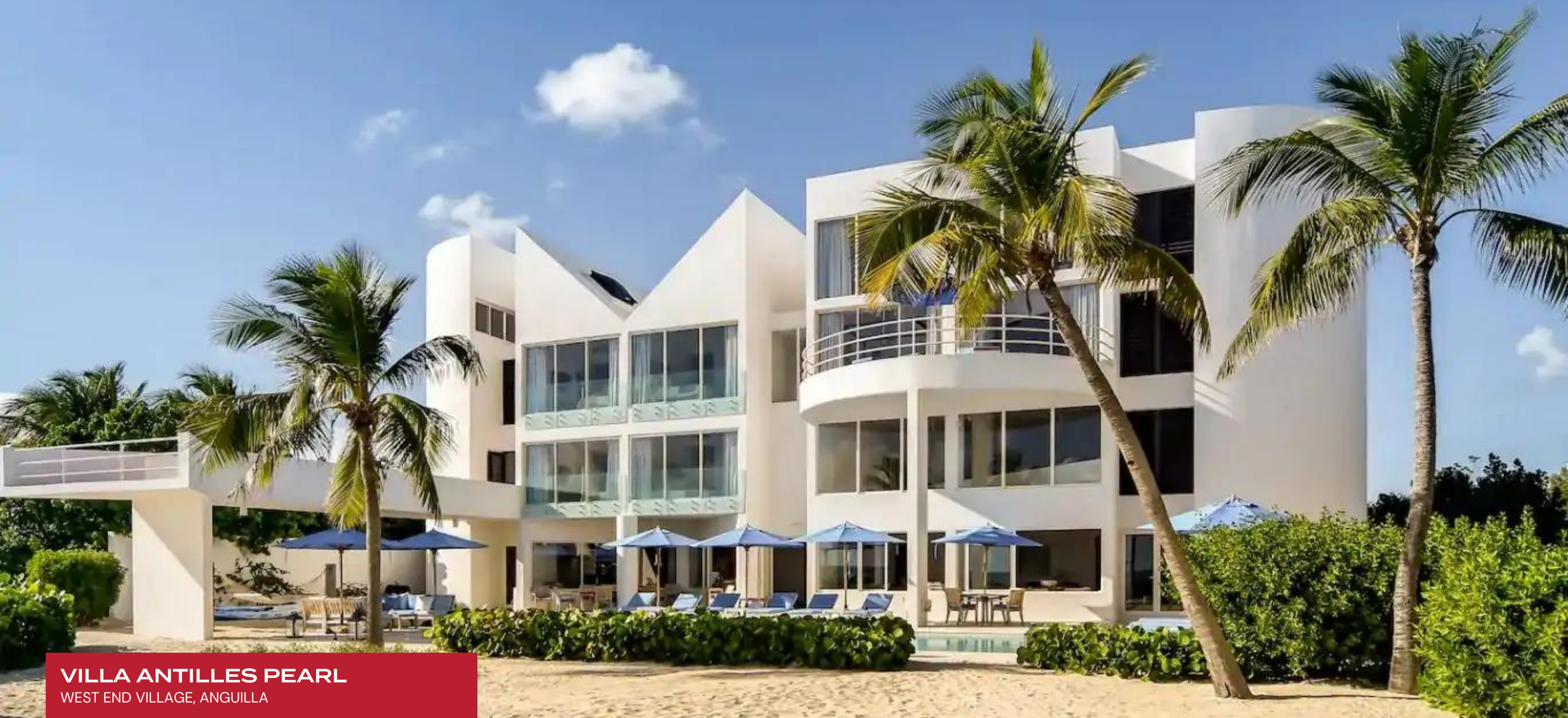
VILLA ANTILLES PEARL WEST END VILLAGE, ANGUILLA