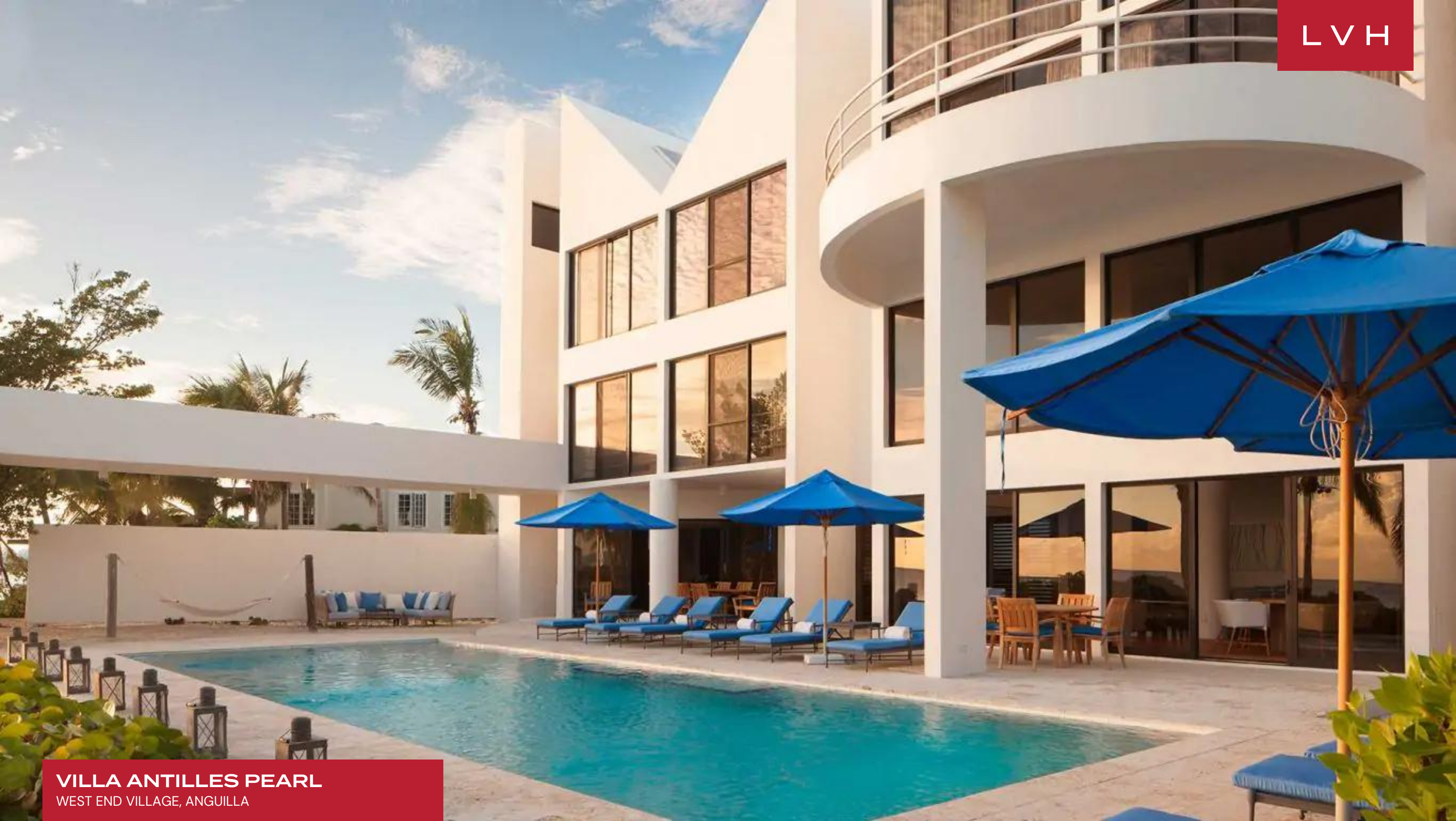
VILLA ANTILLES PEARL WEST END VILLAGE, ANGUILLA