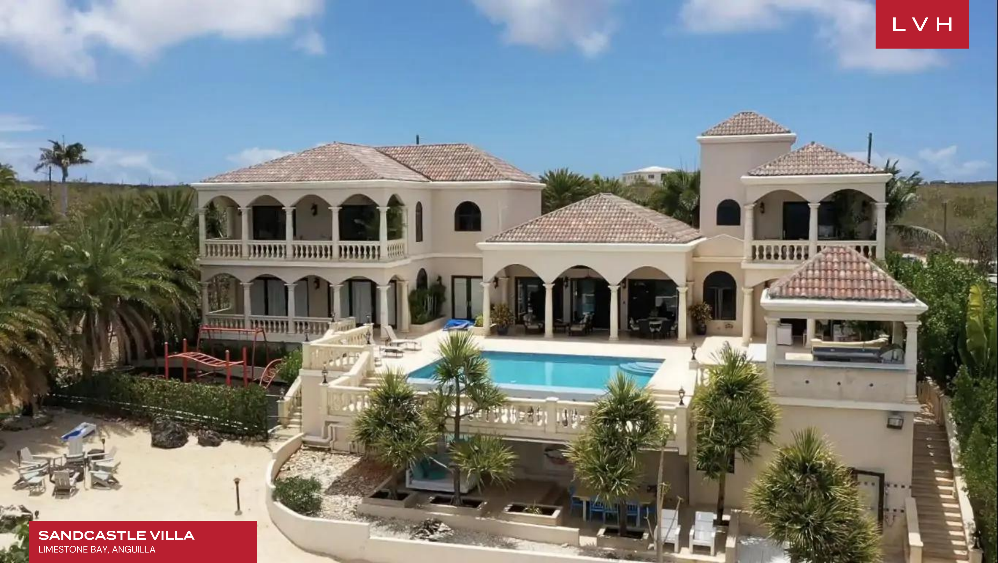
SANDCASTLE VILLA LIMESTONE BAY, ANGUILLA