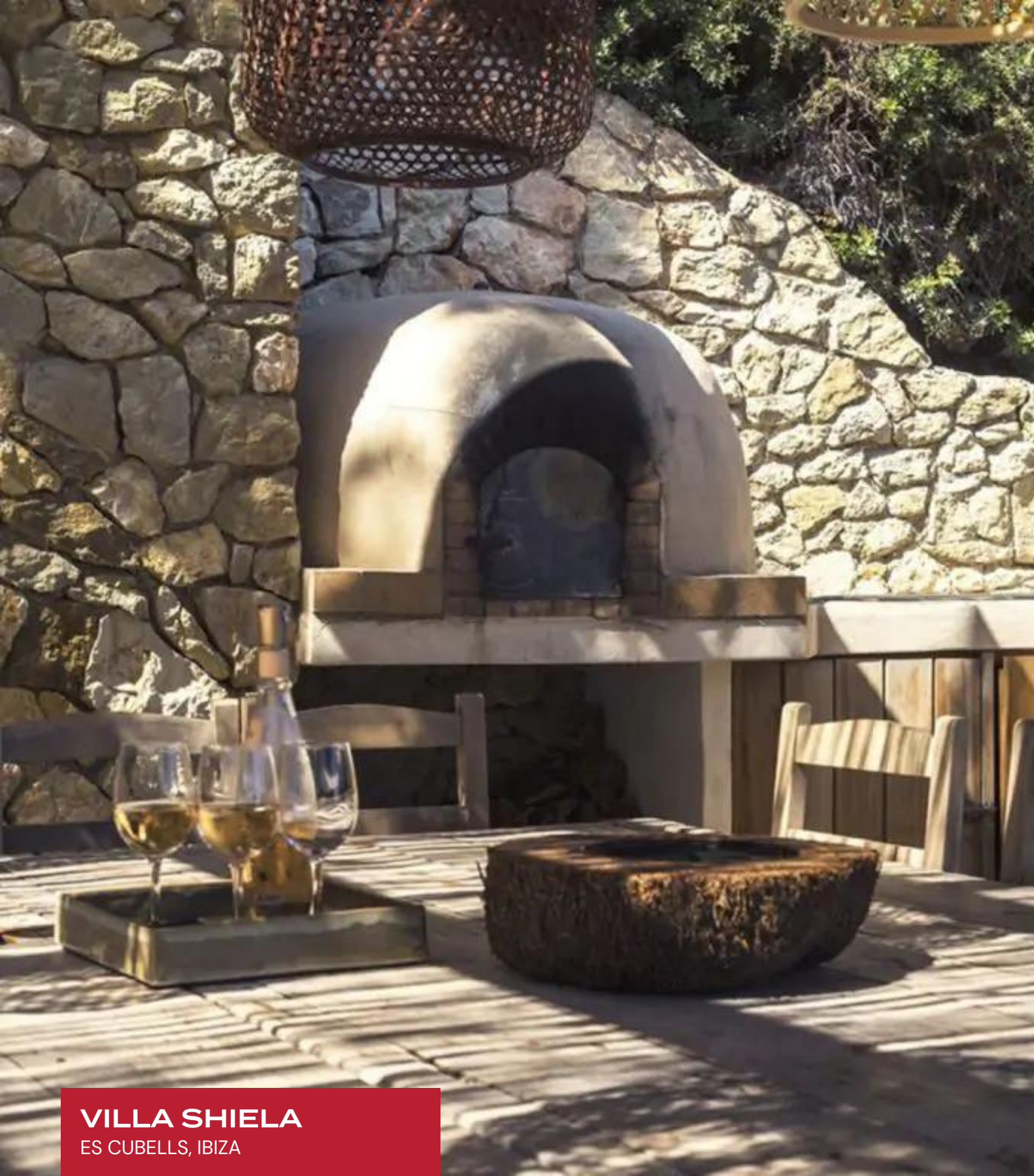
VILLA SHIELA ES CUBELLS, IBIZA