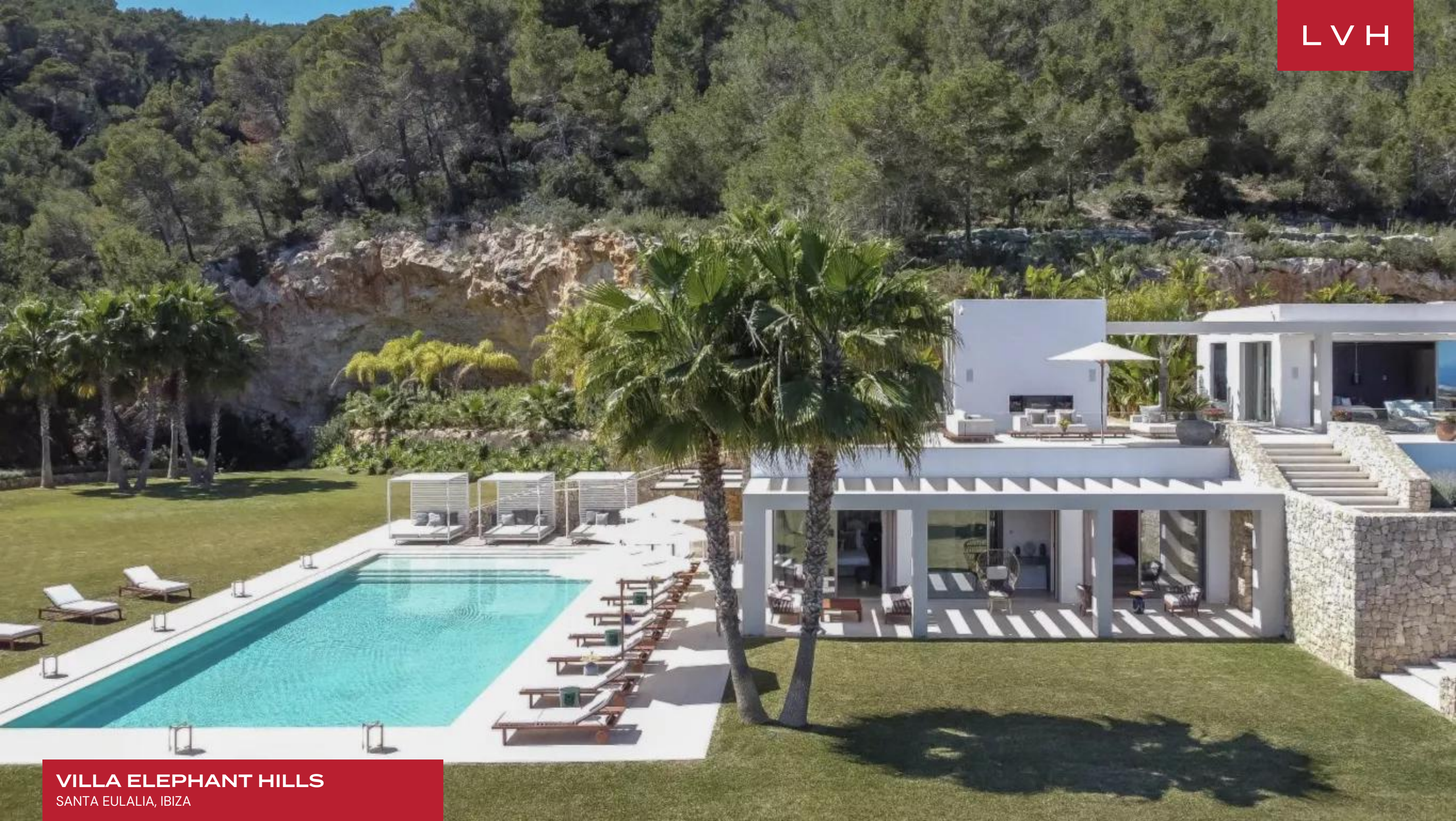
VILLA ELEPHANT HILLS SANTA EULALIA, IBIZA