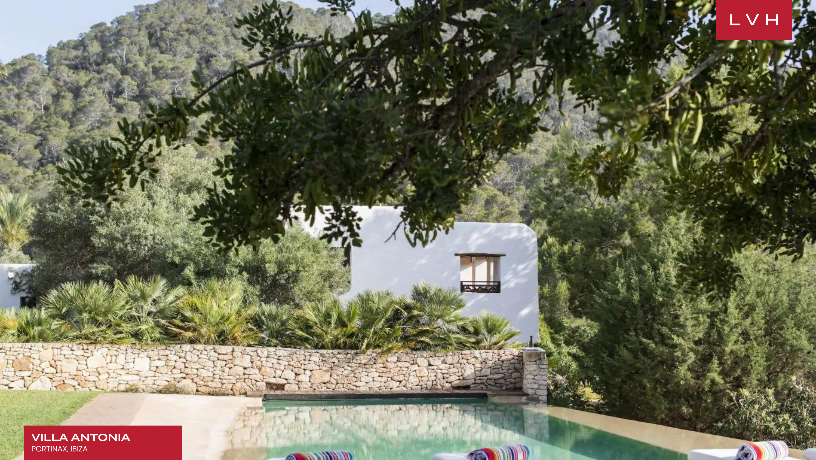
VILLA ANTONIA PORTINAX, IBIZA