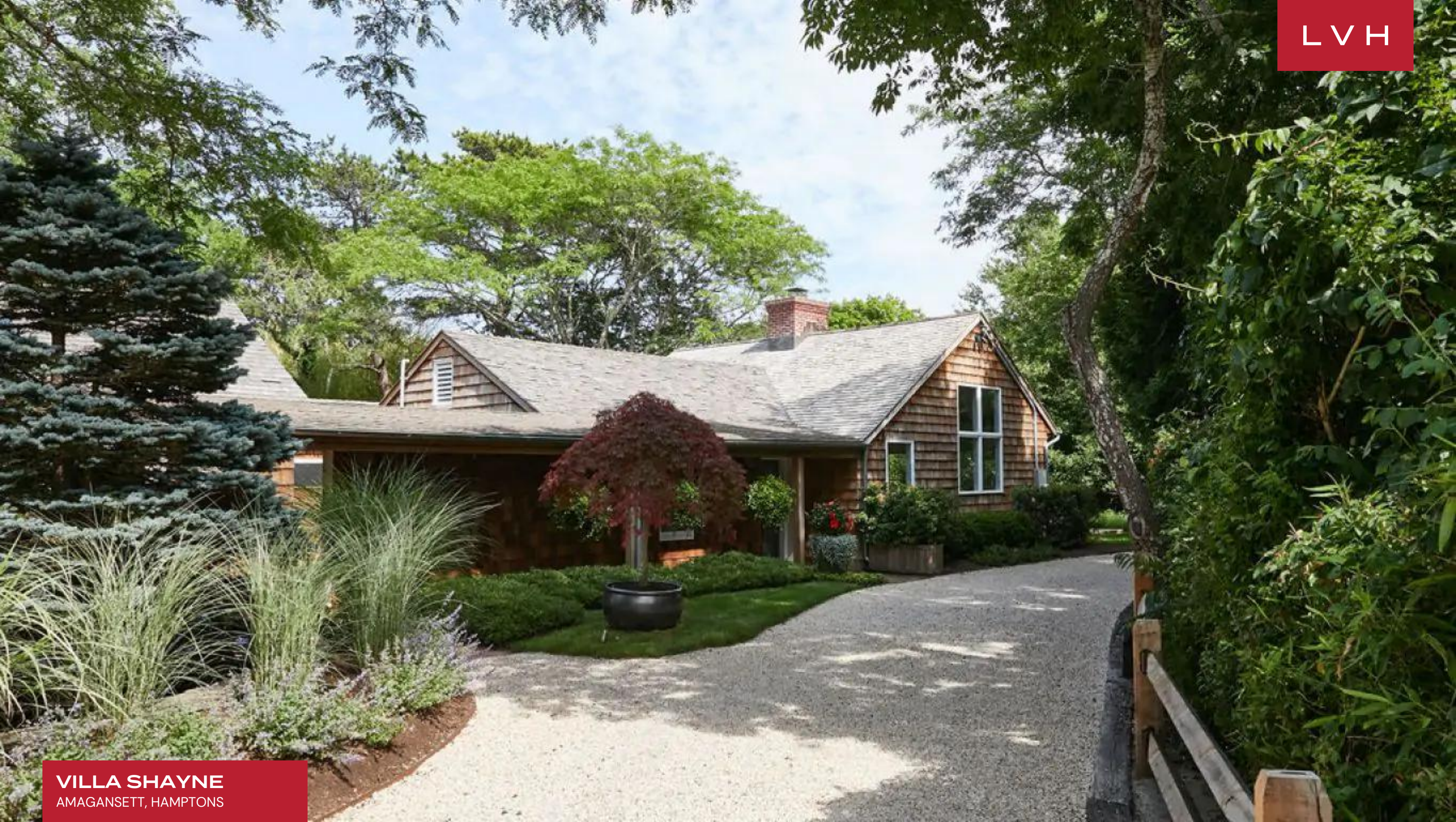
VILLA SHAYNE AMAGANSETT, HAMPTONS