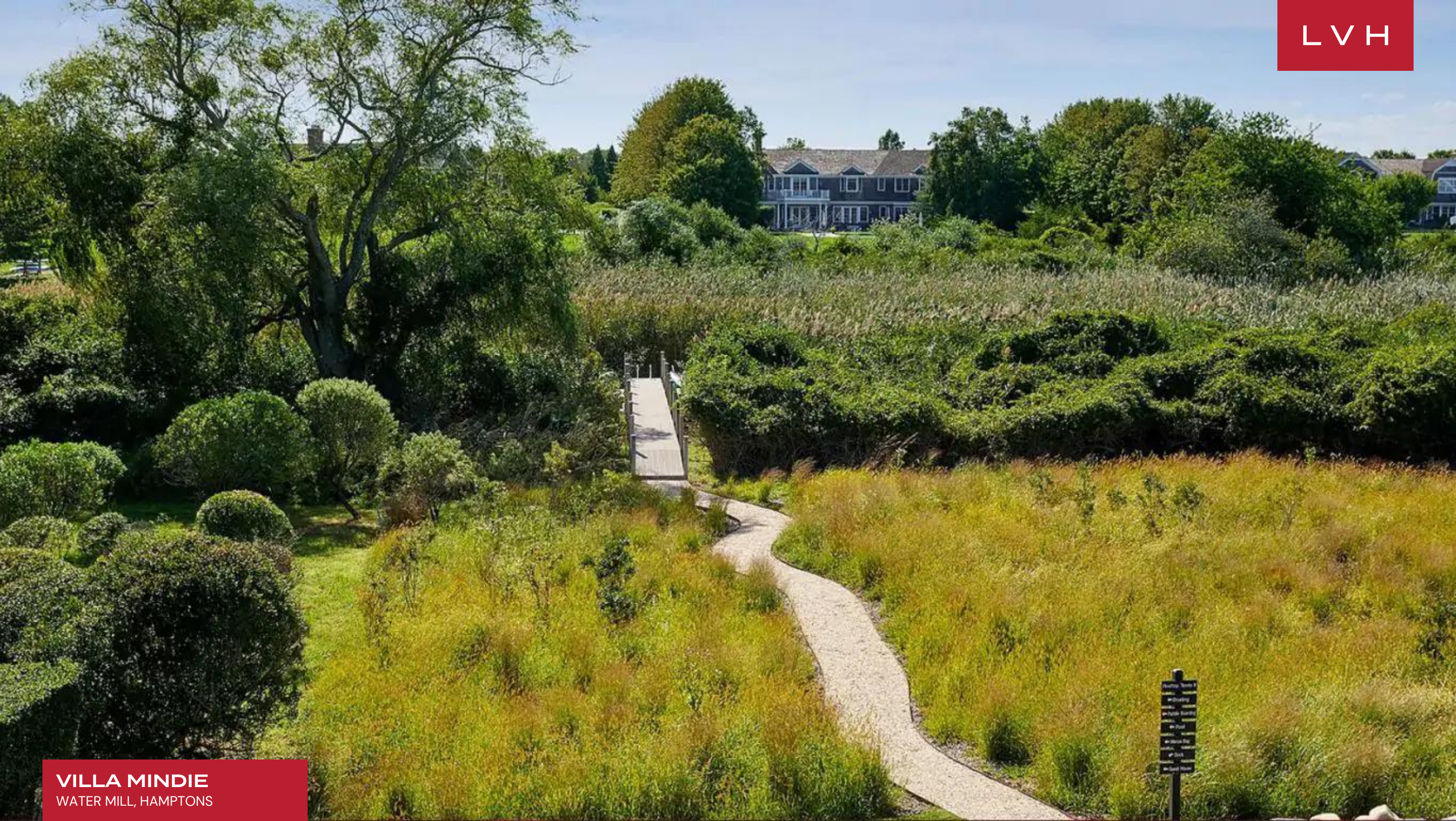
VILLA MINDIE WATER MILL, HAMPTONS

• Dining • Public Restrooms • Pool • Beach Bar • Dock • Golf Course