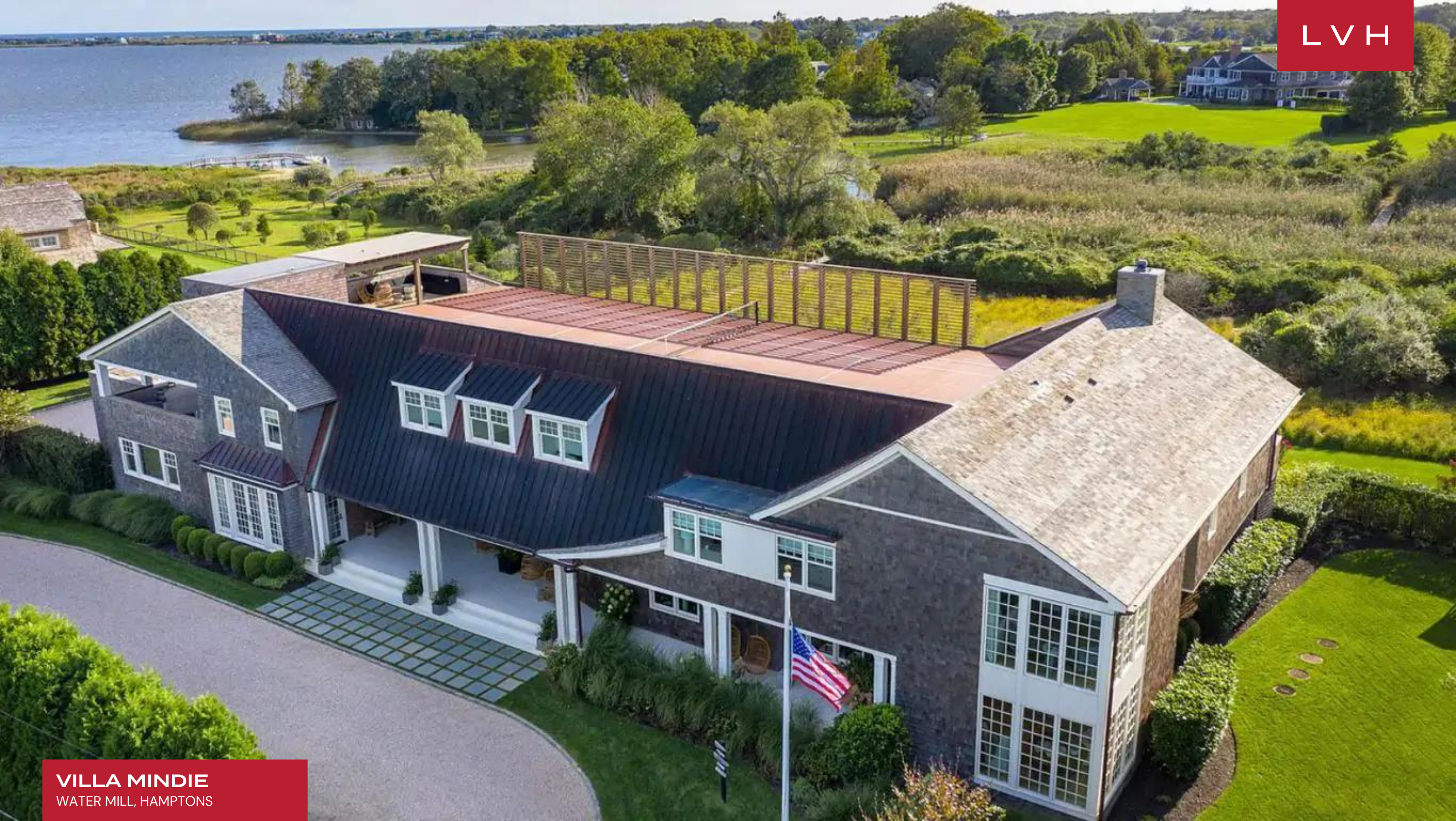
VILLA MINDIE WATER MILL, HAMPTONS