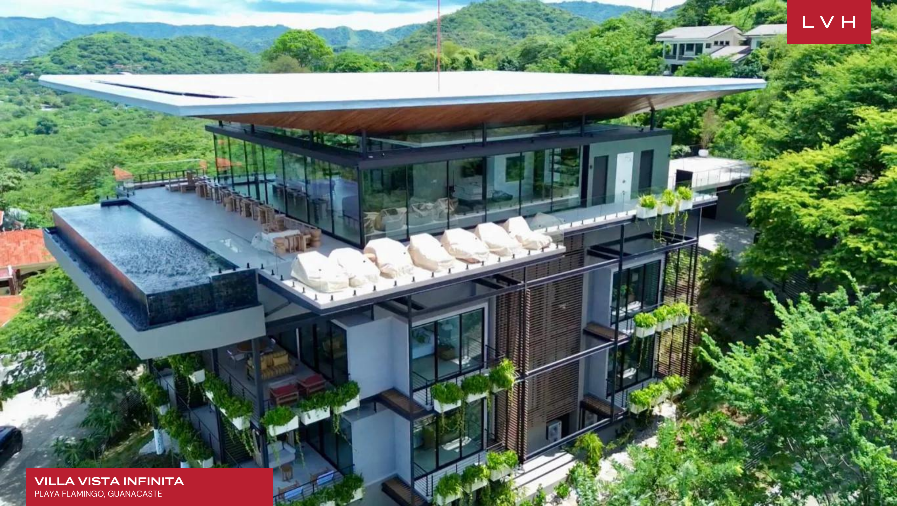
VILLA VISTA INFINITA PLAYA FLAMINGO, GUANACASTE