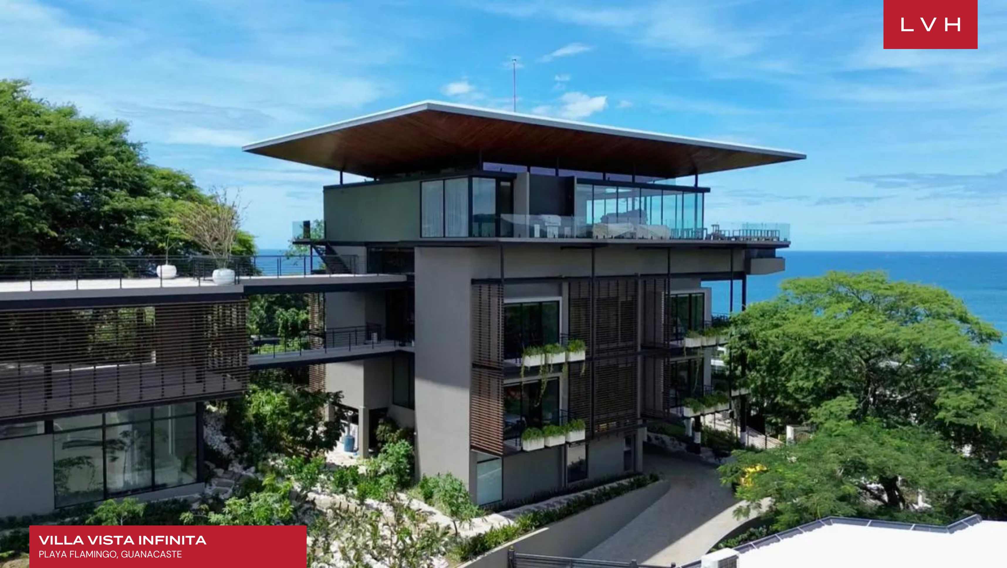
VILLA VISTA INFINITA PLAYA FLAMINGO, GUANACASTE