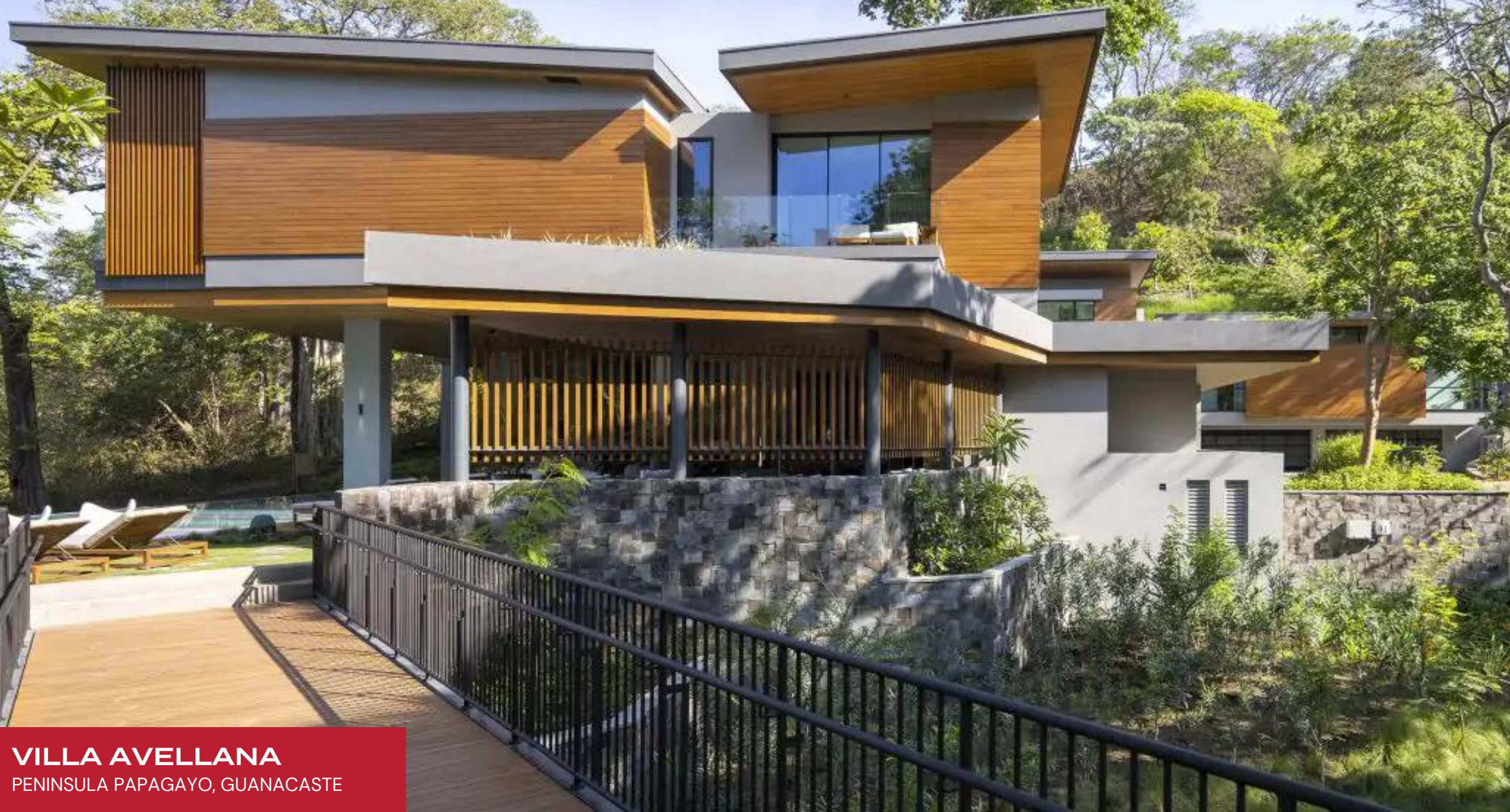
VILLA AVELLANA PENINSULA PAPAGAYO, GUANACASTE