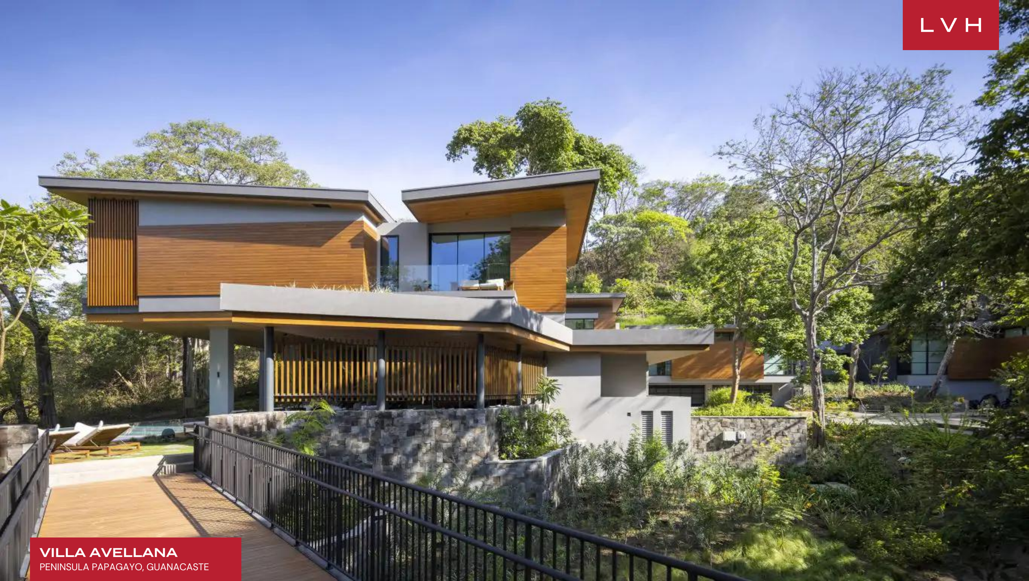
VILLA AVELLANA PENINSULA PAPAGAYO, GUANACASTE