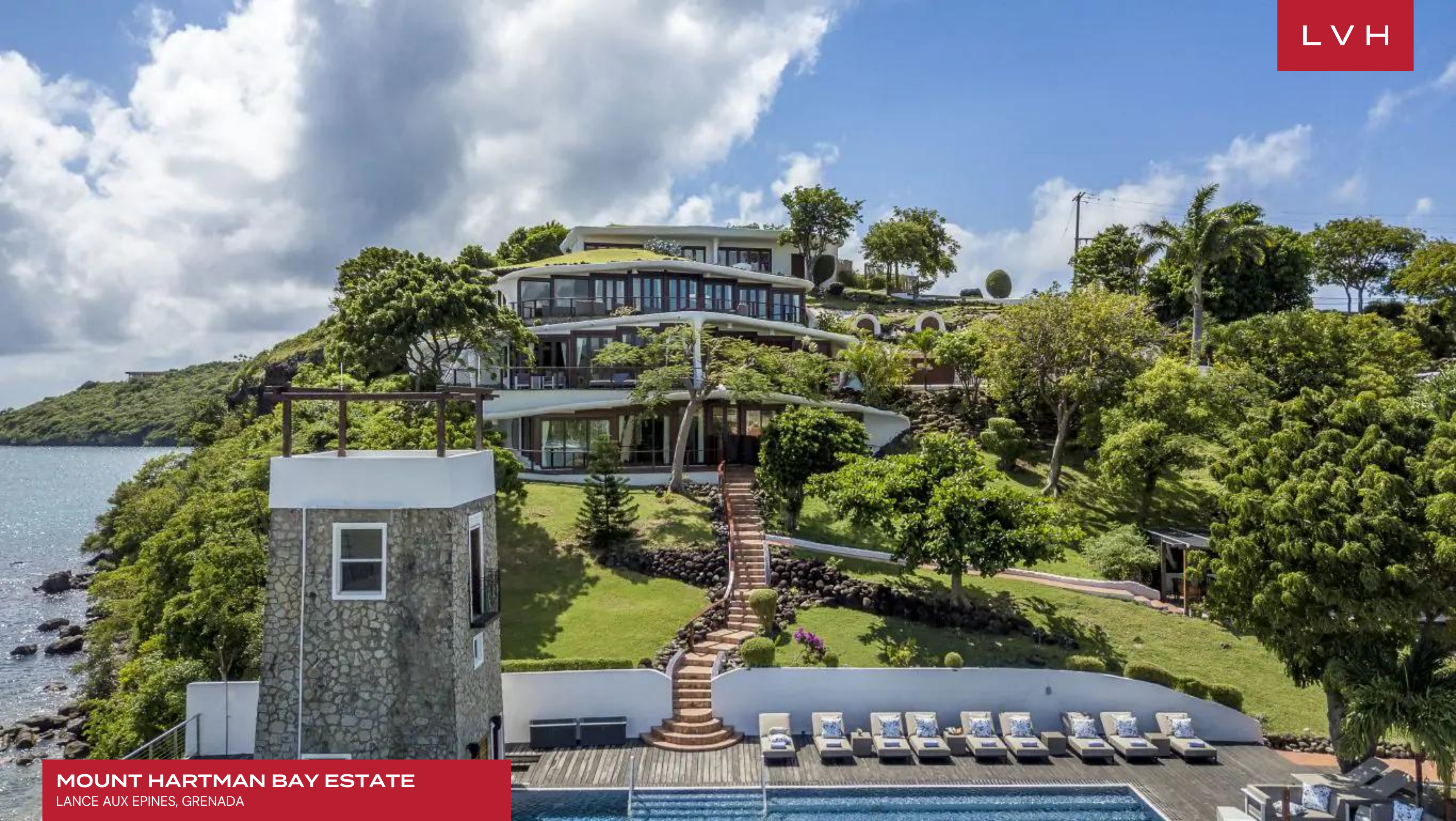
MOUNT HARTMAN BAY ESTATE LANCE AUX EPINES, GRENADA