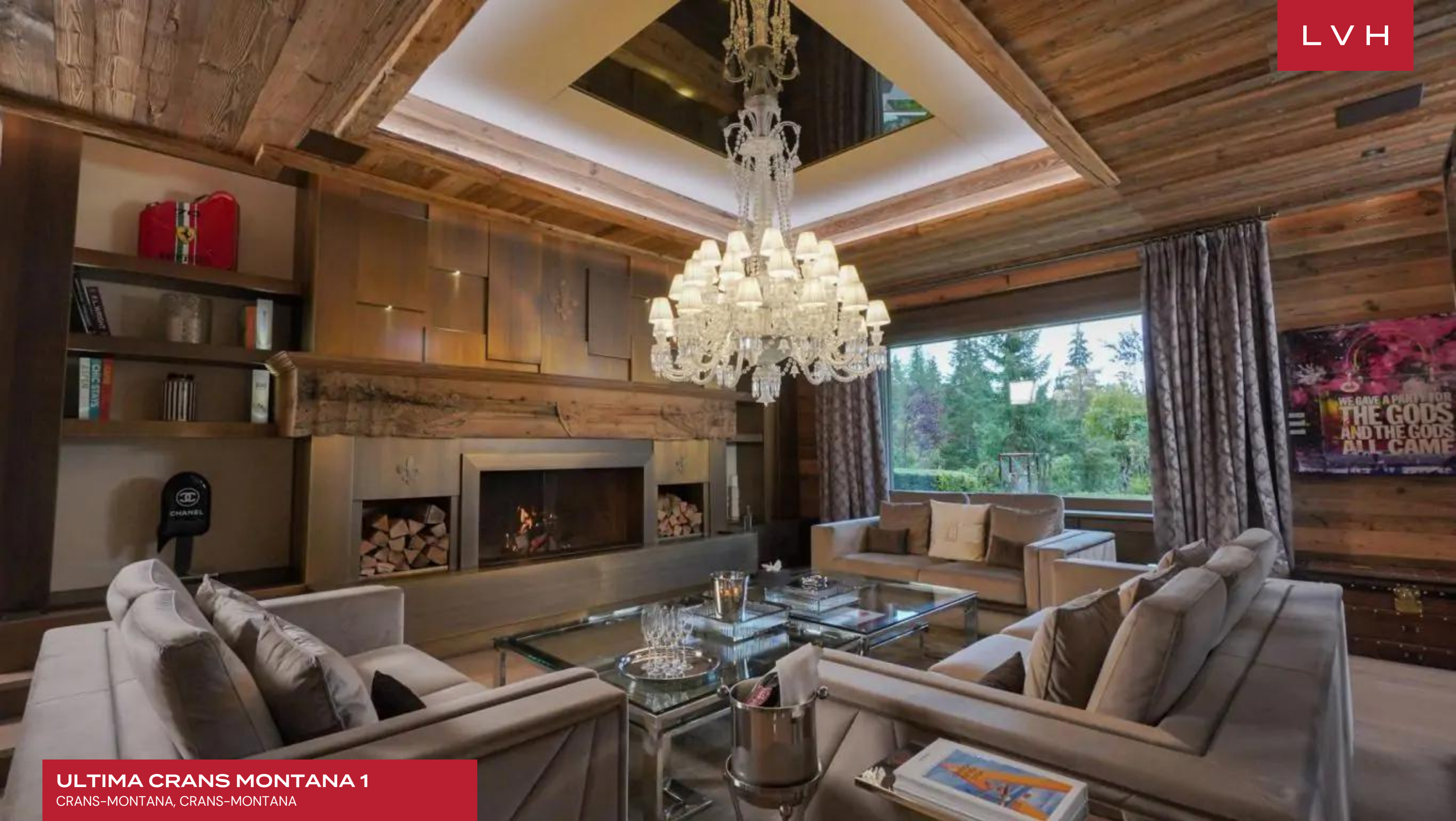
ULTIMA CRANS MONTANA 1 CRANS-MONTANA, CRANS-MONTANA