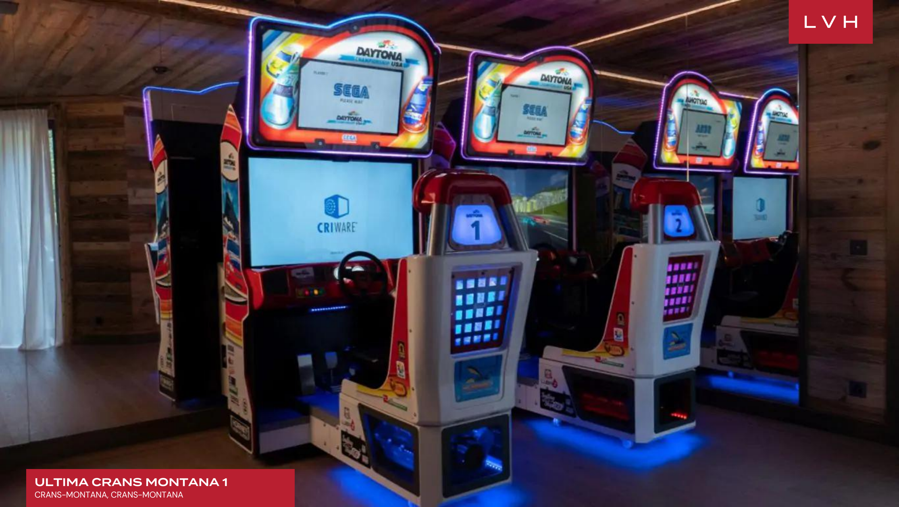
ULTIMA CRANS MONTANA 1 CRANS-MONTANA, CRANS-MONTANA