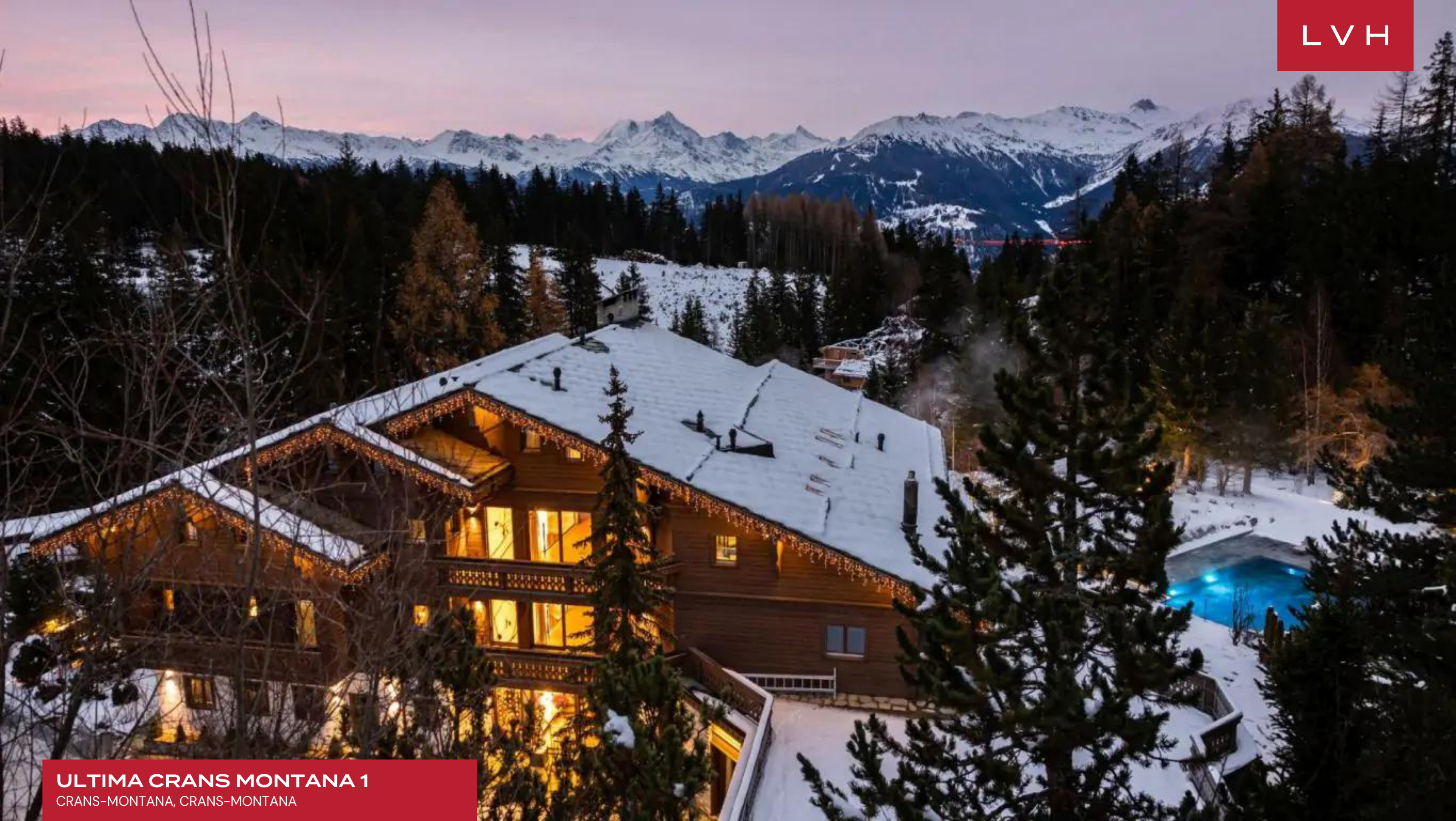
ULTIMA CRANS MONTANA 1 CRANS-MONTANA, CRANS-MONTANA