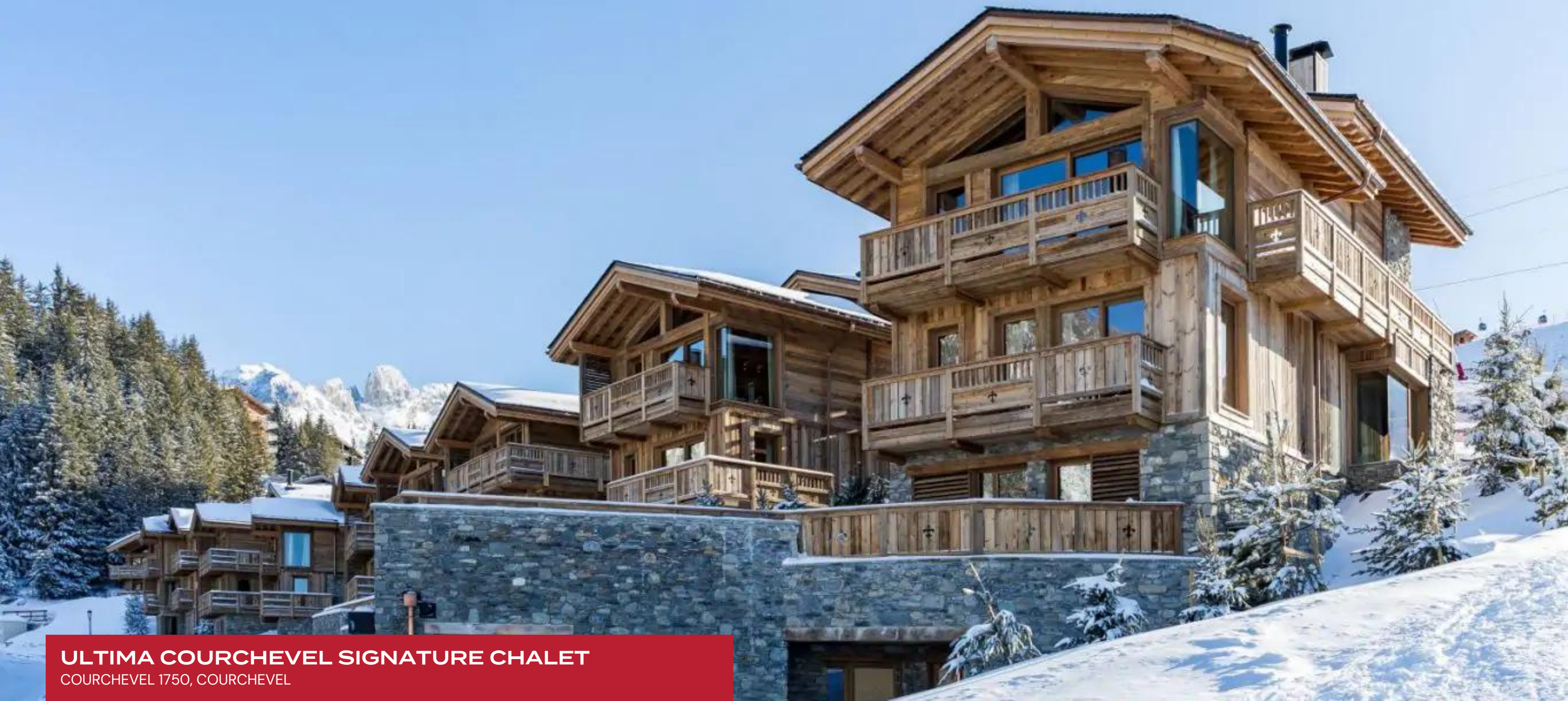
ULTIMA COURCHEVEL SIGNATURE CHALET COURCHEVEL 1750, COURCHEVEL