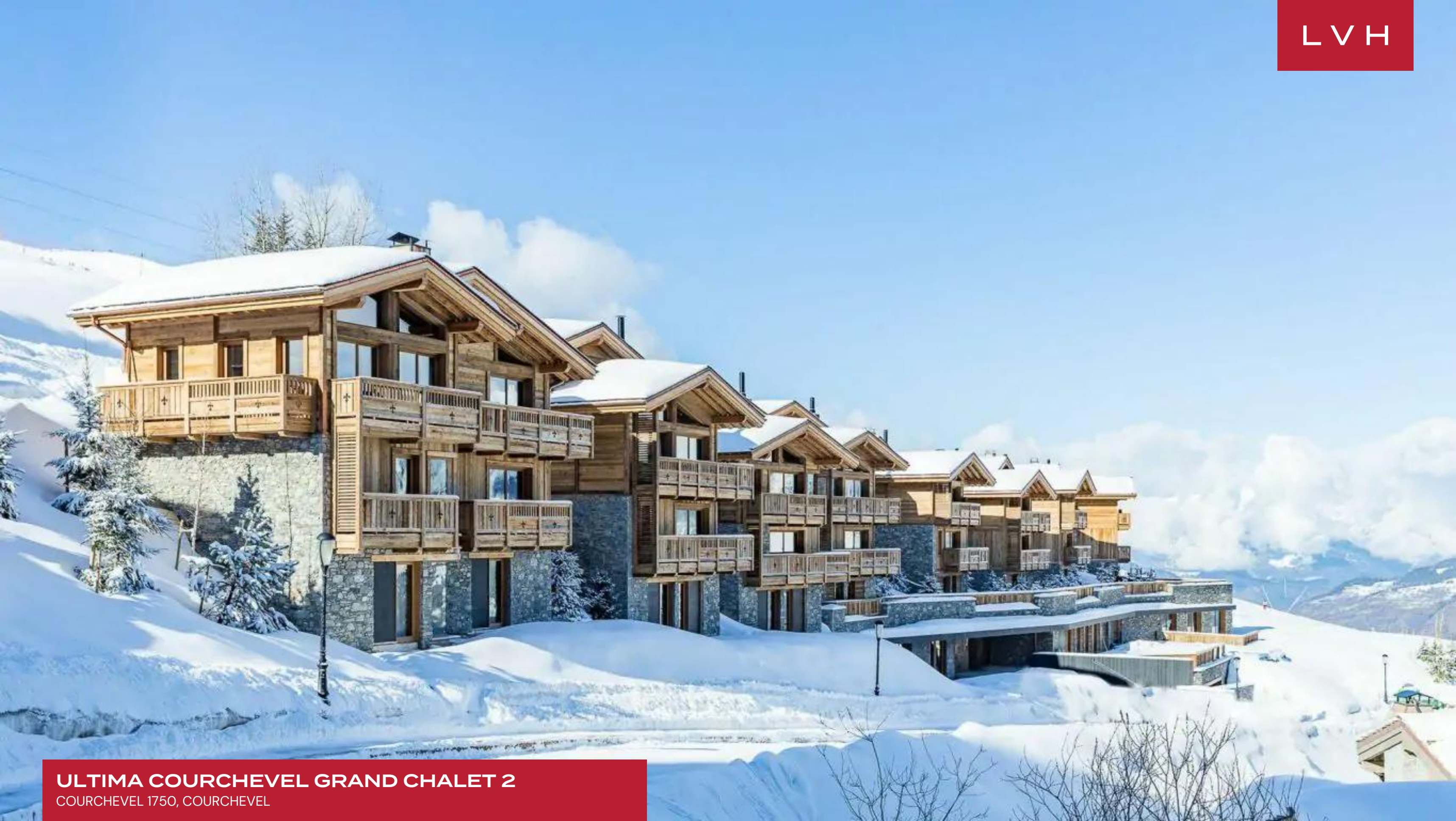
ULTIMA COURCHEVEL GRAND CHALET 2 COURCHEVEL 1750, COURCHEVEL