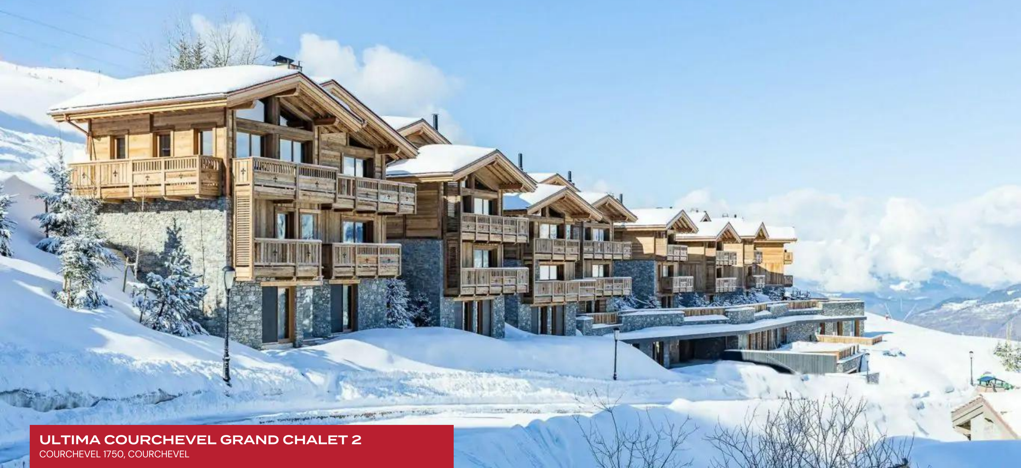
ULTIMA COURCHEVEL GRAND CHALET 2 COURCHEVEL 1750, COURCHEVEL