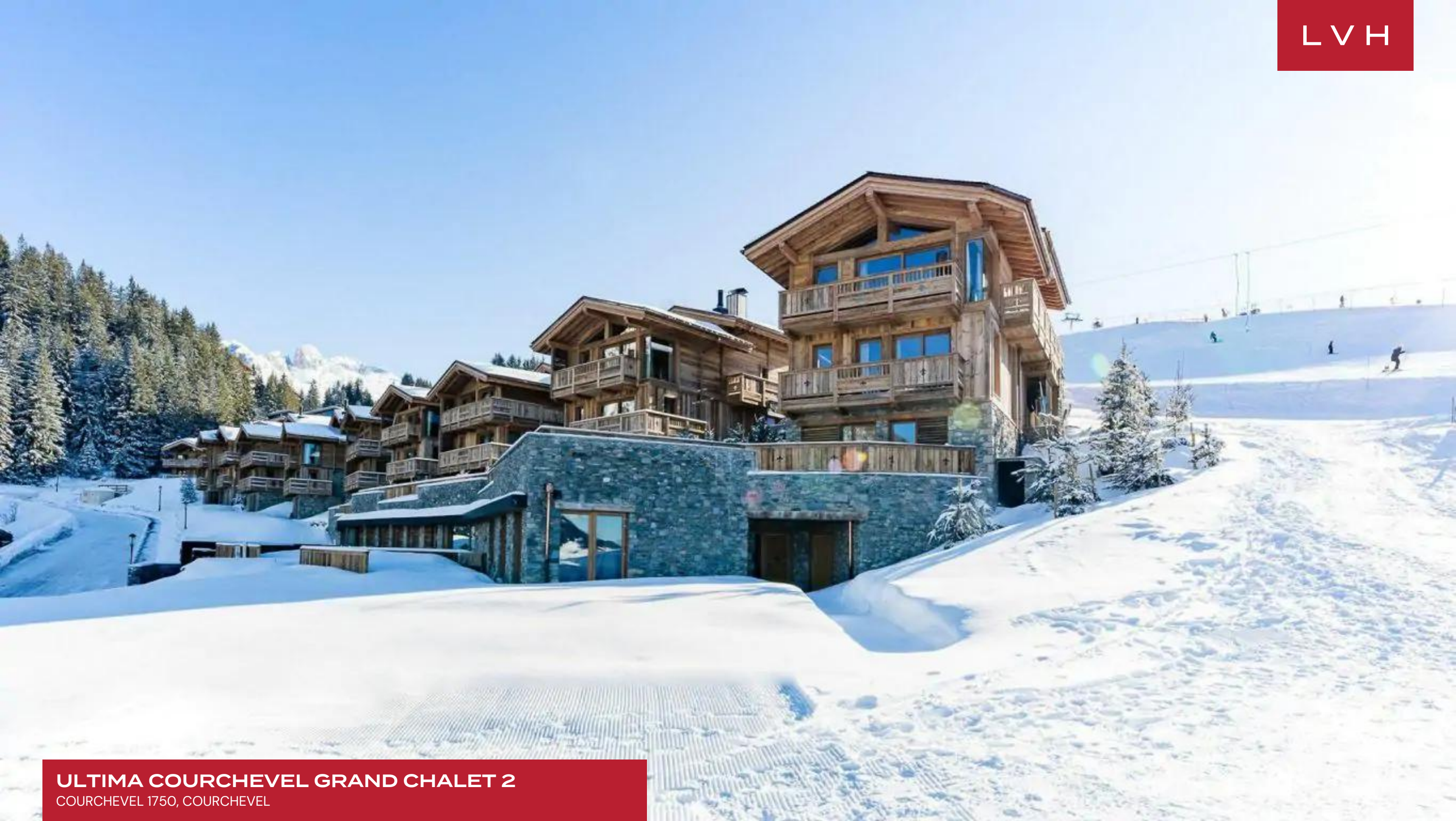
ULTIMA COURCHEVEL GRAND CHALET 2 COURCHEVEL 1750, COURCHEVEL